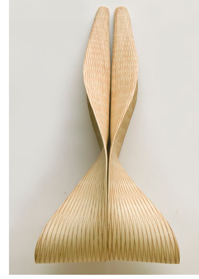
Contenedor de Sonidos. Stoneware with iron oxide. 40 x 26 x 72 cm.

For Rosalind Krauss the appearing of the grid in the work of well-known artists of the beginning of the 20th century shows a contradiction: on one hand, the grid answers a need of 'cooling down' of the ontological value