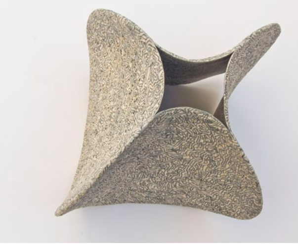
Gea. Stoneware with iron, cobalt and manganese oxides. 43 x 38 x 32 cm.

Another decorative function of this skin's sculptures that cannot be omitted is the one that reinforces our possibility to speculate over its open abstract vocation. This was fully expressed by Henri Focillon in Life of Forms : "speculation over an ornament is speculation over abstraction power and over the endless resources of our imagination".<sup>9</sup> This