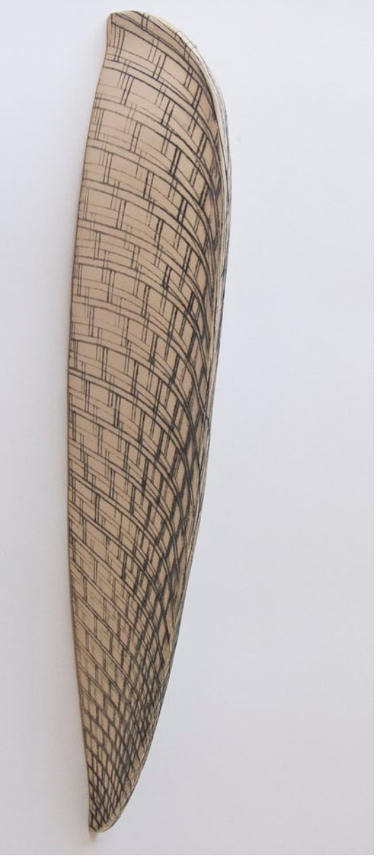
Máscara . Stoneware with iron, cobalt and manganese oxides. 17 x 8 x 69 cm.

Pluma (Feather) is another example that is more significant of this feminine sexual reference. The same voluptuousness is expressed in the waving shapes of Contenedor de sonidos . Even this idea of secret joint with the Earth's inner intimacy seems to be included in the name of the piece. Cueva a Cuatro Aguas (Cave four waterfolded), though its shape is not related to the sexual link of the other pieces. This piece is a perfect example of the geometric resources used by Oriza to translate her shapes into a double dialectic between the inside and the outside, between emptiness and fullness.