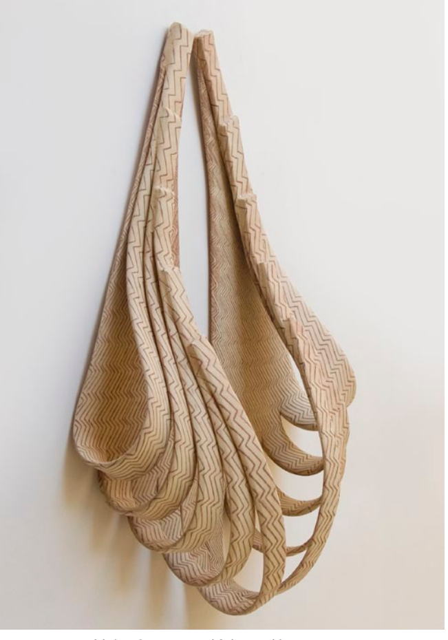
Aldaba. Stoneware with iron oxide. 47 x 16 x 68 cm.

of art should be seen as two chains of inner emptiness, meanwhile they have a dialogue with the empty space that divide the two columns of 'links'. In Vacio inagotable (Endless emptiness) this undefined progression is highlighted by the virtual movement of the winding lines drawn inside and outside of the rings, always changing according to the spectator's point of view. The same happens with Aldaba (Door knocker). Thus, situated in front of the sculpture, we appreciate just the optic game of the outside lines but if we move slowly towards a side of the work of art, inside lines get in to our visual field until they reach the first position in our visual field.