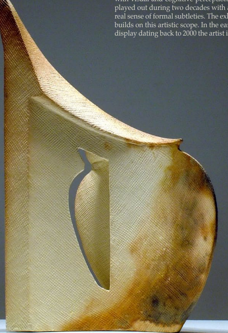
Facing page: vic mj&mb. 87 x 54 x 10 and 59 x 76 x 10 cm. Above: para pro. 60 x 38 x 15 cm.

throughout his almost 30 years as an independent artist: The vessel, conceived in form, transformed to an image. A red thread from his young, tentative beginning at the throwing wheel in the 1970s and until he stands in full artistic maturation in the current exhibition is the vessel, which has continuously led investigation after investigation. The bronze piece in the temple clearly marks that reflective questioning has added to the timeless beauty. The abstract form by no way promises functionality or even clear perception. Form has turned into an image and image has turned into a question. A hallmark of McWilliam is the flattening of the form and the play with visual and cognitive perception, which he has played out during two decades with accuracy and a real sense of formal subtleties. The exhibition clearly builds on this artistic scope. In the earliest works on display dating back to 2000 the artist investigates the