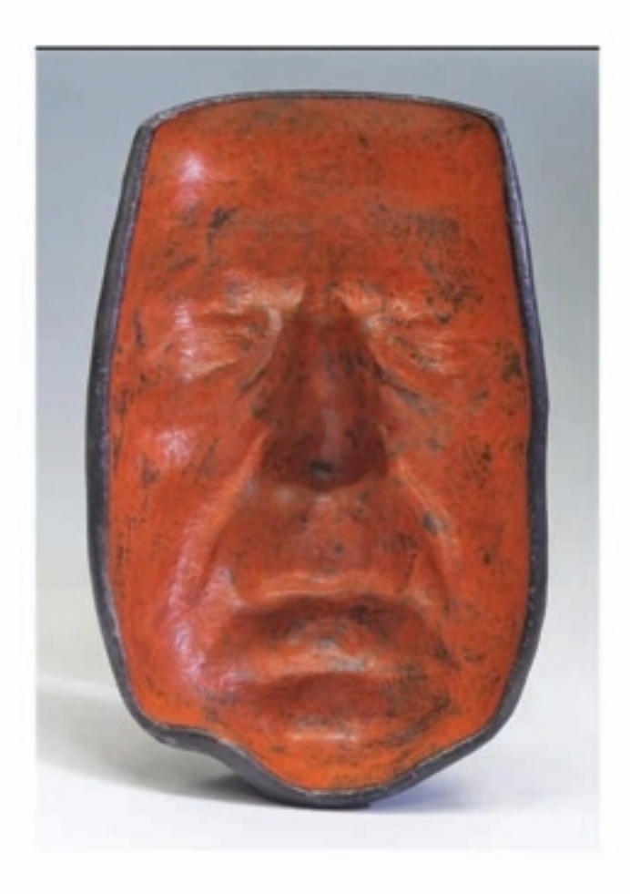
Masks / 20x10x5 cm / Stoneware, Terra Sigillata, Gas-Wood reduction firing