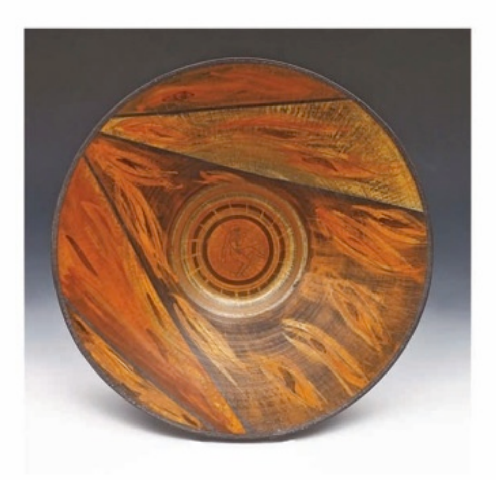
Plate #1 / 45x45x10 cm / Stoneware, Terra Sigillata,, gas wood reducton firing