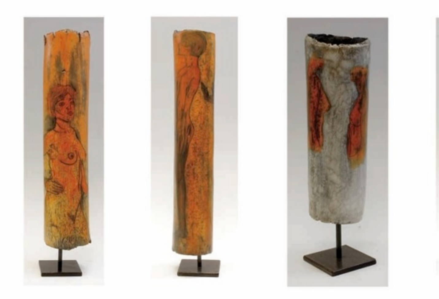
Images #2 / 15-20x40-70 cm / Stoneware, Terra Sigillata., gas wood reducton firing