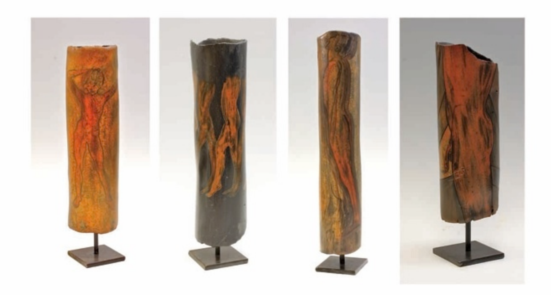
Images #1 / 15-20x40-70 cm / Stoneware, Terra Sigiilata., gas wood reducton firing