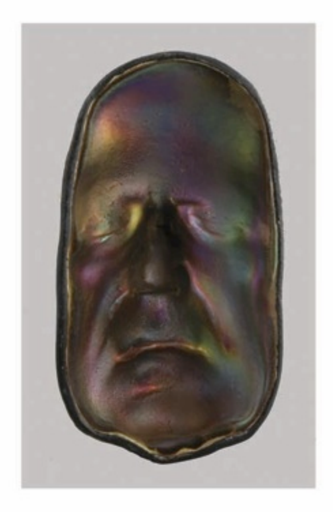
Masks / 20x10x5 cm / Stoneware, Pigment Luster, Gas-Wood reduction firing