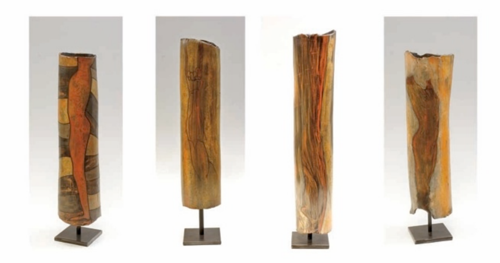
Images #3 / 15-20x40-70 cm / Stoneware, Terra Sigiilata., gas wood reducton firing