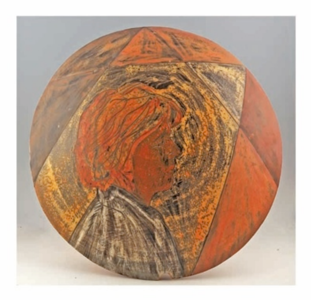
Mutlu Turkey / 41x41x3 cm Stoneware, Terra Sigillata, Gas-Wood reduction firing