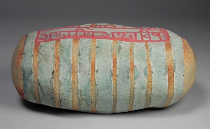
Sutra Stone. 22 x 12 x 10 in.

and could easily produce closed, finished work. That it has not is testament to Kacker's repeated willingness to lose himself in a much bigger landscape.