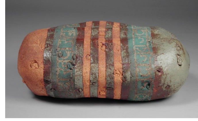
Sutra Stone. 22 x 12 x 10 in.

Between two and three foot high or wide and made of coarse stoneware that echoes the rocks of Ladakh or Sikkim, all three strands have an air of having been drawn out of the landscape. Unlike the cut, architectonic Markers , however, the Rocks and Stones are lumpen, primordial; and while their surfaces are highly embellished, the fine porcelain implants that glinted from many of the Markers are gone. Instead, the snatches of almost indecipherable Sanskrit, Hindi and Urdu that had begun to appear on the Markers have become central. In the case of the Rocks , insistent tattoos crawl over the majority of the surface; one, for example, quotes a passage from the 2000-year-old Patanjali treatise on yoga.