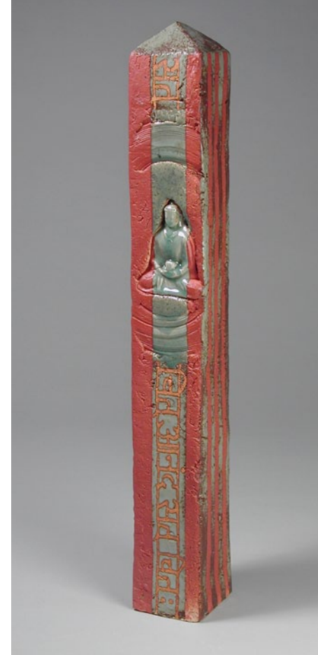
Facing page, above: Buddha Rocks. 34 in/h. Facing page, below left: Buddha Rock. 22 x 9 x 30 in. Facing page, below right: Buddha Rock-Mudra. 23 x 9 x 34 in. Above left, centre and right: Spirit Markers. 34 x 5 x 5 in.