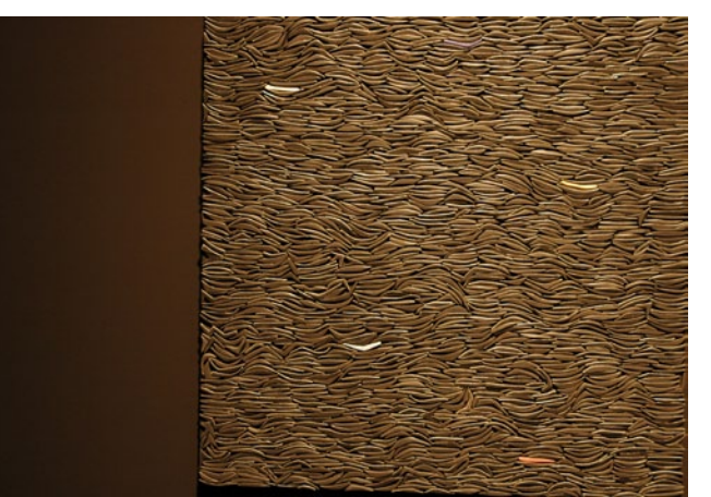
Top: Globalized. Stoneware fired at 1260°C. 1.05 x 1.4 m. Above: Bark. Stoneware fired at 1260°. 80 x 80 cm (ea. panel).

prevails, from the humidity of the stagnated waters in small ceramic trays, the spectator senses the first signs of vegetal life: primitive forms, shapes, the first colours, the first elemental points of white, green, red and yellow. A still very feeble light softly wraps the shapes of the pieces. The incipient appearance gives way to the eruption of colour. The darkness seems to be shyly retracting to give way to light and to show the splendour of nature, represented in a third stage by the multiplicity of small pieces drowning in space: the exuberance of organic forms, crowned with vibrant colours, green and red, makes us participants in a new moment. The change can be sensed. A fourth stage indicates it and is represented by a sea of fingers; fingers with feminine shapes that seem to wave with the wind, a white tapestry of silenced voices that shake our spirit: they show us the way and they invite us to action.