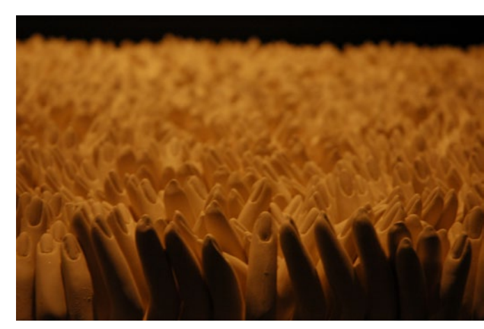
Top: Emerging. Stoneware fired at 1260°C. 1.10 x 1.10 m. Above: Fingers. Stoneware fired at 1260°C. 1.10 x 1.10 m.

Is the end is getting nearer? Will it be the exact answer to our doubts? We continue our journey. Our steps merge with the black felt. All of the pieces seem to flow before us; a large panel hanging lightly culminates our journey. The intensity of the light and the soft colours blurs the shapes and a subconscious urge impels us to leave the penumbra and to get nearer to see clearer. Only by looking closely do we discover an enormous reredos covered with small faces, a puzzle of triangular shapes fitted perfectly that ascend towards