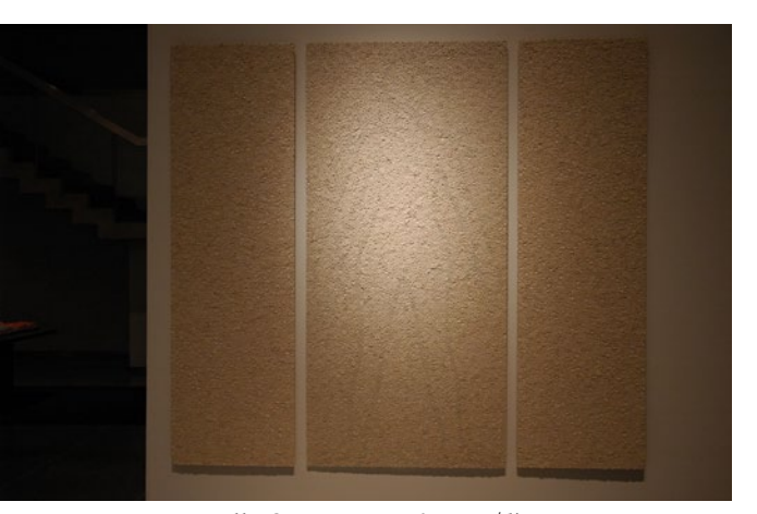
Top: Balls. Stoneware 1260°. 23 cm/dia. ea. Above: Tryptych of the New Human Being. Stoneware fired at 1260°C.

Six spheres flank one side of the lit path. One by one, the six spheres – with purple colour and satiny touch, crowned with a delicate and meticulous clay work - erect themselves in rejoice to show our symbols. Now that we have gained conscience through our journey, we recognize the concepts understood by ourselves. We see our feelings reflected when we contemplate an overflow of hearts and delicate small innocent mouths whispering. We identify ourselves with a group, a tribe, a border, a flag among all of those crowning the second sphere; our look caresses the word, the desire to communicate, symbolized by a colophon of letters; and with our hands we go over science, gracefully sculpted in a dance of numbers; the sixth and last small symbolic universe culminates with a hyper realistic image of elements that symbolize progress and technology.