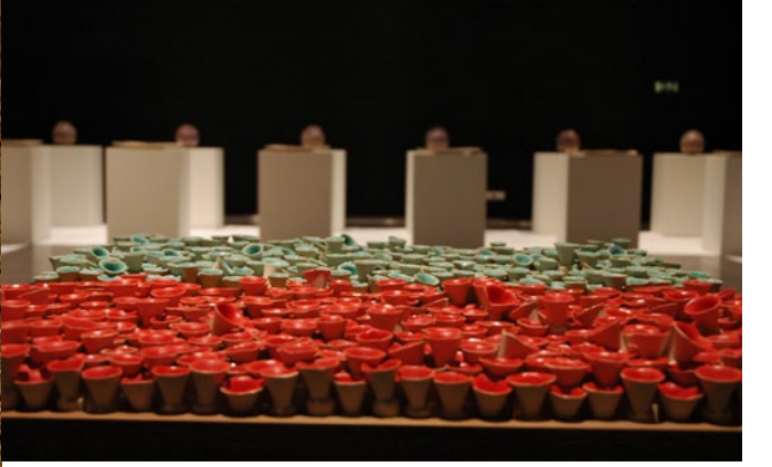
Overview: Seedbeds (Foreground). Stoneware fired at 1260°C. 43 x 83 cm/ea. seedbed.

touch it and use it, because in it we see reflected the everyday use of a beautiful container.