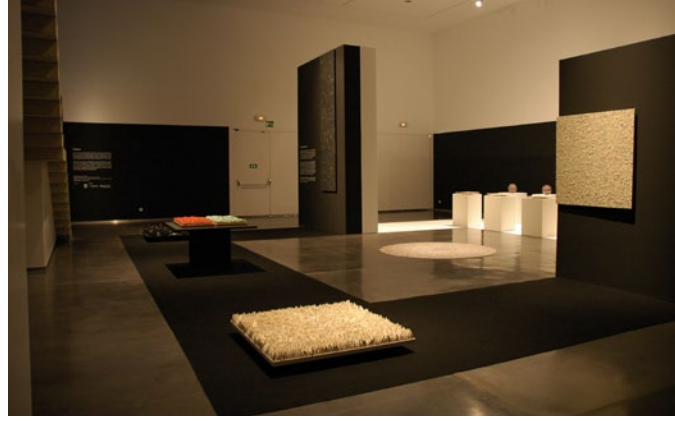
Above: Overview. Below: Eyes. Stoneware fired at 1260°C. 2 m/dia.

Origins was born with the wish to lead us towards the discovery of ourselves. With ceramics as a means of artistic expression, the reflection on our origins takes us back to the biblical Book of Genesis. Through