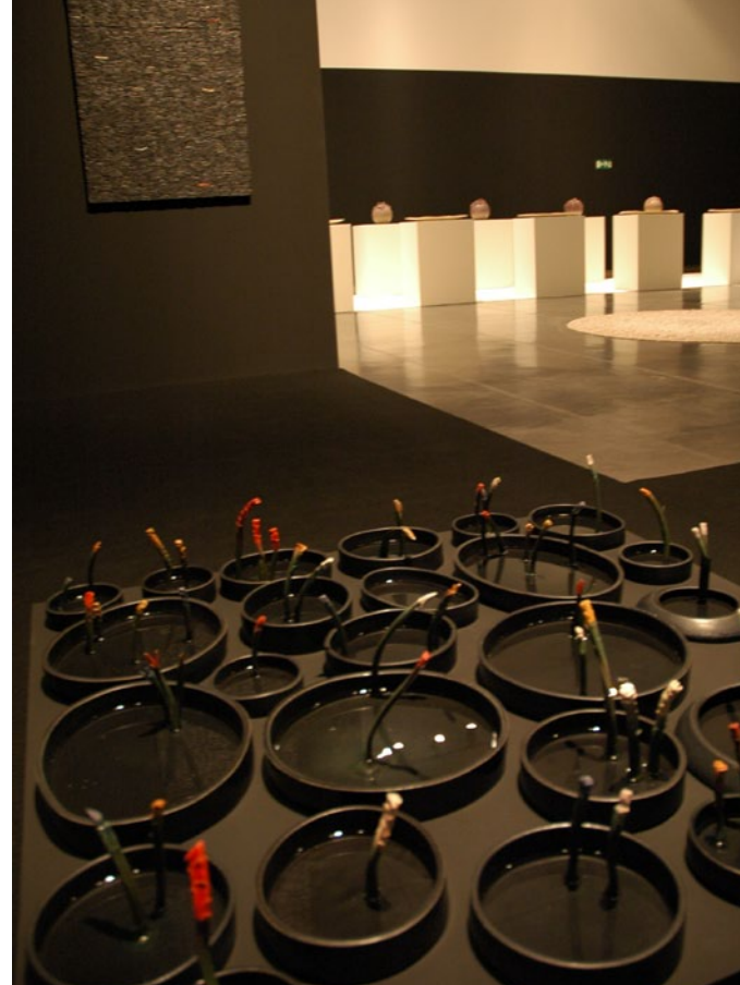
Humid (Foreground). Stoneware fired at 1260^{\circ} C. 1.10 \times 1.10 m .

We continue. The light path leads our tireless way towards the end of the journey. A large, imposing reredos rises before us. White on white, the small clay cells form an asexual human shape that only defines