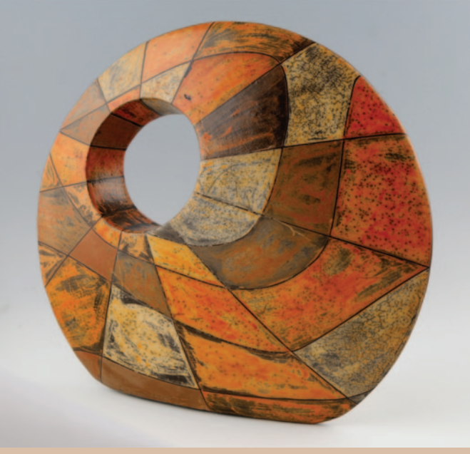
Top left: Zoom#1 . 2015. Stoneware, terra sigillata, handbuilt, wood reduction smoke fired. 35 cm. Photo by the artist. Top right: Him . 2015. Stoneware, terra sigillata, handbuilt, wood reduction smoke fired. 45 cm. Photo by the artist. Below: Doors Under Blue Sky . 2009. Stoneware, terra sigillata, copper, handbuilt, saggar fired. 130 x 35 cm. Photo by Yaron Porat-Gibsh. Facing page, left: Sealed Earth & Smoke . 2015. Stoneware, terra sigillata, handbuilt, wood reduction smoke fired. 125 x 75 cm. Photo by the artist.

was just a young man of 19 when I found myself in battle," Gibsh says, "and that was a harsh experience that haunted me for years. It was only two or three years ago that I finally managed to exorcise it, wrench it out of myself and into the clay I work with." In 2013, he created a series of pieces called Burnt Stones, dedicated to his fellow soldiers. The work was exhibited at the Seventh Biennale for Israeli Ceramics in the Eretz Israel Museum in Tel Aviv, which later kept them as part of the museum's permanent exhibit. The series consists of several lens-like objects and halved spheres with a terra sigillata slip and saggar firings using organic materials. The lens-like form is reminiscent of the armour of past warriors - round, complete, precise and protective. The halved spheres suggest the shape of a helmet, also a defensive artefact. The roundness and symmetry that project security, however, are at odds with the surface, which is alive with unsettling shades of fire. Signs of the organic materials burnt onto the objects, similar to burn scars on the skin, create a disturbing, bewildering sense of injury and pain.