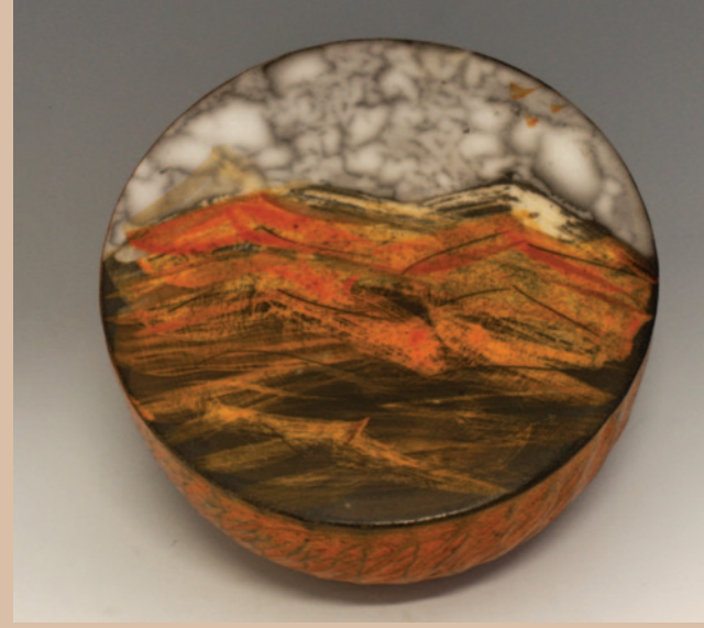
Facing page: Stelae (Detail). 2011. Stoneware, terra sigillata, handbuilt, saggar fired. 200 x 250 cm. Left: George. 2009. Stoneware, terra sigillata, handbuilt, saggar fired. 40 x 60 cm. Above: Night Scene. 2014. Stoneware, terra sigillata, wheel thrown, wood reduction smoke fired. 30 cm/d. Below: Burning Stones. 2013. Stoneware, terra sigillata, copper, wheel thrown, handbuilt, saggar fired. 19–25 cm/ea.