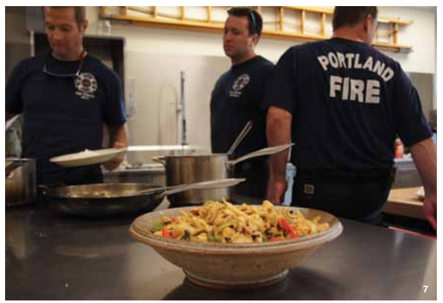
6 Bowls Around Town Project, 2013. Bowl pictured in its protective wooden box. 7 Bowls Around Town, one of the serving bowls shown in use by firefighters at a Portland fire station, 2013.