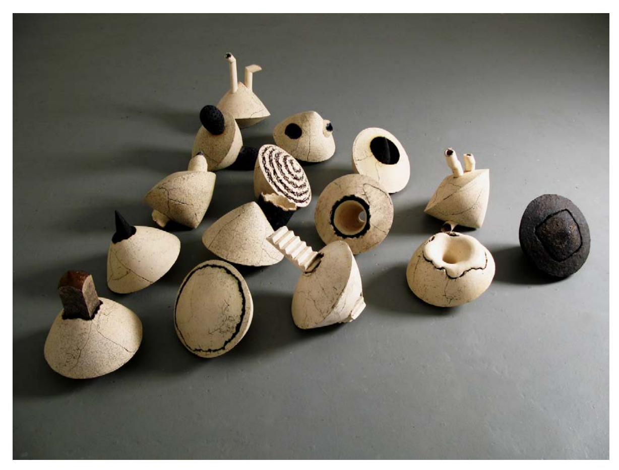
Jia-Haur Liang, Transitional space I, Stoneware, 2008