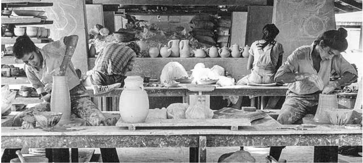
STUDENTS AT GOLDEN BRIDGE POTTERY | 1984