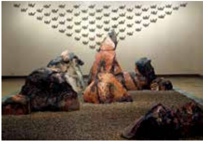
KYOTO PROTOCOL | 53' x 14' | 2004