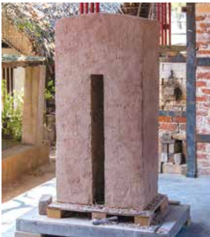
EYE OF THE NEEDLE 1, BEFORE FIRING