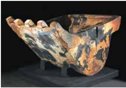
KURUKSHETRA | 57" L x 50" W x 32" H | 2000