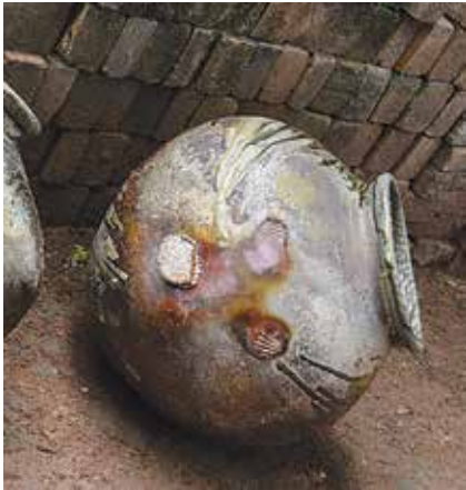
JAR FROM THE CHINNAGAMA | 2014