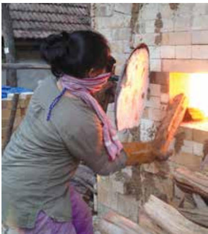
STOKING THE CHINNAGAMA