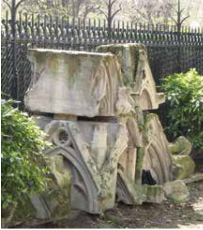
NOTRE DAME | PARIS | 2009