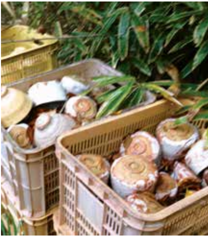
TEA BOWLS OUTSIDE TSUJIMURA SHIRO'S STUDIO | JAPAN | 2013