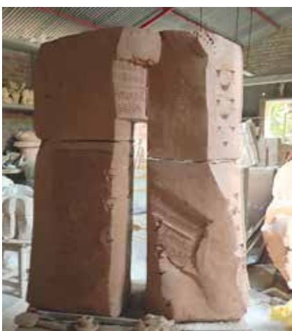
EYE OF THE NEEDLE 4, BEFORE FIRING

ceramic objects. The fire can be beneficent or cruel, or just plain boring. Needle 1 emerged as a stunning variation of materials I had been using for years—same palette but with a strikingly different balance: swaths of grey-blue and tawny brown matt glaze over an intense flame-flashed orange slip. I repeated the result on Shard 1, adding a broad run of deep transparent carbon-saturated dark grey. Now confident, in Needle 5 I returned to simplicity. Needles 1 and 5 should be re-titled. They are still about the uncertain repercussions of environmental degradation. They are still gateways, but in a remarkably different sense.