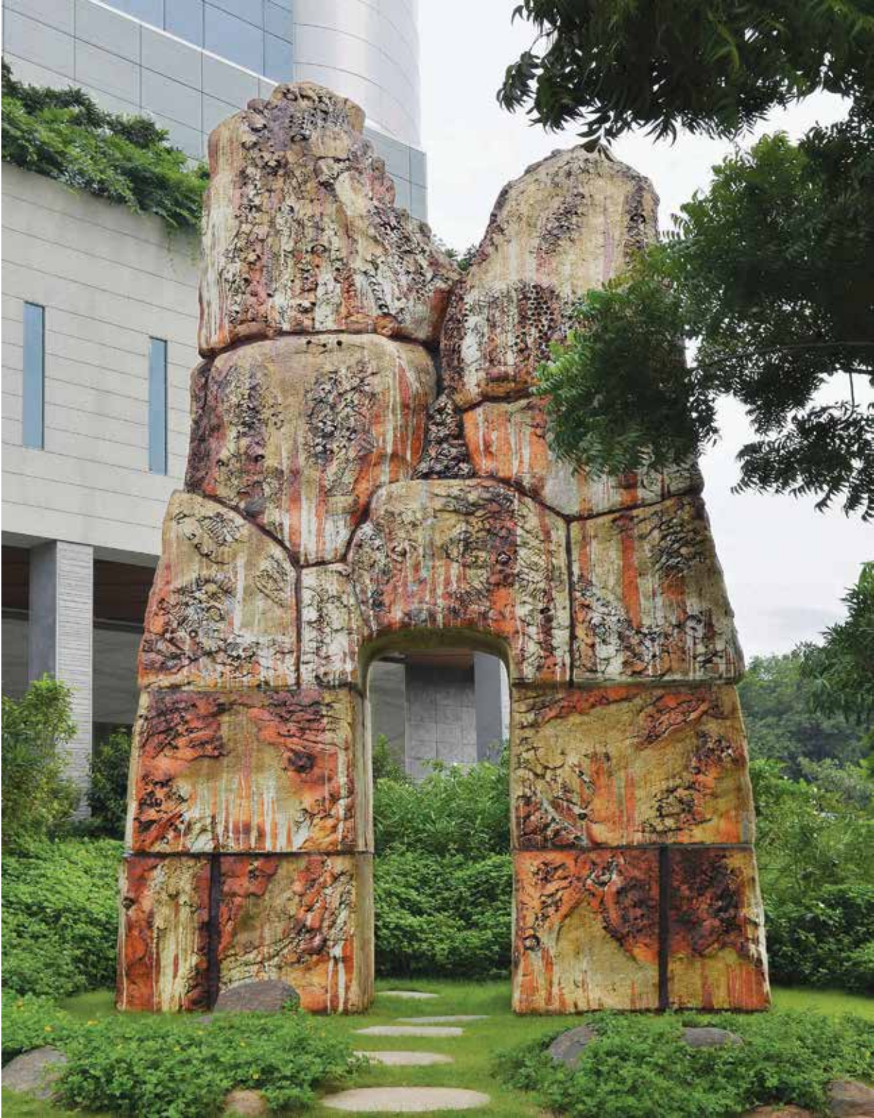
PASSAGE | INSTALLED AT THE HYATT REGENCY HOTEL, CHENNAI | 2011