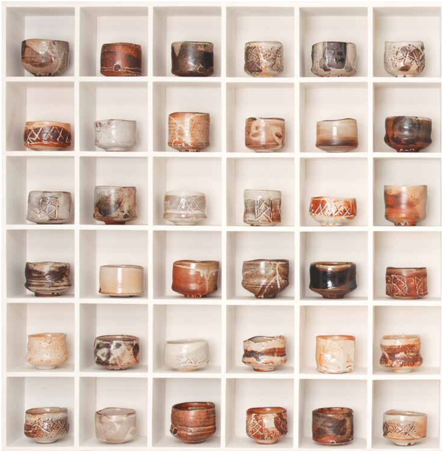
"71 RUNNING" | INSTALLATION OF 71 TEA BOWLS | 2014