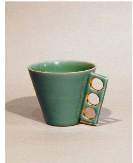
Celadon designed by Atelier Mendini, Produced by Haegang Institute of Goryeo Celadon