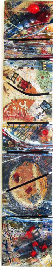
[CRUSADE SERIES: WRITER'S GRITTY CANVAS PAINTINGS, FREED FROM A PALETTE OF CLAYS, GLAZES AND CONE TEN FIRINGS]

The complex map of gritty colour and texture in the Crusade Series, its dips and deposits before our eyes, is only worth the imagination of the many parallel states in which they might exist. These canvases are the picture of possibility, rather akin to Writer's own road from architecture to ceramics.