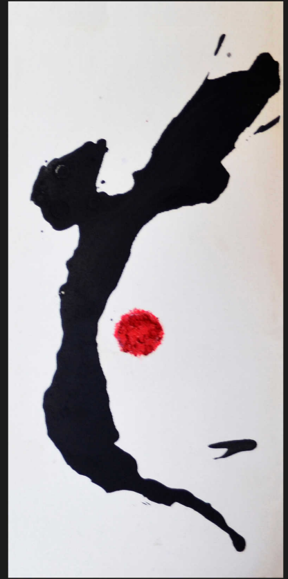
[WRITER'S SHODO SERIES THAT HE MADE SOON AFTER HIS RETURN FROM JAPAN WHERE HE TOOK CLASSES IN SHODO CALLIGRAPHY]