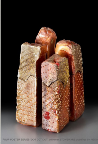
FOUR-POSTER SERIES 'DOT DOT DOT' all white STONEWARE woodfired 9th HT.