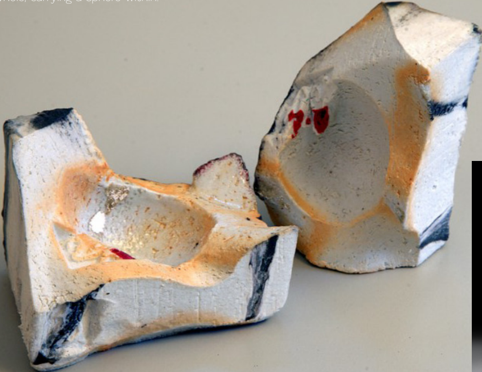
TREASURE BOX, ETC.

Among his creatures, is one that he calls 'treasure box'. He makes them everywhere. They are two halves of a whole, carrying a sphere within.