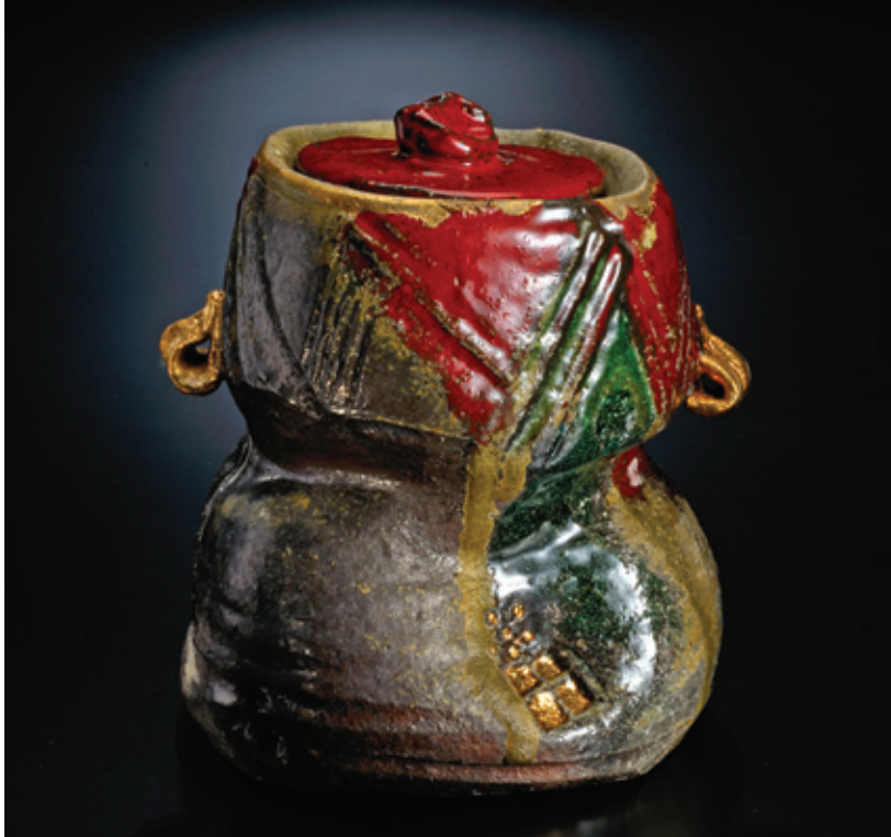
ANJIN ABE, JAPAN Color-glazed Bizen Tea Ceremony water jar. 20.5 h x 20 w. x 19 d. CM