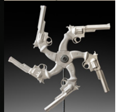
LINDA LIGHTON, USA. 44 Magnum Mandala. 68h. x 10w. x 38d. CM