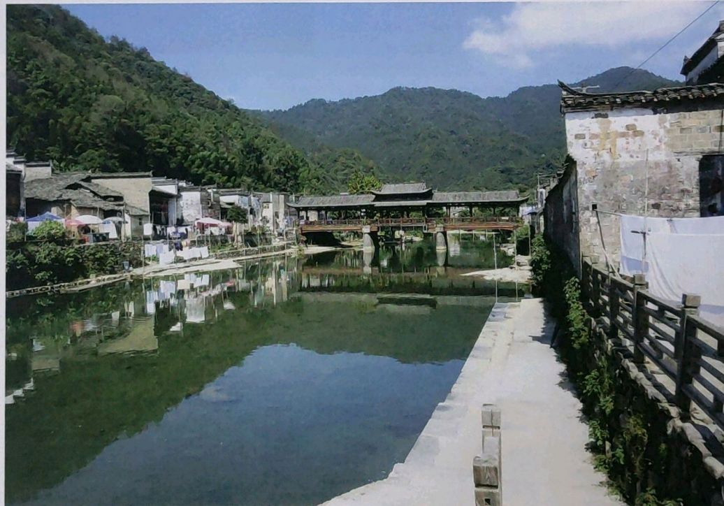
Yaoli village - the place under the Kaoling mountain