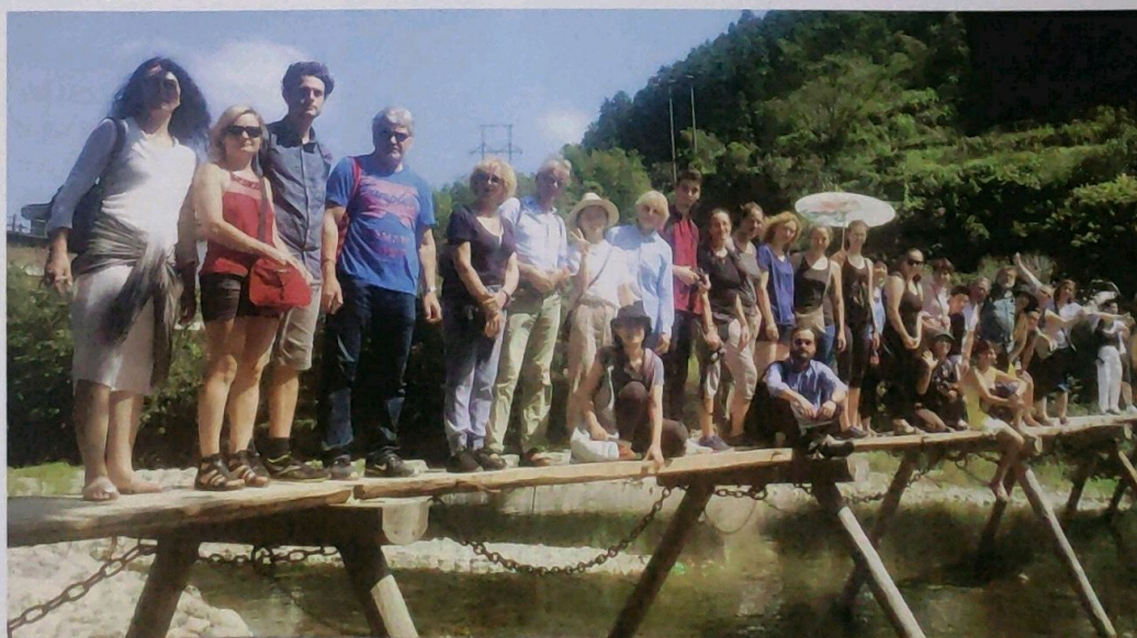
Yaoli village - participants of the festival in TaoXiChuan 2017