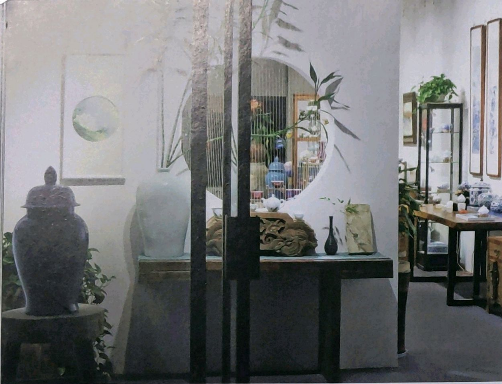
One of the 5000 ceramic galleries in Jingdezhen - inside of the TaoXiChuan area