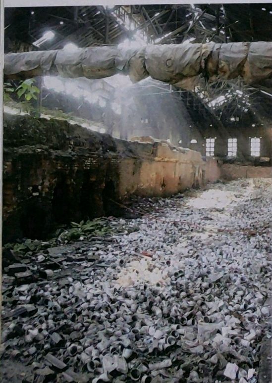
top right and below - Those pictures are showing the situation of the factory before closing and before the revitalization of the whole place

now have served as the entrance gateway to porcelain production in Jingdezhen. Among the new workshops springing up in the dynamically expanding town is Tao Xi Chuan. This ceramics centre, today famous worldwide, developed out of the former porcelain factory in which from the 1960s on top quality porcelain was manufactured on what then were revolutionary production lines. Hard, high-fired