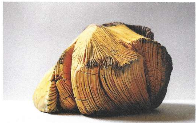
Mnemosyne Fold , 21.5x42x25cm, 10.85kg, ceramic, porcelain artika & reduction with salts, 2020

Experimenting with oxides, engobes, glazes and salts, Maiterena is fascinated by the possibility of textures, producing pieces that inscribes two temporalities, the geological and the artistic. In each work there exists the cartography of a lived moment, so that the choreography of the viewer's gaze becomes a process of looking for suggestions in folds and folds over folds. Abrupt multiplicities suggest a twisted balance of life in uncertain liquid landscapes, with overflowing possibilities.