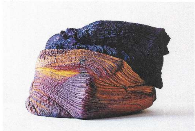
Presence of an Absence , 33x26x22cm, 13.2kg, ceramic, stoneware & reduction with salts, 2020