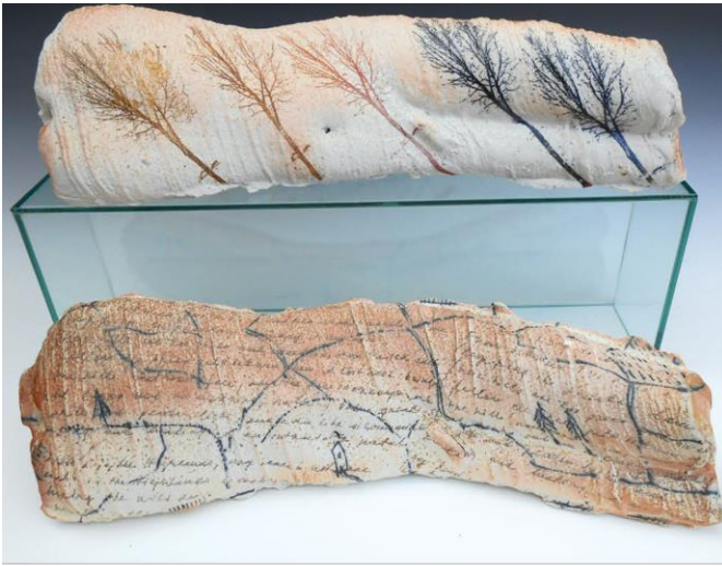
Landscape Formation 57x10x25 cm, 1350°C 2015