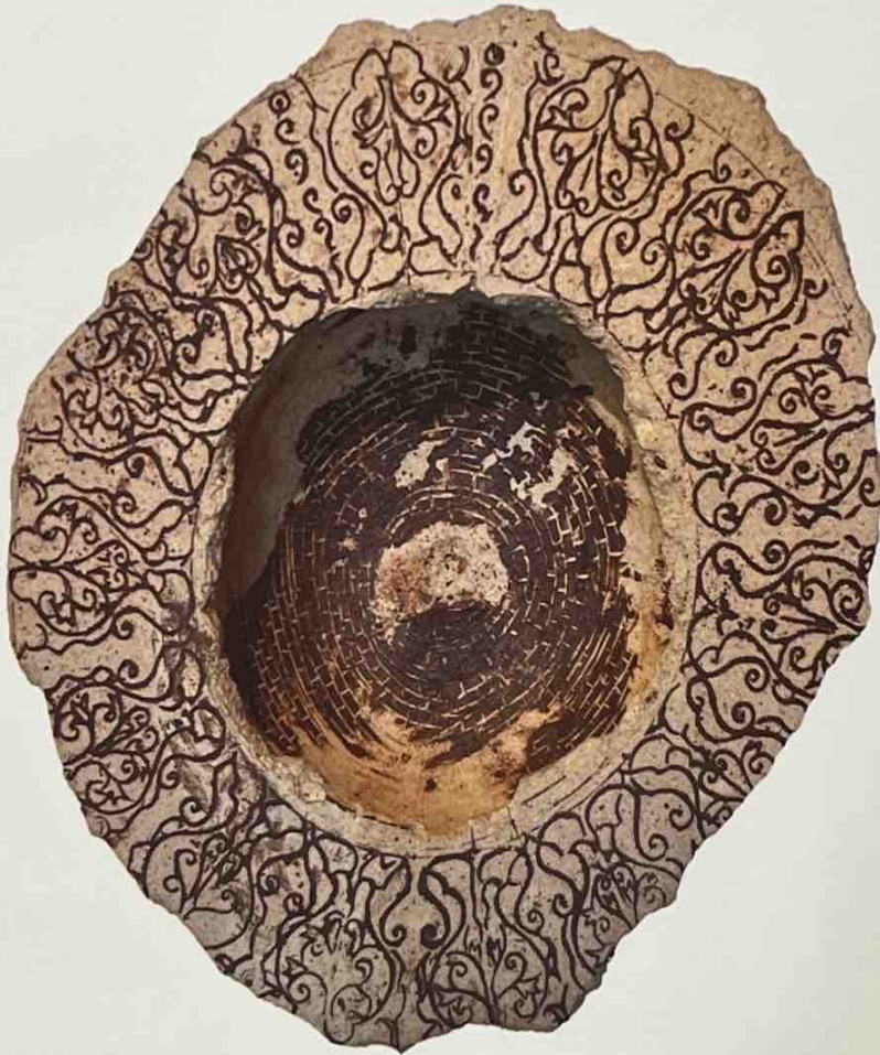
Gumbad | Stoneware | 16 x 16 x 5 Inches | 2024