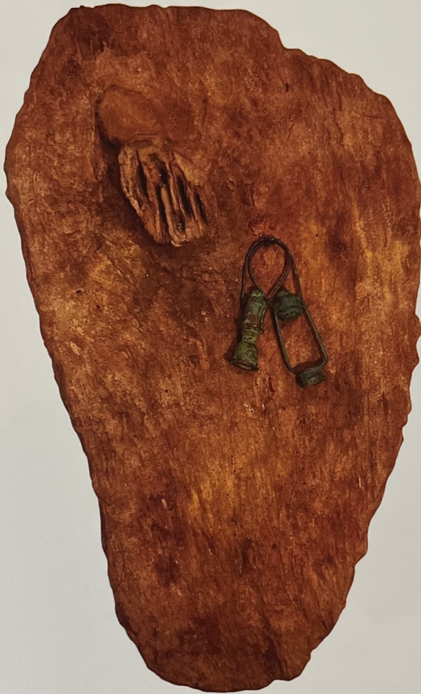
Lantern By The Window | Stoneware And Bronze | 22 x 13.5 x 2.5 Inches | 2024