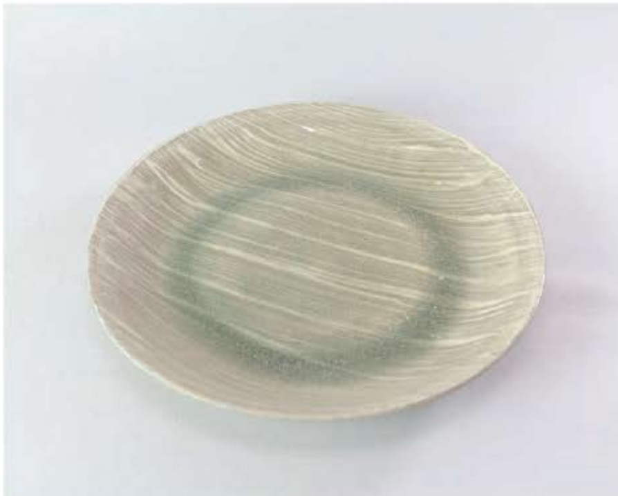
Pine Ash Glaze Brushed Slip Plate