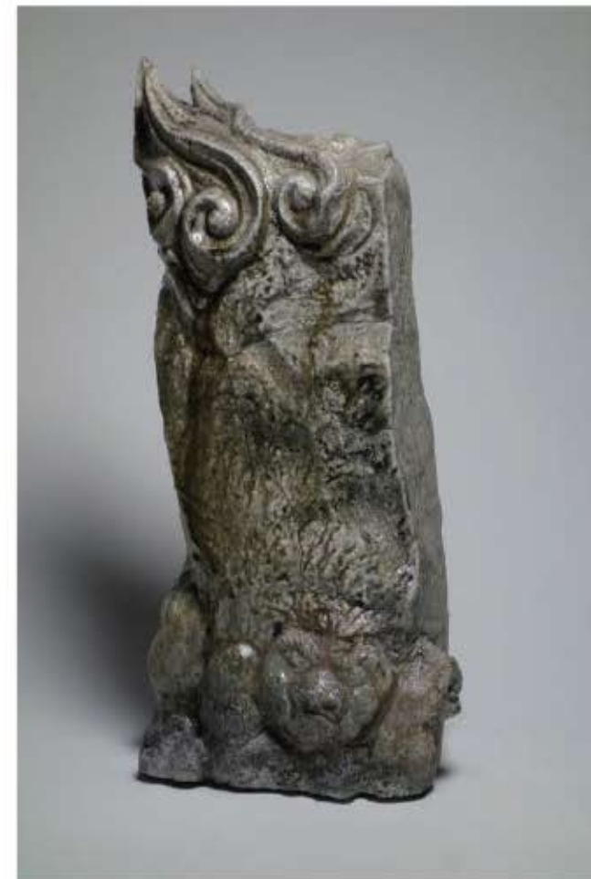
Sekienki (Stone Flame Demon) 石炎鬼 H41 × 19 × 14cm Mashiko Clay Anagama Firing 1350°C