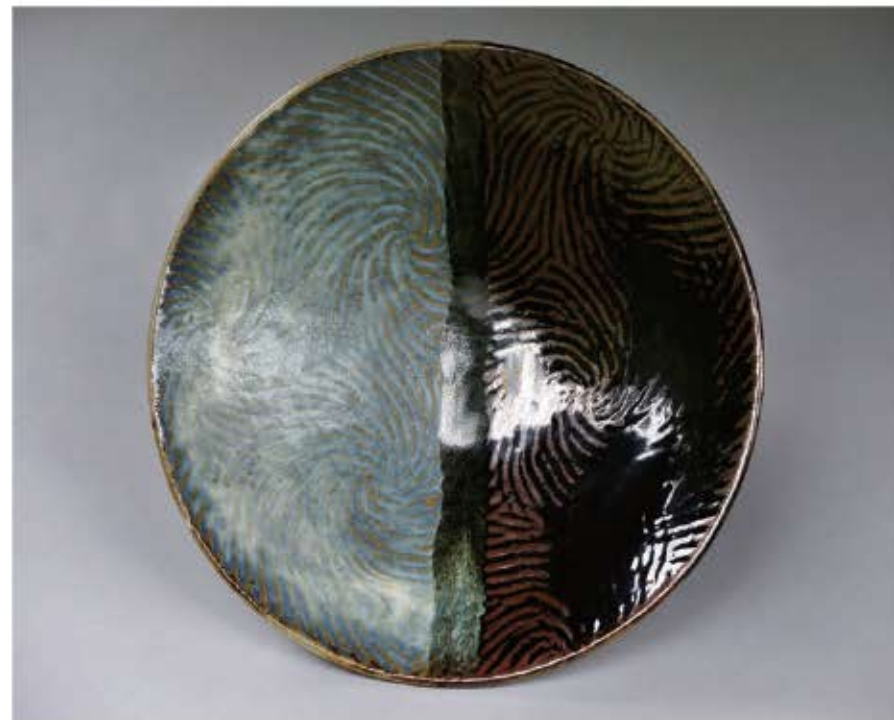
Swirl Patterned Jomon Zogan Plate 掛合粘渦縄文象嵌皿

H5 × 21 × 21cm Mashiko Clay Transparent Glaze 1270°C