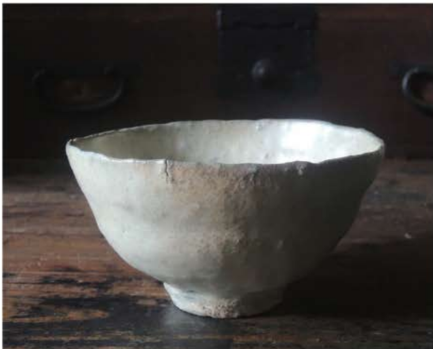
Tea Bowl 茶碗

H7.1 × 13.3cm Hand Dug Clay Wood Firing 1230°C