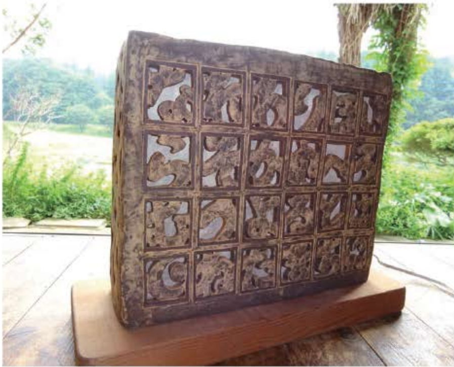
AKARI "IROHA" AKARI "いろは" H30 × 37 × 12cm Mashiko Red Clay Unglazed Carbon Firing 1280°C