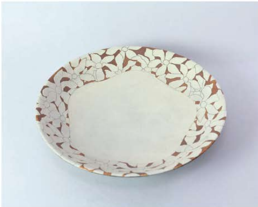
Kobushi Magnolia Motif Bowl