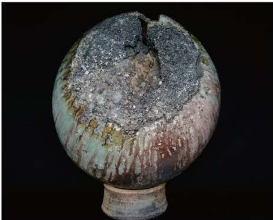
The Birth of the Universe

H48 × 40 × 30cm Shigaraki Clay 5 Day Anagrama Firing