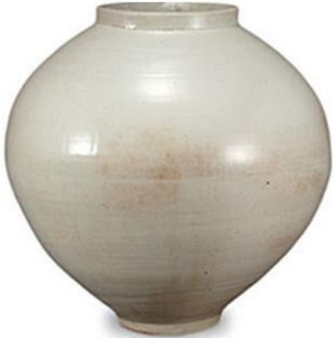
18th-century white porcelain moon jar