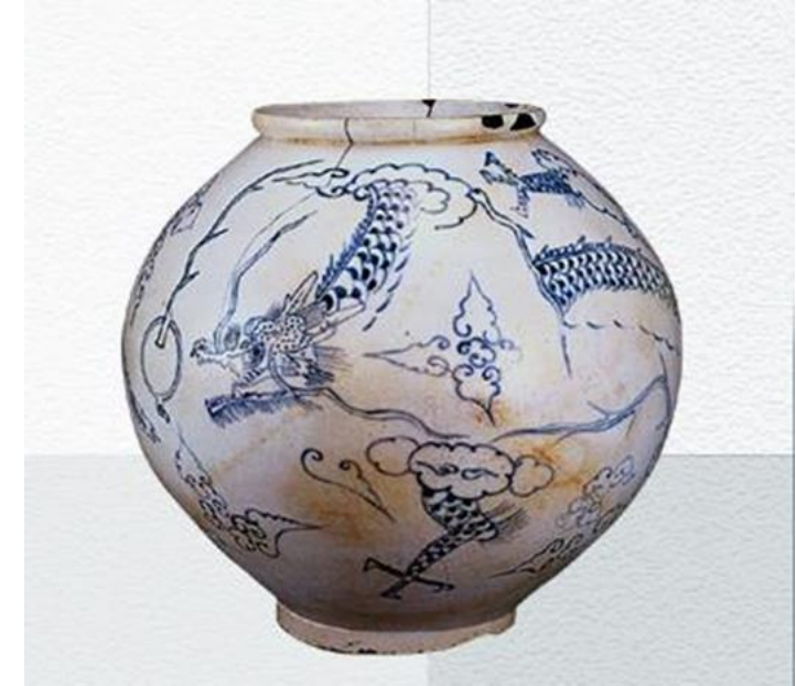
18th-century Cheonghwa White Porcelain Iron-decorated Cloud and Dragon pattern Bottle/ Private collector