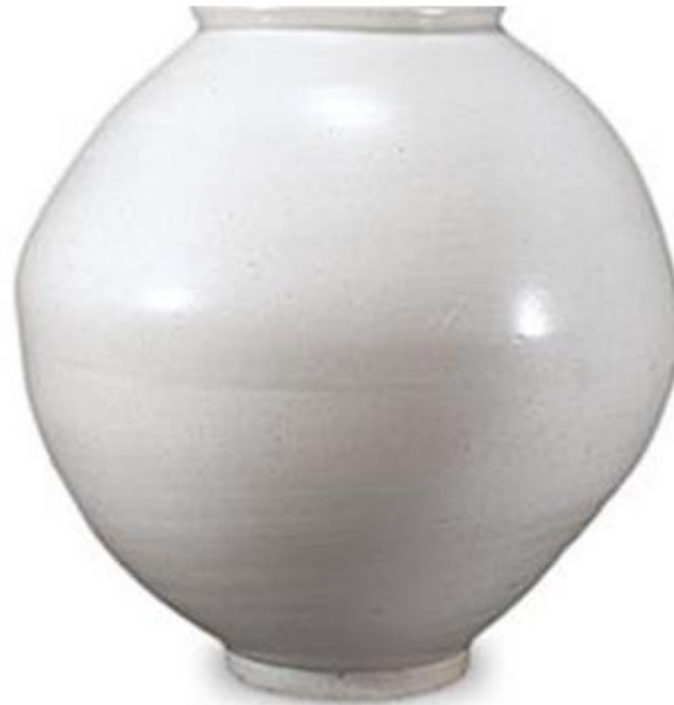
National Treasure No. 310: 17th-18th century White Porcelain Moon Jar / National Palace Museum of Korea

The moon jar, a round jar produced in a white porcelain kiln for royal use, is known as "pure white porcelain."