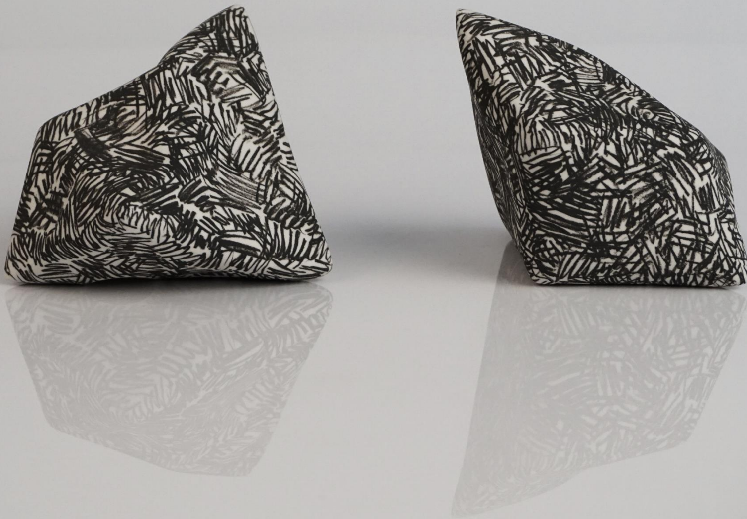
14 x 35 x 12cm, porcelain, pigment, t 1320 C