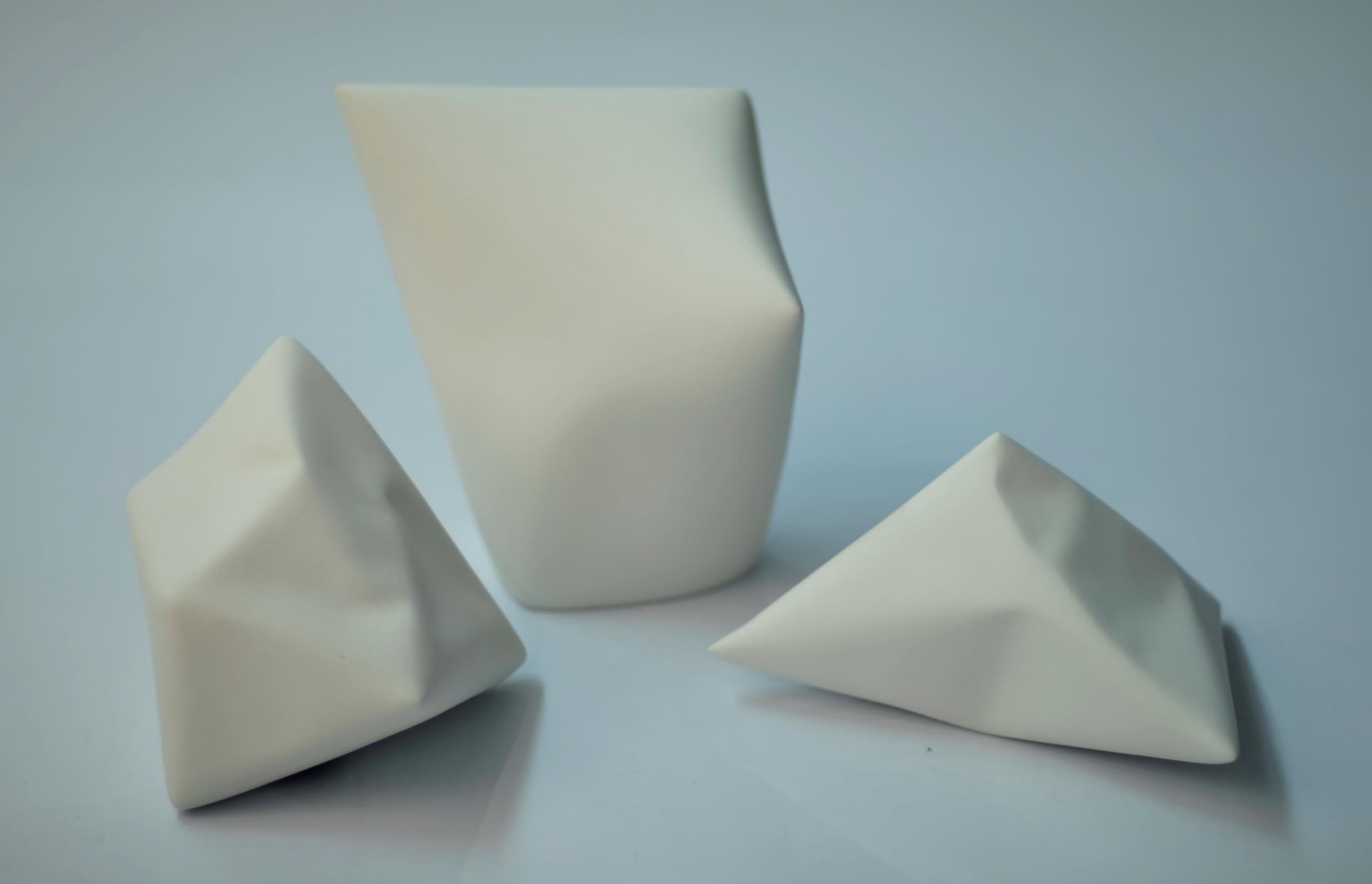
22 x 38 x 25 cm, porcelain, transparent glaze, pigment, t 1320 C