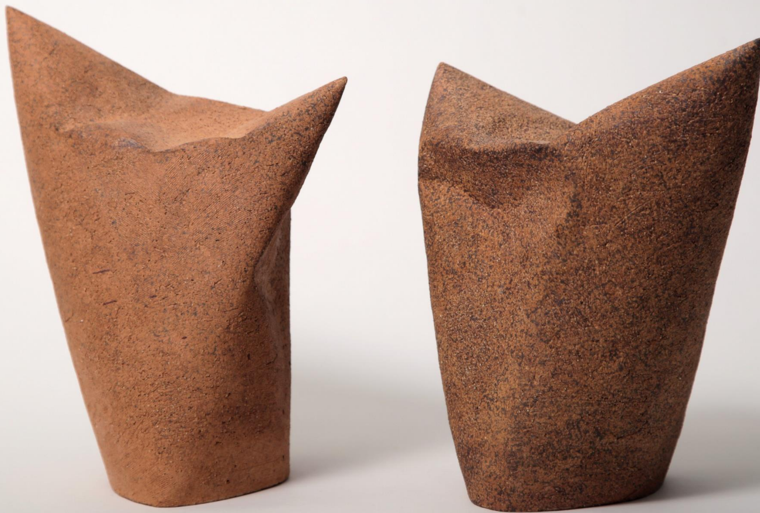
31 x 54 x 35 cm, chamotte, reducing firing, t 1250 C