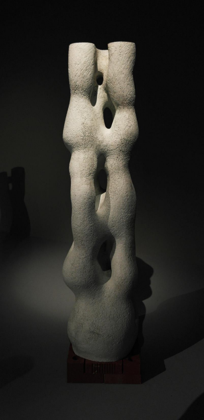
156 x 53 x 51cm, chamotte, reducing firing, t 1250 C