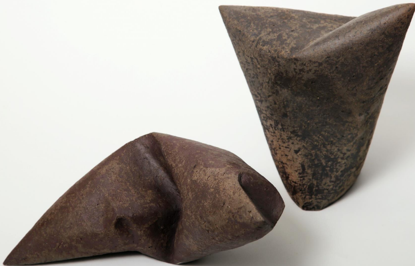
29 x 49 x 27 cm, chamotte, reducing firing, t 1250 C