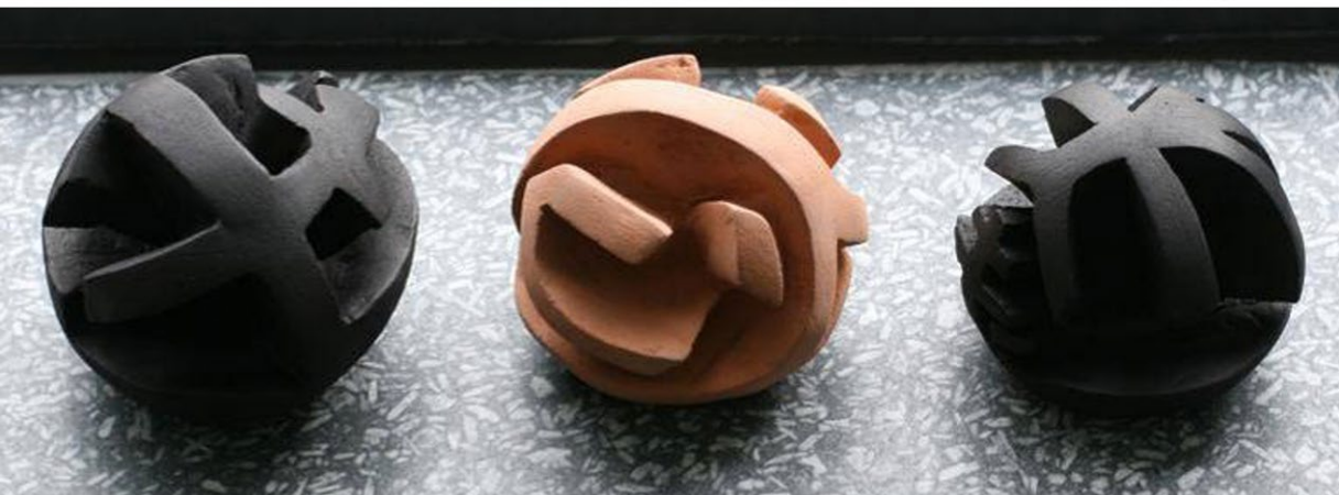
Water, wood, metal, fire and earth; The five elements of Chinese philosophy