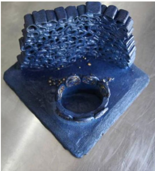
A wall and a well