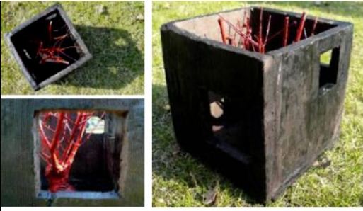
“困” hem in