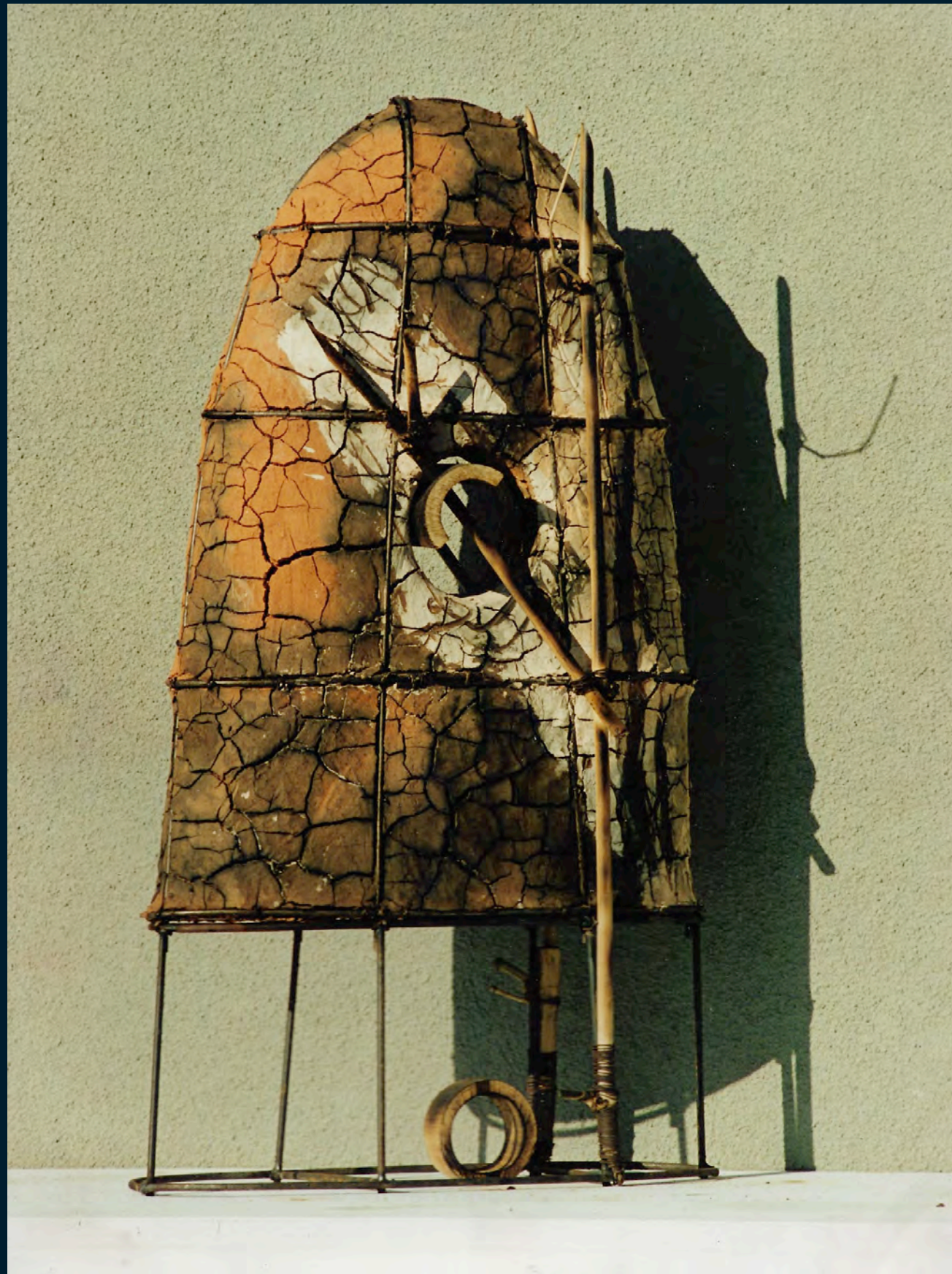
Javanese Spirit II - terra-cotta, bamboo, steel - (year and dimension still unknown)