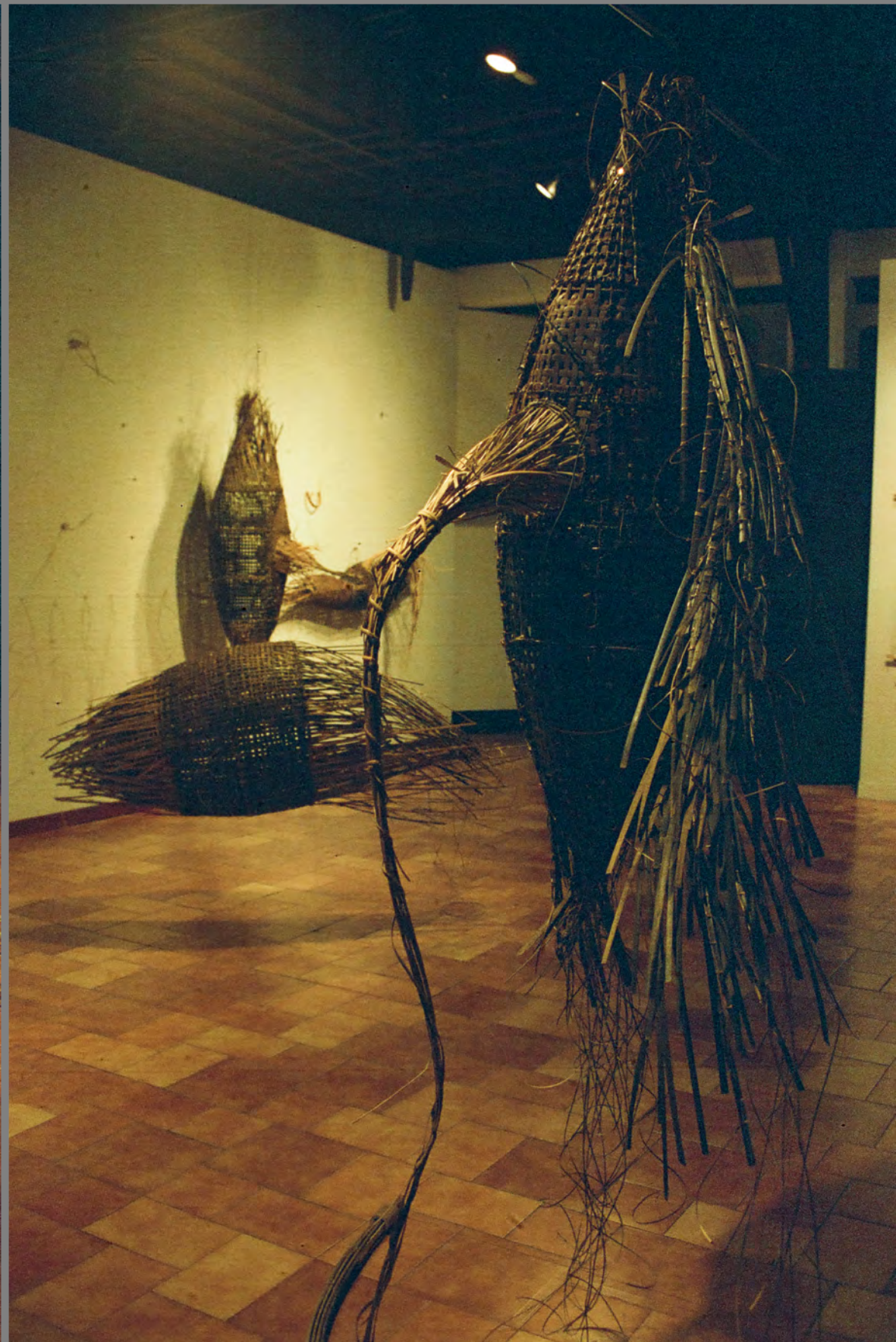
Views of Riyanto's installation as part of an exhibition titled "Ning", Jakarta 2004