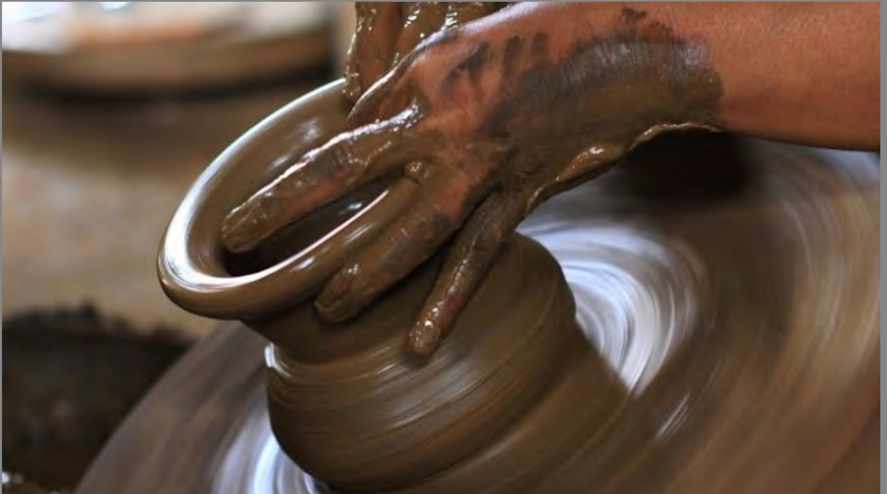
Side-wheel throwing pottery technique in Bayat, Klaten, Central Java