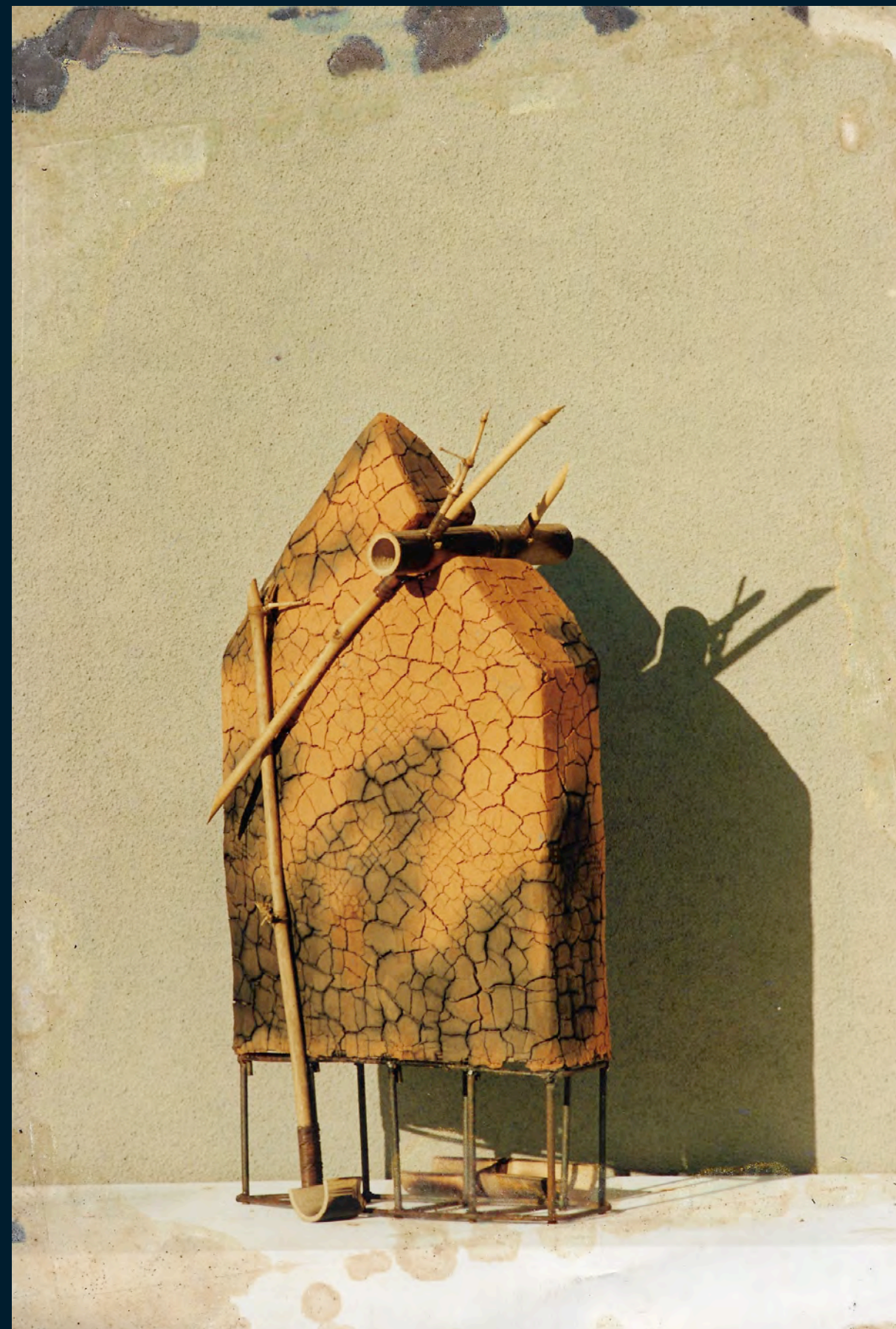
One of Riyanto's terra-cotta works (title, year and dimension unknown)