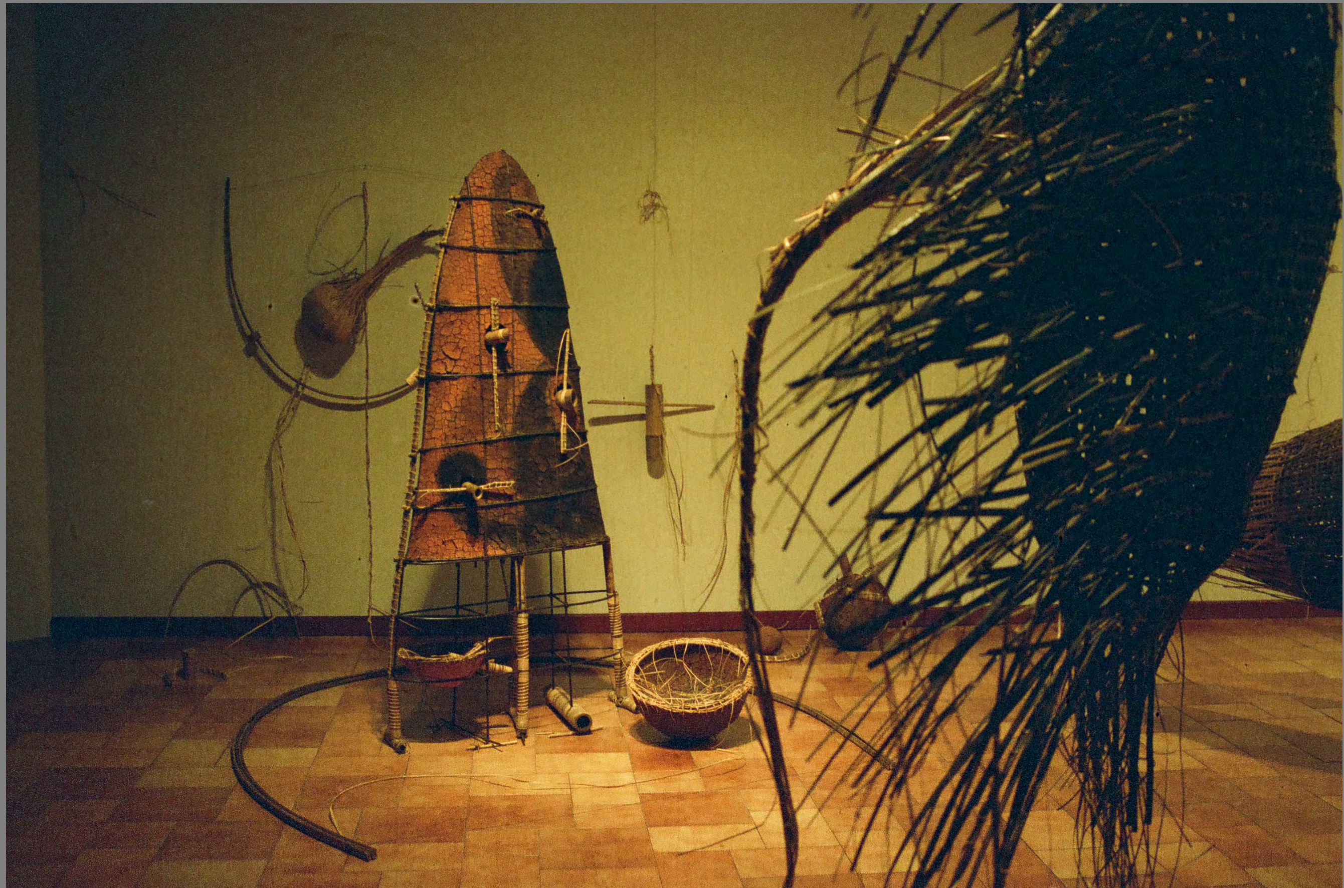
A view of Riyanto's installation as part of an exhibition titled "Ning", Jakarta 2004