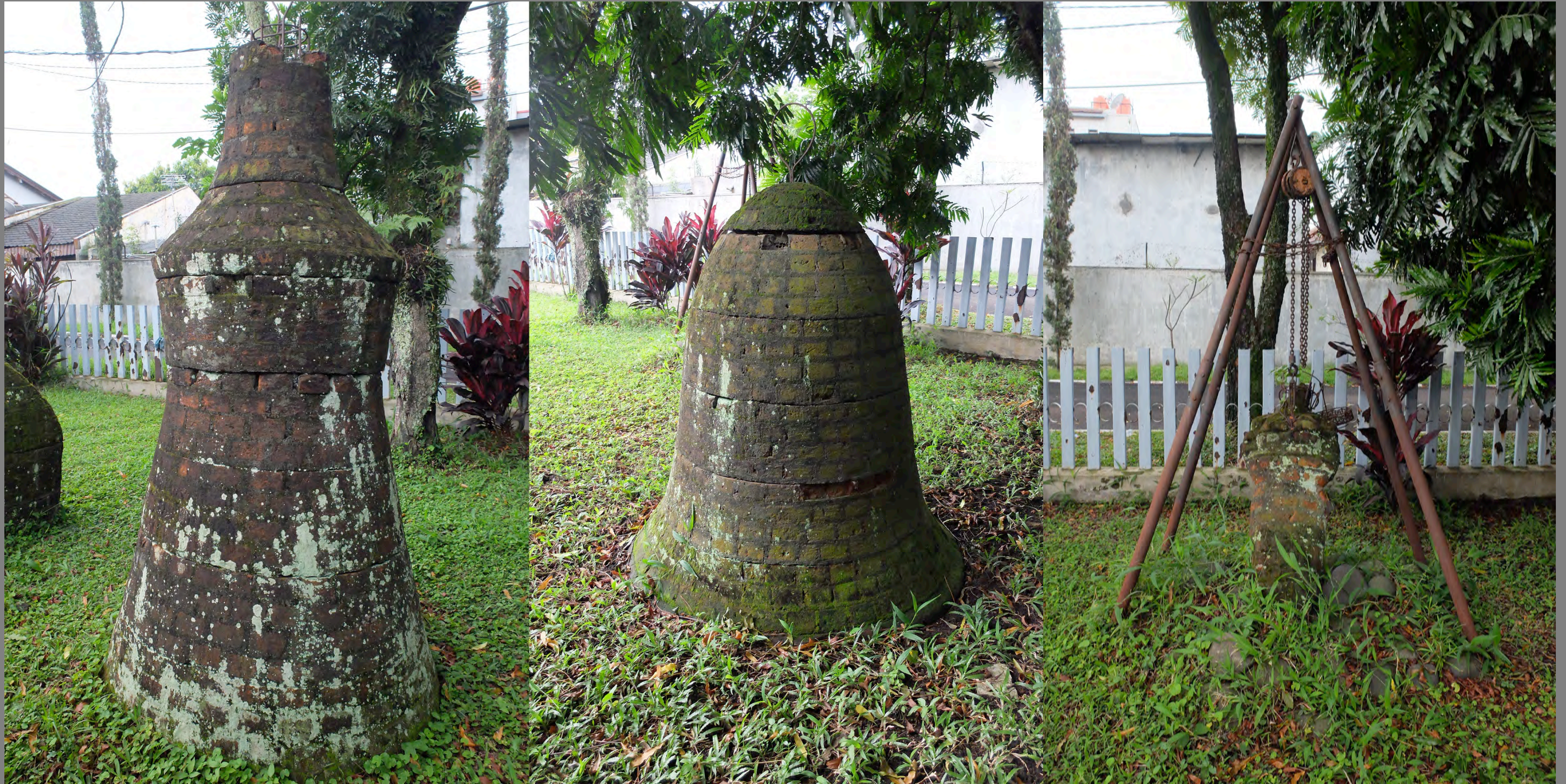
The present condition of some of the sculptures from “Ning” installation. There are six sculptures, all of the structures are still intact but the surface are not in a good condition and some of the detail parts are missing.