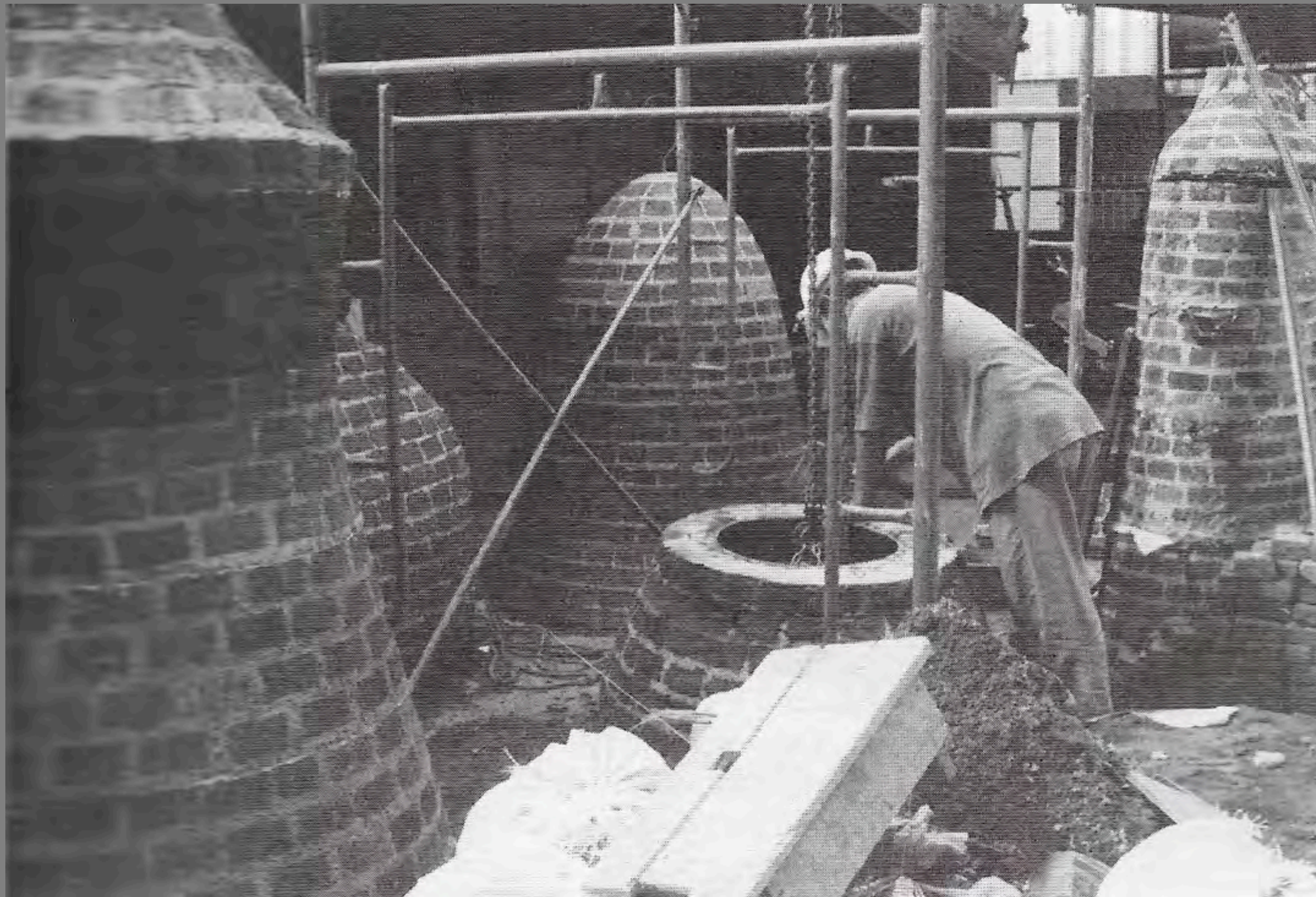
One of Hendrawan Riyanto's assistant preparing some of the sculptures for "Ning" solo exhibition, Bandung, 2002.

[ Image scanned copy from exhibition catalog, personal documentation ]