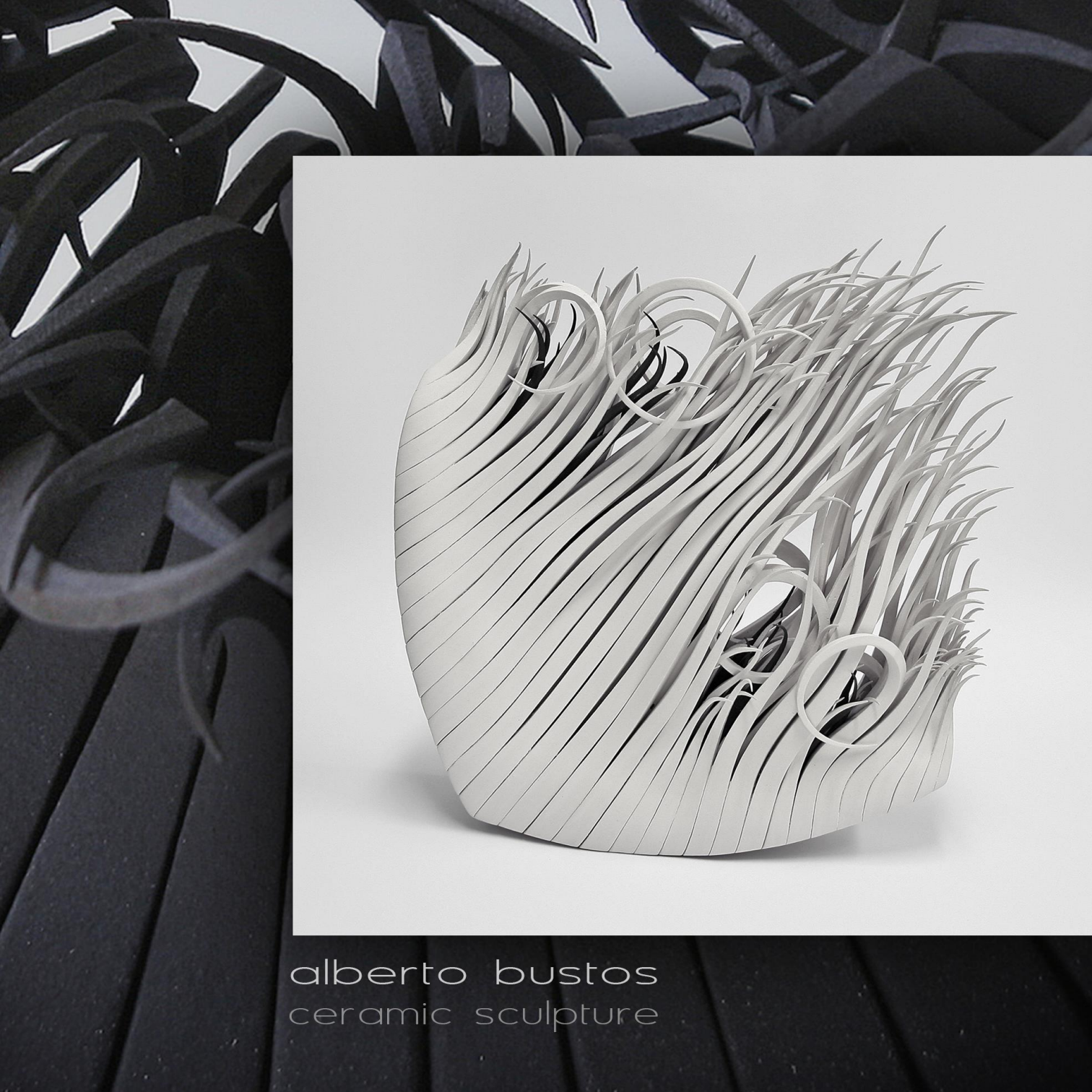
alberto bustos ceramic sculpture