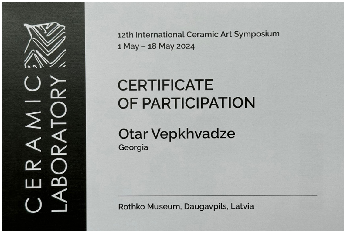
2024 - 12-th International Ceramic Art Symposium CERAMIC LABORATORY Latvian Centre of Contemporary Ceramics in cooperation with Rothko Museum, Daugavpils, Latvia