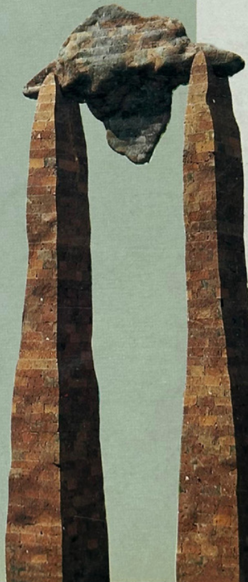
1987 - 45th International Art Ceramics Competition, Faenza, Italy