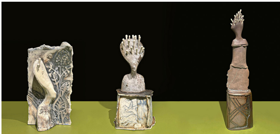
2024 - 12-th International Ceramic Art Symposium CERAMIC LABORATORY exhibition, Rothko Museum,