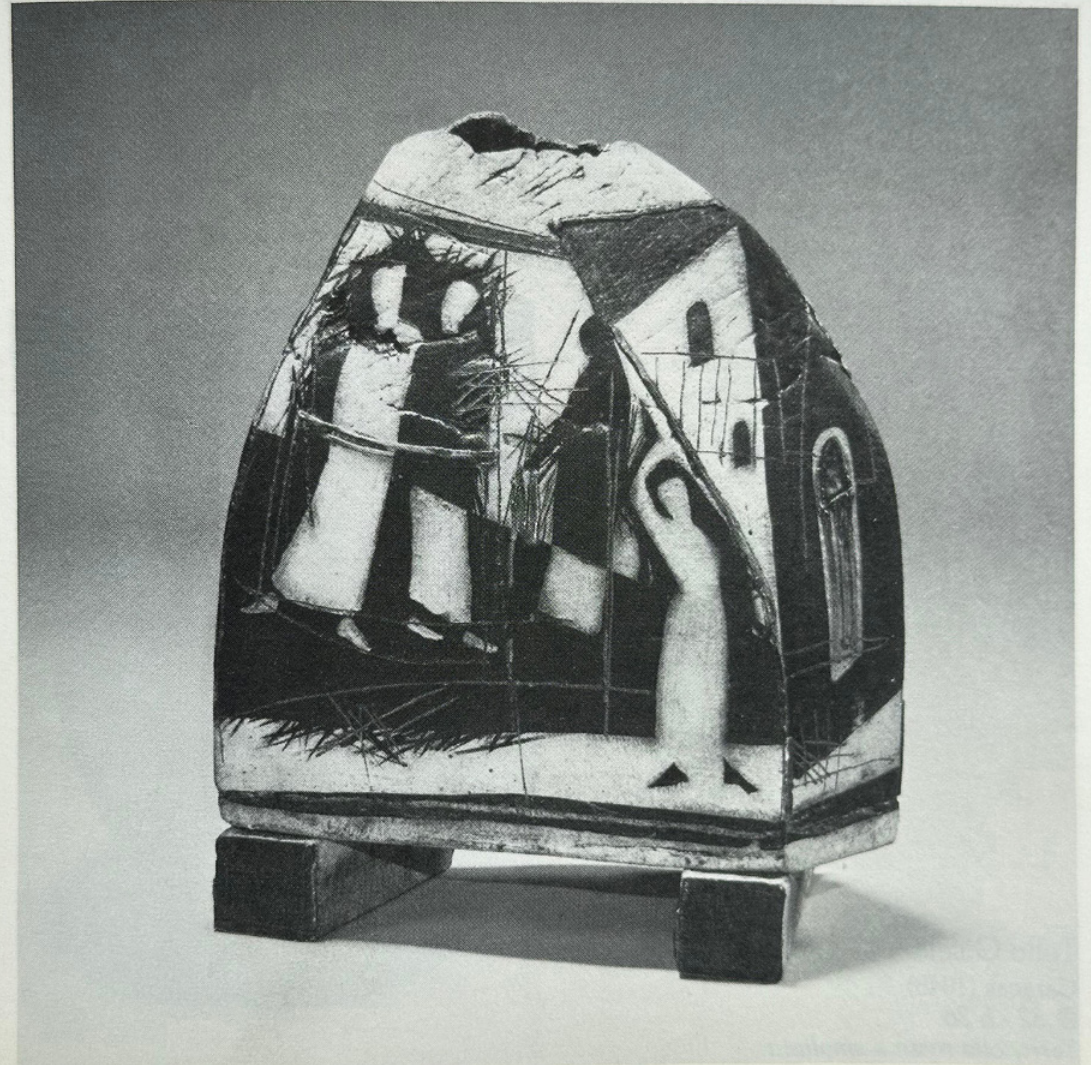
Silhouette / 1987 / 44x41x25cm / handbuilt chamotte, engobe, glaze, pigments, oxides, reducing fire