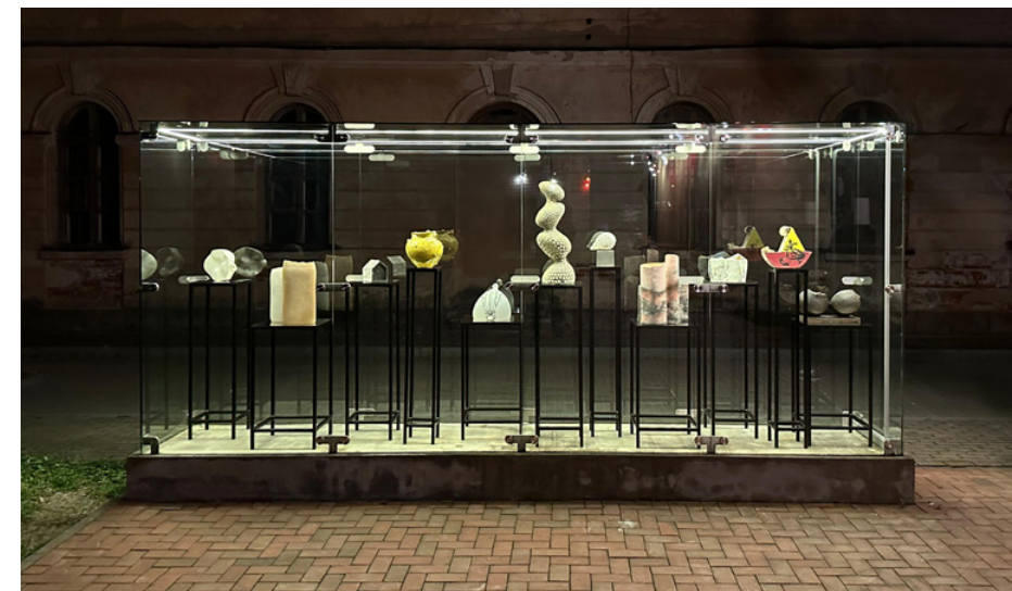
2024 - CERAMIC LABORATORY XII - the symposium's inaugural exhibition, 4 METRI gallery, Latvian Centre of Contemporary Ceramics, Daugavpils, Latvia