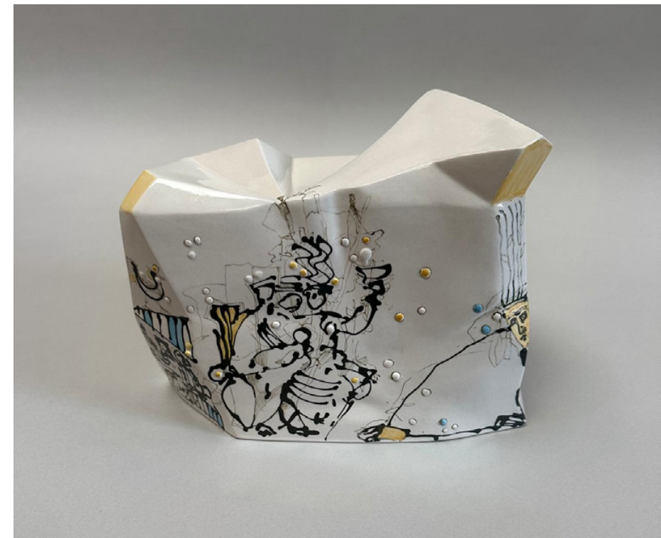
The theater / 2024 / 24x30x20cm / casting porcelain, underglaze colors