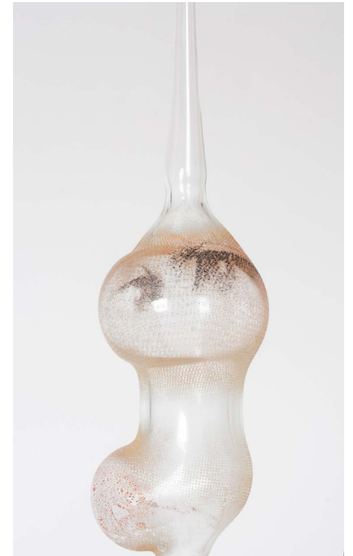
Body poetry, 2025 Screen-printed decals on porcelain and blown glass Left: 36 x 6.3 x 4.5 cm; Right: 34.8 x 6.3 x 4.5 cm