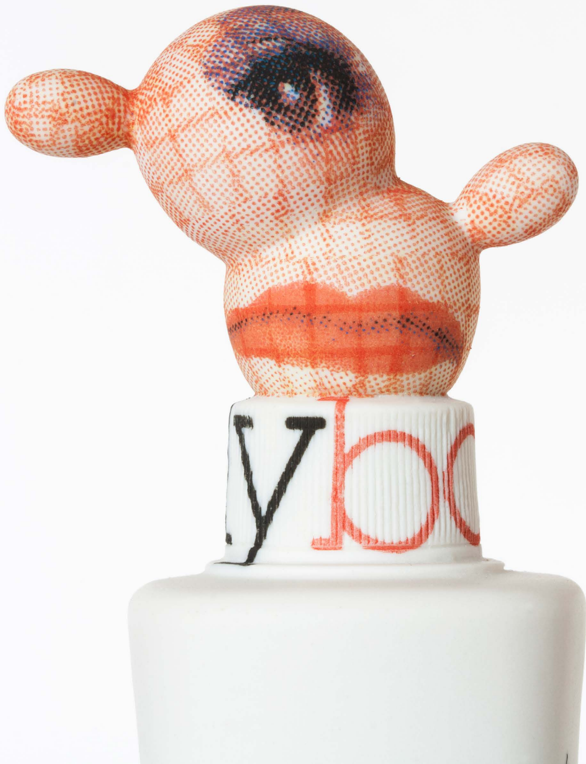
BODY POETRY MARIYA ALIPIEVA