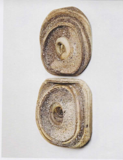
Two, wheelthrown sculpted pieces, stoneware. Mural installation, 19 x 40 cm