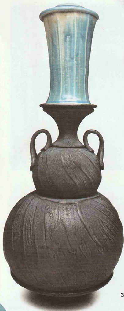
1, 2 Naomi Clement's nested bowls (alternate views), to 12 in. (30 cm) in diameter, handbuilt stoneware, underglaze decoration, 2019. 3 Antonio Martinez' Vase #1, 22 in. (56 cm) in height, wheel-thrown stoneware, fired to cone 10 in reduction, 2020. 4 Jill Birschbach's Pink Cross , 23 in. (58 cm) in height, buff stoneware, slip, glaze, fired to cone 6 in oxidation, 2020.