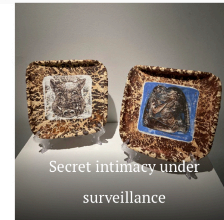
Secret intimacy under surveillance