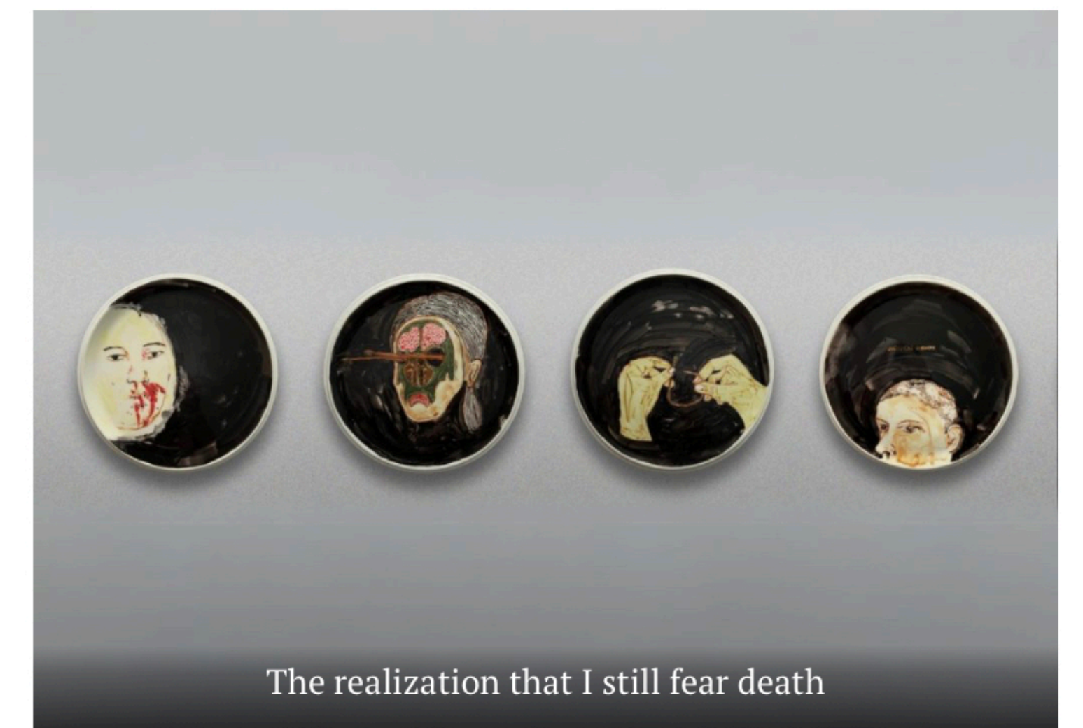
The realization that I still fear death