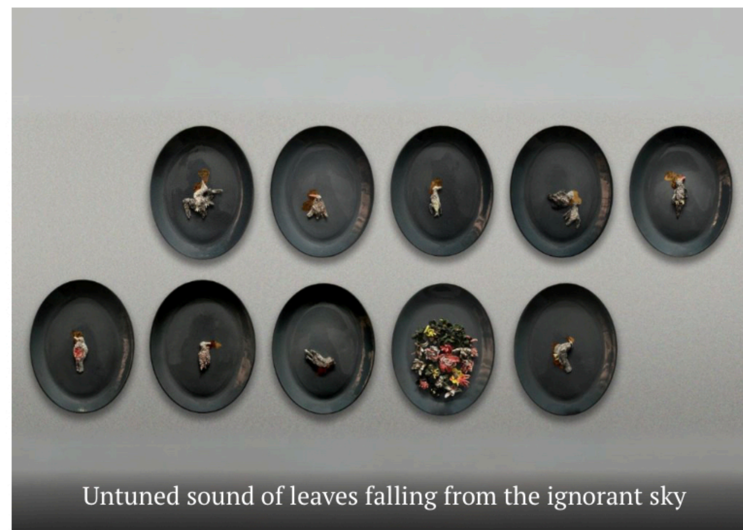
Untuned sound of leaves falling from the ignorant sky