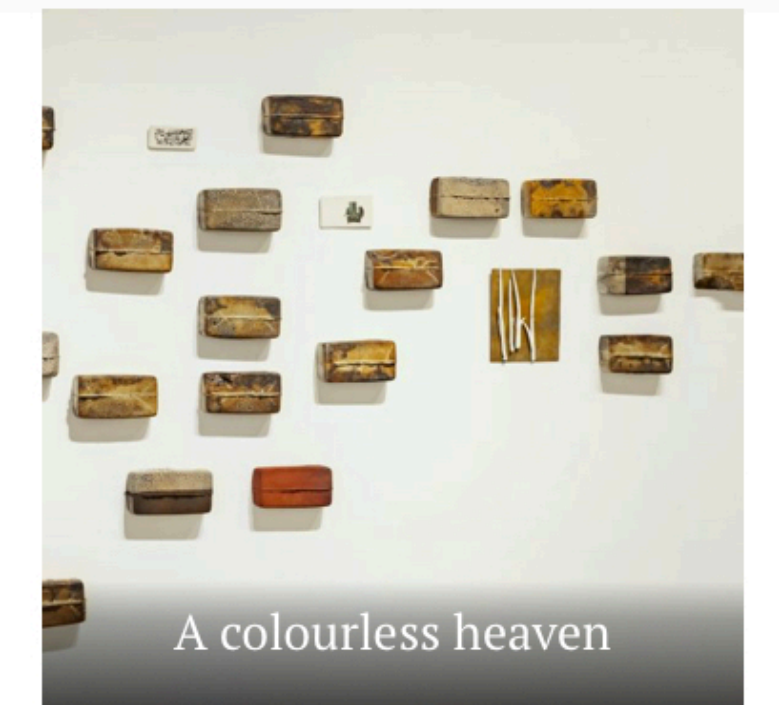
A colourless heaven