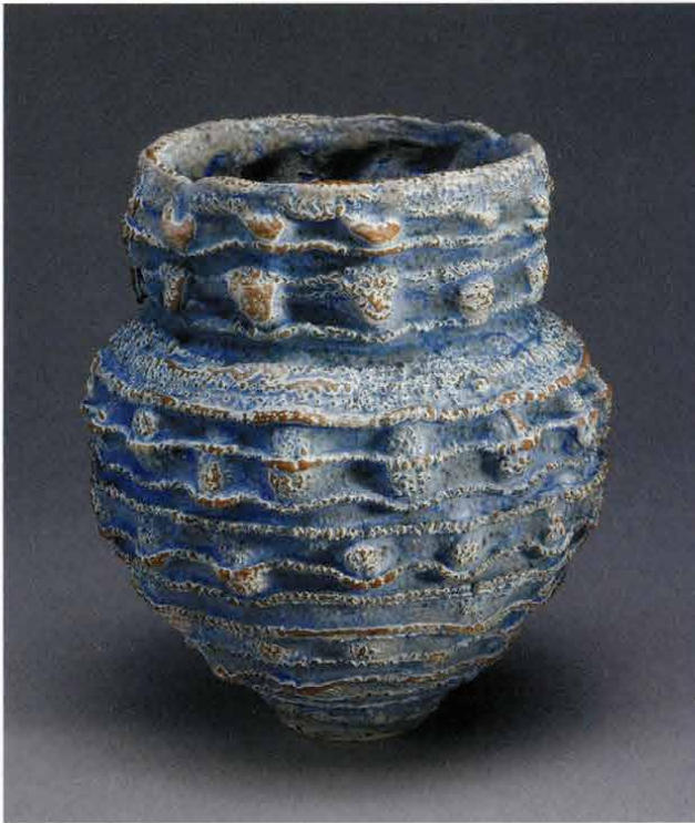
'Untitled', 2007, mid-fired, wheel-thrown, dry glazes, ht 19 cm