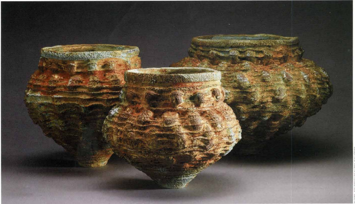
'Untitled', 2007, mid-fired ceramic forms, wheel-thrown and manipulated, dry glaze, three firings, tallest 27 cm