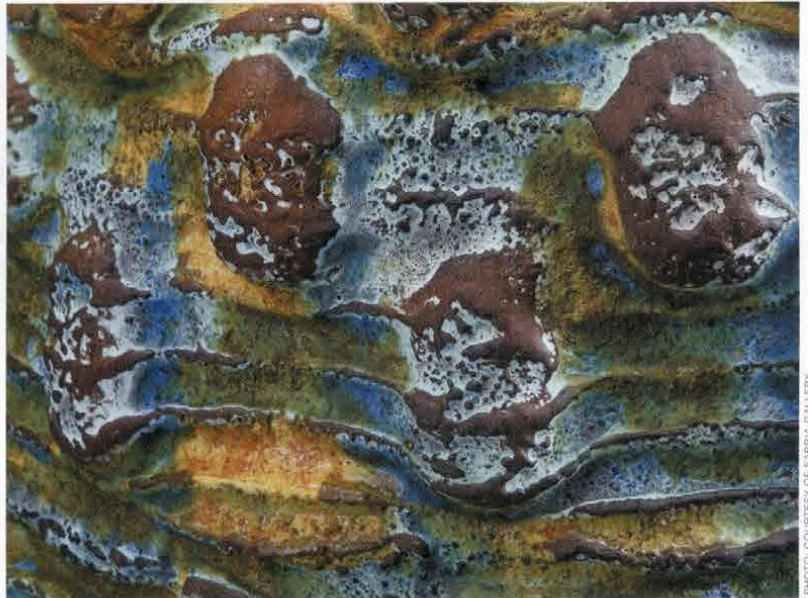
Detail of manipulated dry glaze surfaces, mid-fired, three firings