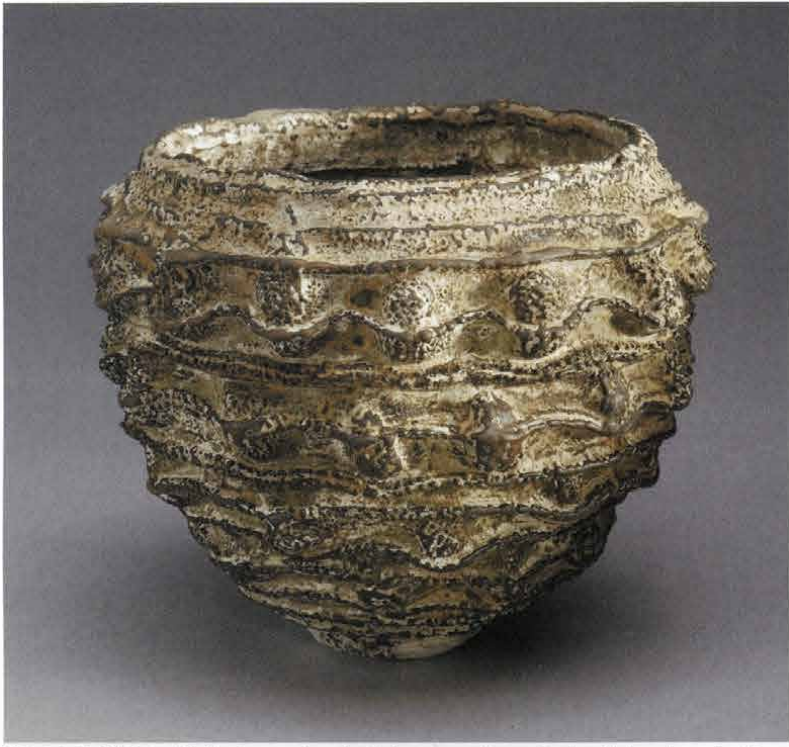
'Untitled', 2007, mid-fired ceramic, wheel-thrown and manipulated, dry glaze, ht 15 cm