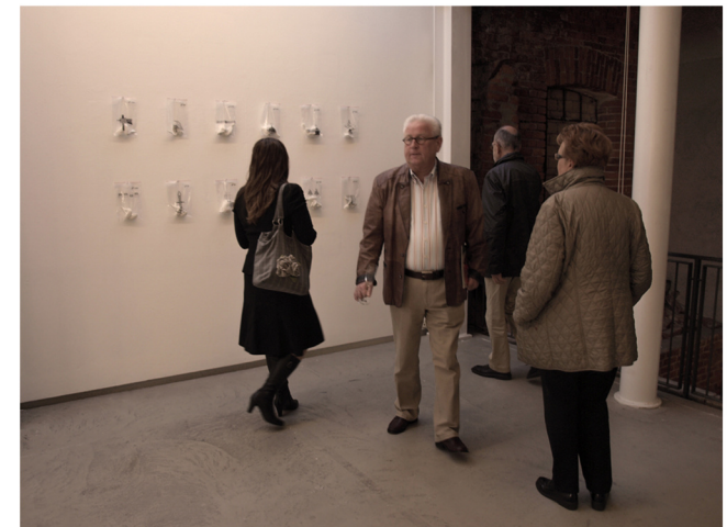
2010 - Latvian Contemporary Art exhibition A SMILING LADY ON THE TIGER, Stadtliche Gallerie Bremen Germany