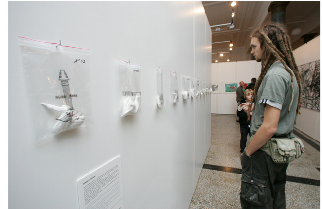
2009 - Contemporary graphic art exhibition METABOLISM Latvian National Art museum, Riga, Latvia