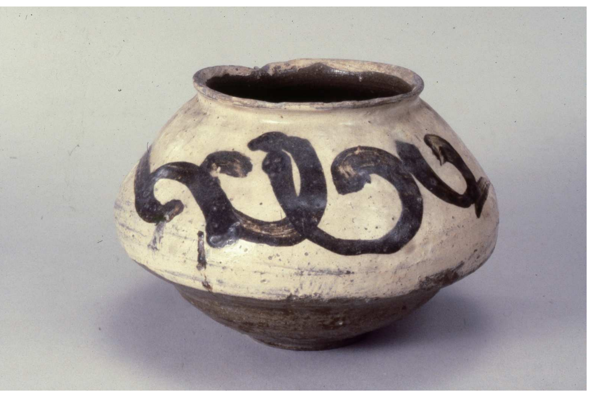
Photo 4. Buncheong Jar with Scroll Design in Underglaze Iron Ewha Womans University Museum