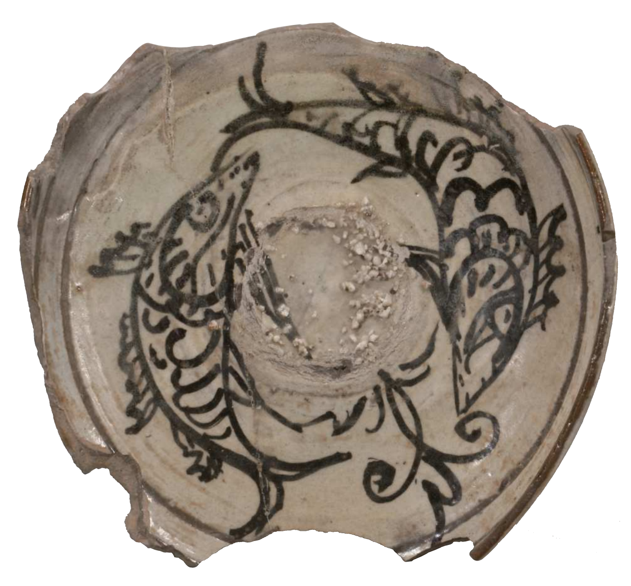
Photo 12. Buncheong Dish with Fish Design in Underglaze Iron Shard The National Museum of Korea