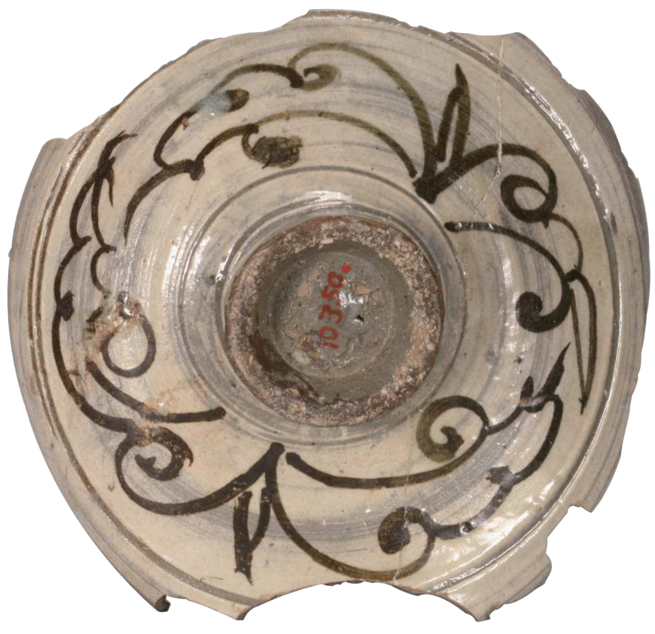
Photo 7. Buncheong Dish with Fish Design in Underglaze Iron Shard (Bottom) The National Museum of Korea