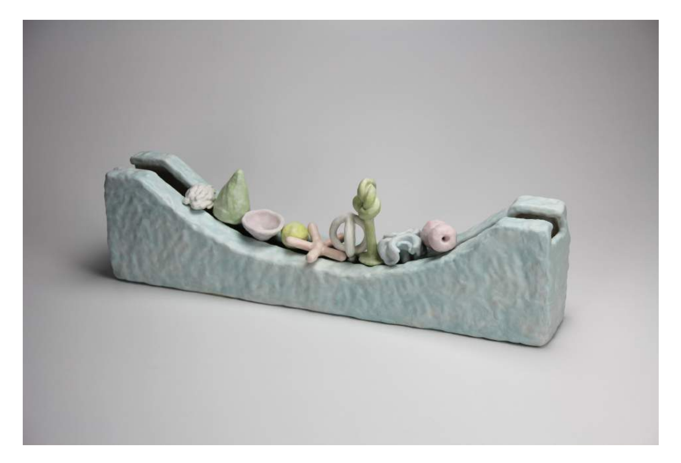
Mix and Match I, 2016 Handbuilt stoneware, coloured porcelain slip 60 \times 9 \times 15 cm

This practice-led research explores my changing relationship with process in developing contemporary ceramic artwork, where the development of artwork begins with process as a means of driving a fixed outcome, to becoming an outcome itself. The project is developed from studio practice which investigates various making methodologies, such as using plaster moulds, hand-building, repetition in making, playing, and engaging with the viewer. My research argues that by focusing on an open-ended process-driven methodology in creating artwork, the experimental process can provide a broader platform for unexpected possibilities to emerge and mature. The research outcome has resulted in handbuilding three groups of artwork, each of which invite the viewer to engage and interact.