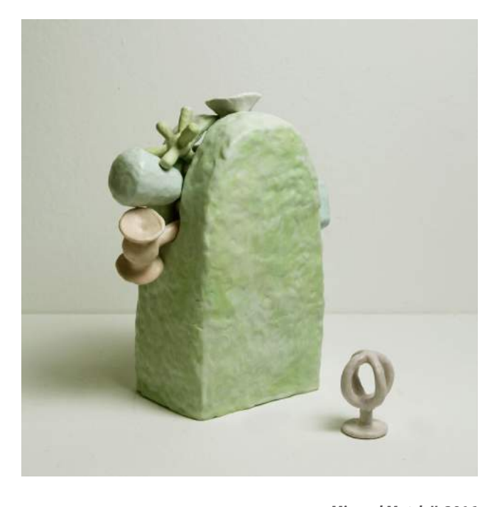
Mix and Match II, 2016 Handbuilt stoneware, coloured porcelain slip 14.5\times10\times18~\text{cm}