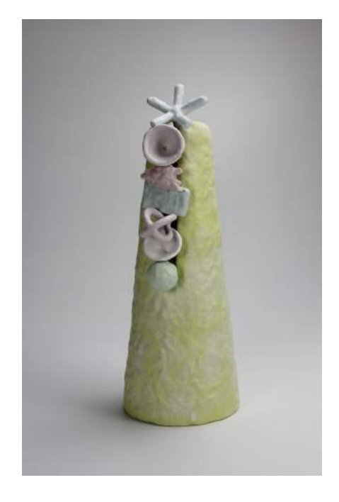
Mix and Match Playground II (above), 2016 Handbuilt stoneware, coloured porcelain slip 16 \times 16 \times 42 cm

Mix and Match Playground III (right), 2016 Handbuilt stoneware, coloured porcelain slip 27 \times 22 \times 20.5 cm