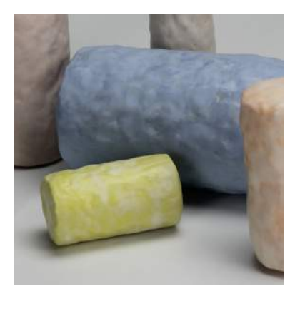
Play Block Series, 2014 Handbuilt stoneware, coloured porcelain slip Dimensions variable, max. 15 \times 25 \times 8 cm