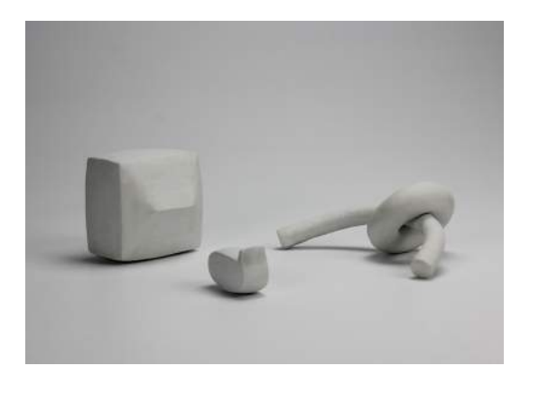
Object Series, 2016 Handbuilt stoneware, coloured slip Dimensions variable, max. 9.5 \times 9.5 \times 7.5 cm