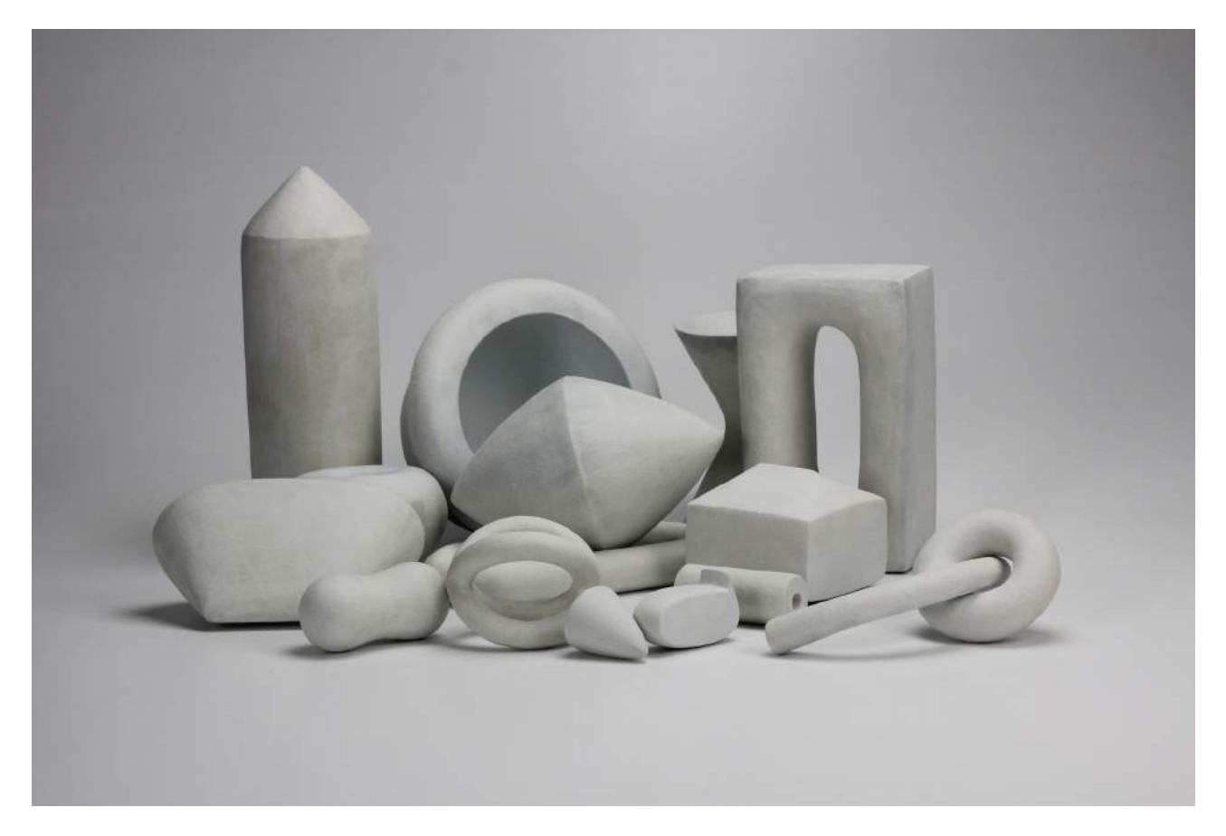
Object Series, 2016 Handbuilt stoneware, coloured slip Dimensions variable, max. 9 \times 9 \times 27 cm