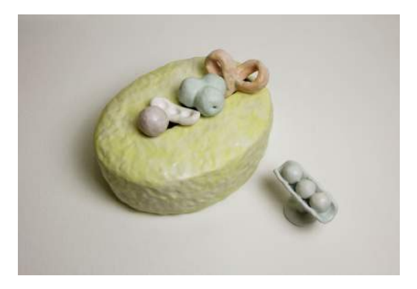
Mix and Match III, 2016 Handbuilt stoneware, coloured porcelain slip 28 \times 21 \times 10 cm