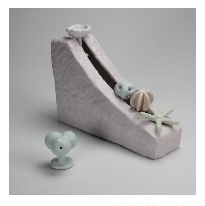
Mix and Match Playground IV, 2016 Handbuilt stoneware, coloured porcelain slip 34 \times 9 \times 26 cm