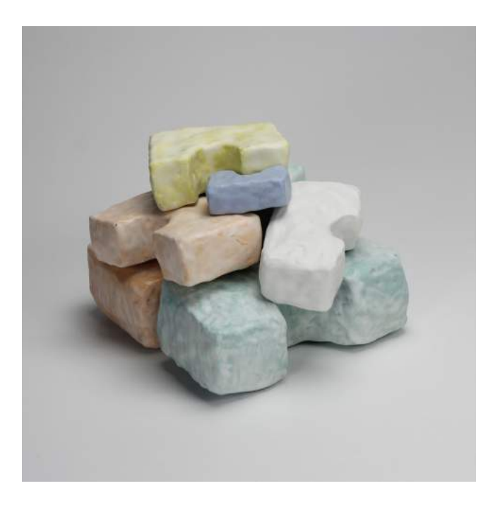
Play Block Series, 2014 Handbuilt stoneware, coloured porcelain slip Dimensions variable, max. 15 × 25 × 8 cm