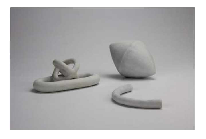
Object Series (above), 2016 Handbuilt stoneware, coloured slip Dimensions variable, max. 13.5 \times 13.5 \times 19 cm