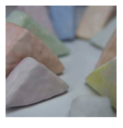
Play Block Series, 2014 Handbuilt stoneware, coloured porcelain slip Dimensions variable, max. 15 \times 25 \times 8 cm