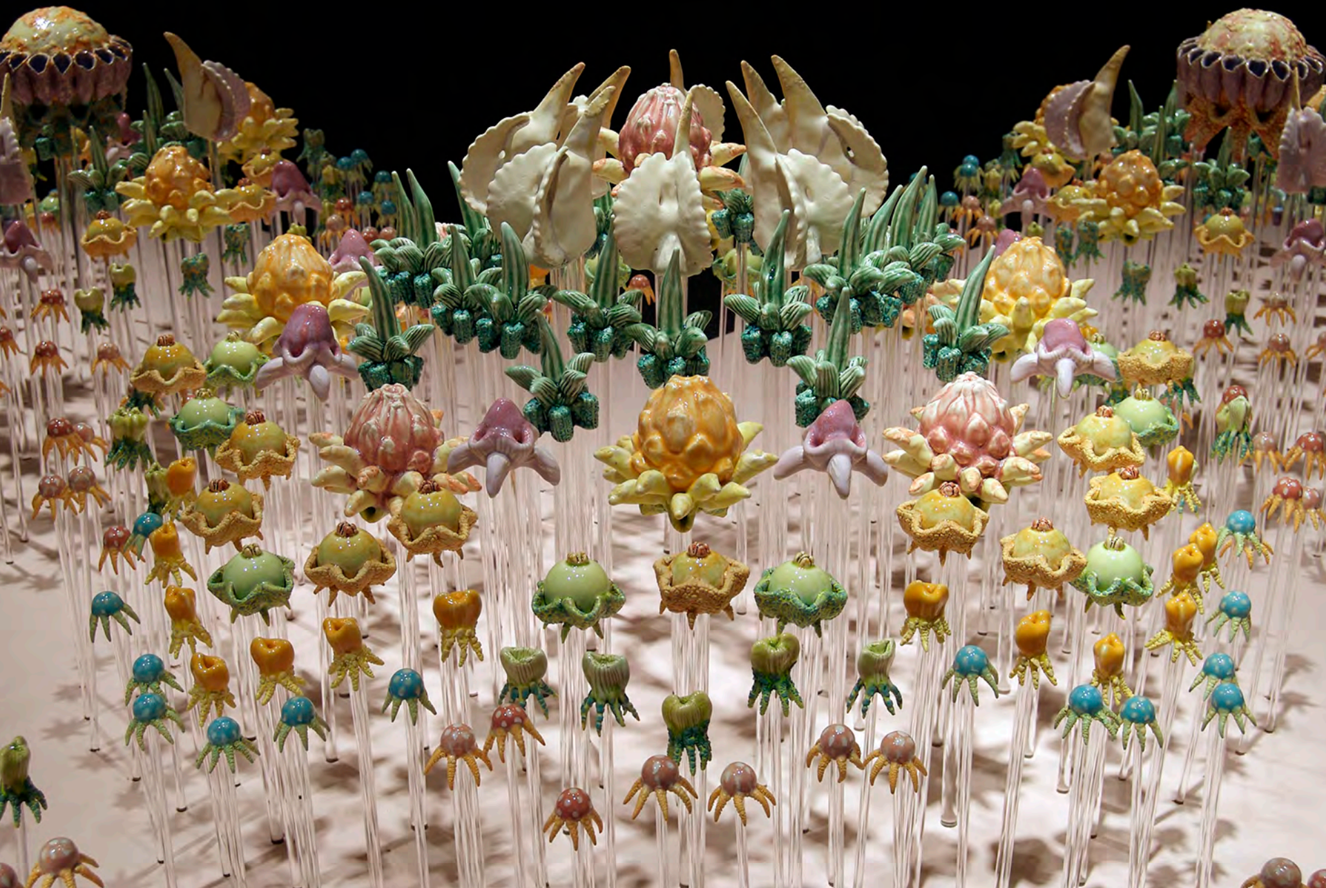
Ying-Yueh Chuang Cross Series # 3, 2009