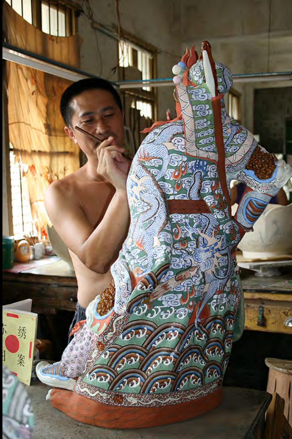
Artisan of Jingdezhen, Shi fu China, 2009.