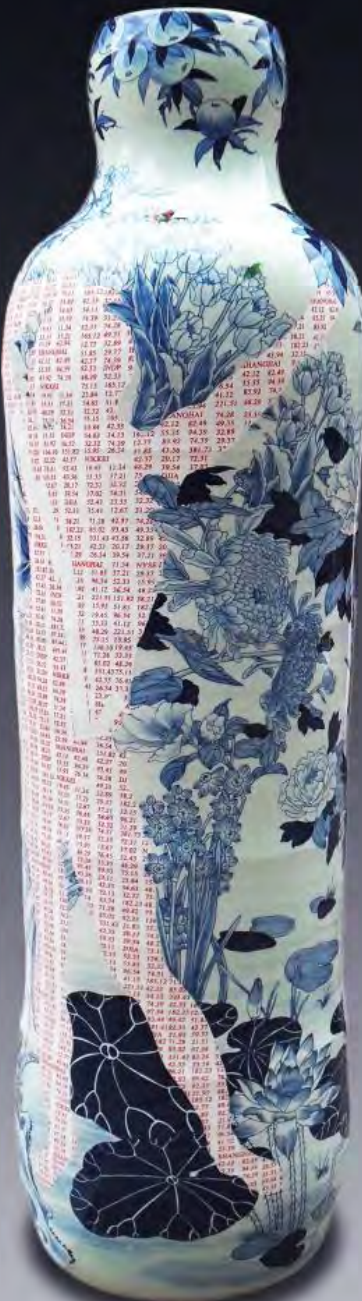
Sin Ying Ho In a Dream of Hope No.1 H 69" x D 18.5"