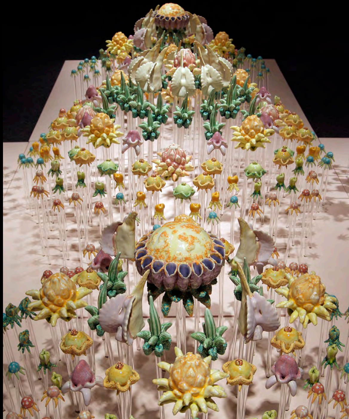
Ying-Yueh Chuang Cross Series # 3, 2009