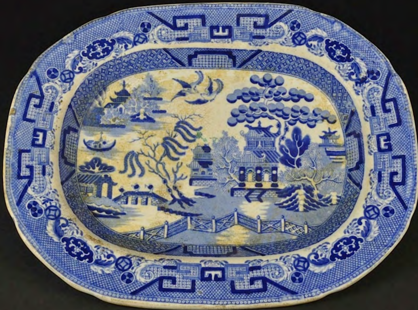
Chinese Blue and White Porcelain Willow Pattern