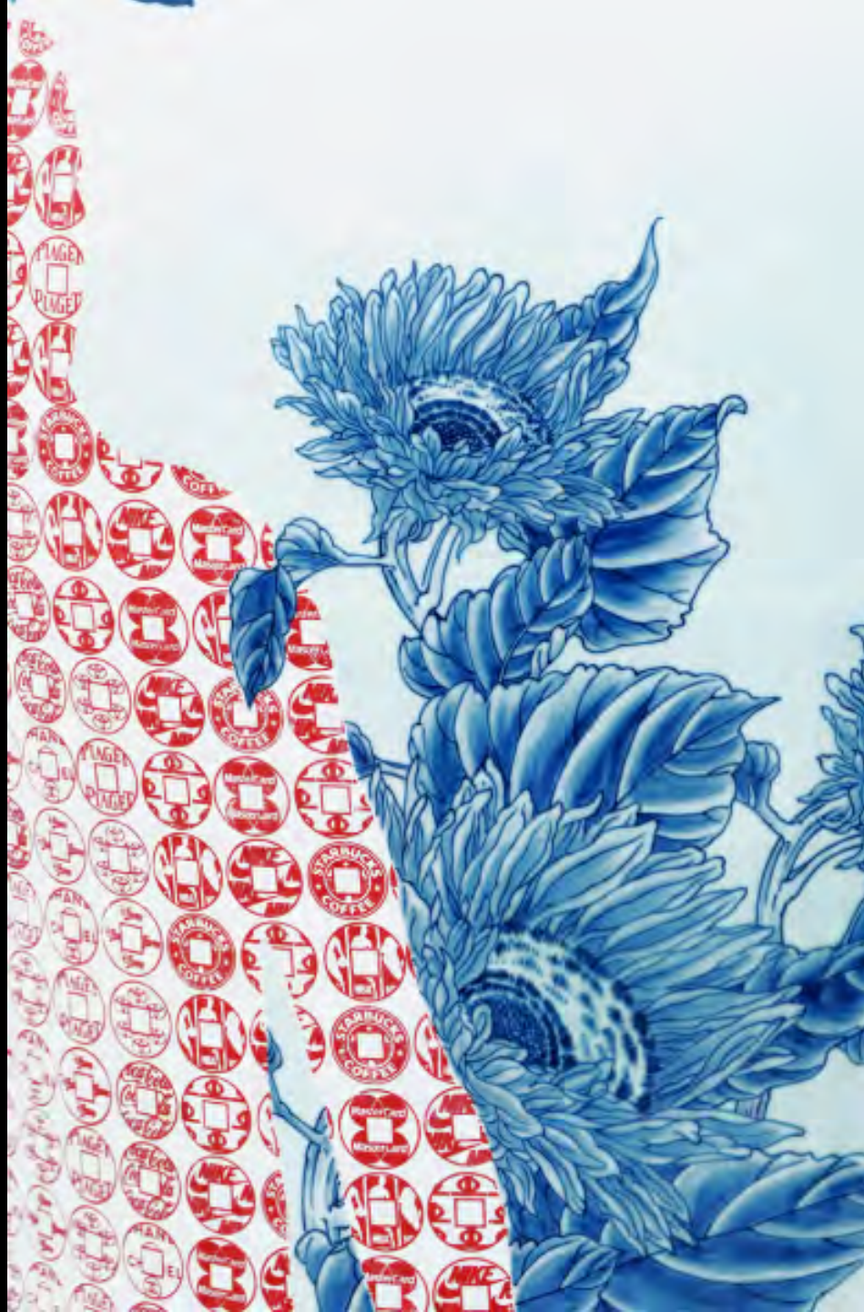
Sin Ying Ho Detail, Temptation: Life of Goods No.1