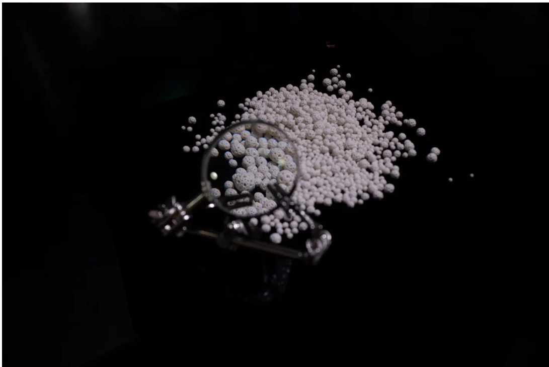
Untitled 2, Porcelain, Variable size, 2022

I am still working on combining traditional craftsmanship techniques with 3D printing technology to visualize the relationship between humans, technology, and nature with the concept of traditional Chinese philosophy. Also, I am preparing a group invitational show for next summer in Boston and my solo show at New Taipei City Yingge Ceramic Museum in 2025. (Since ceramics is a time-based material, so everything seems planned ahead of time a lot hahaha!)