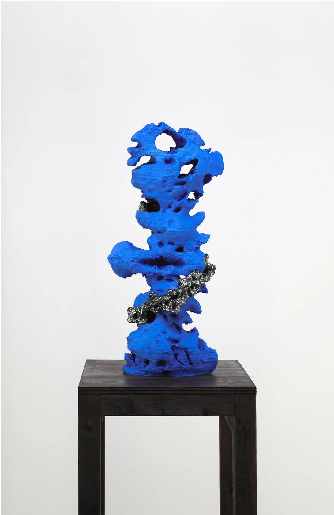
Finding the Balance 1, Glazed stoneware, underglaze, 28x15x60 cm, 2023

What brings you to art? Is there a specific topic or theme that you are interested in?