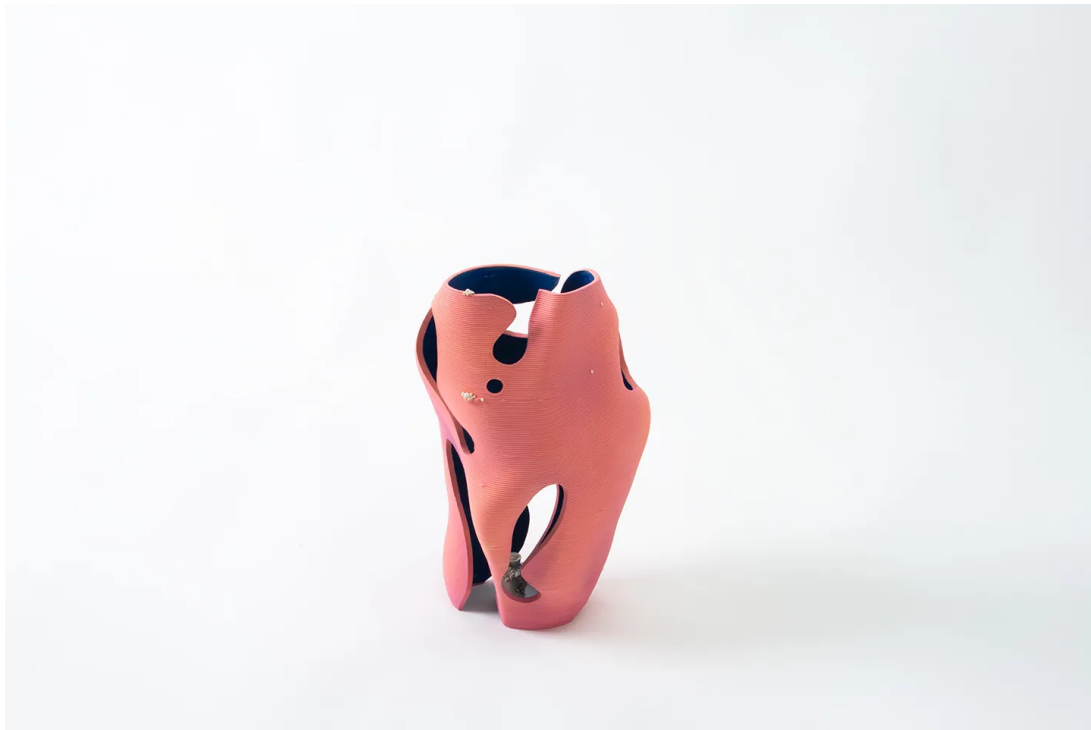
Wrapped in the Tech World, Glazed stoneware, underglaze, porcelain, luster, 35x25x20 cm, 2022

I keep working creatively because I continuously observe and perceive the bits and pieces of life, hence there are many things I want to express and questions I want to raise. If I have to choose one, I think I would pick “In short, Beauty is everywhere. It is not that she is lacking to our eye, but our eyes which fail to perceive her.” from Auguste Rodin. As long as I am still finding the feeling the moments in life, I will be keeping creatively expressing through art.