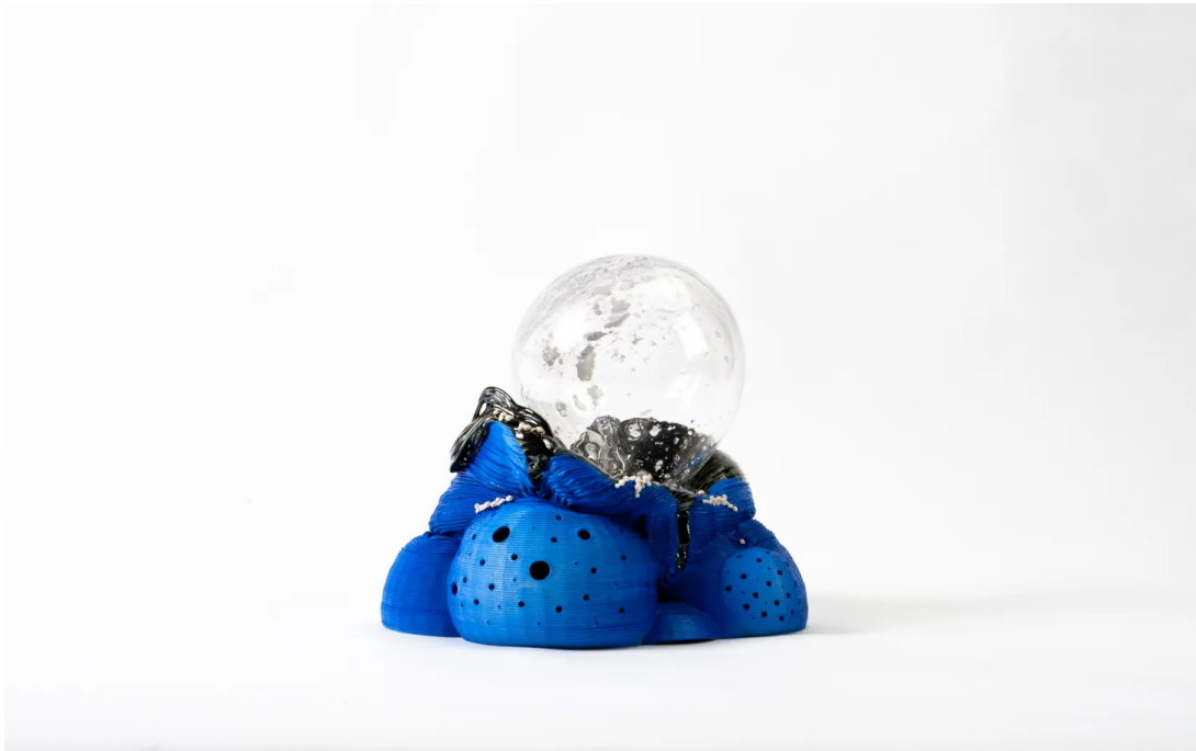
Floating, Glazed stoneware, underglaze, glass, 35x25x20 cm, 2022