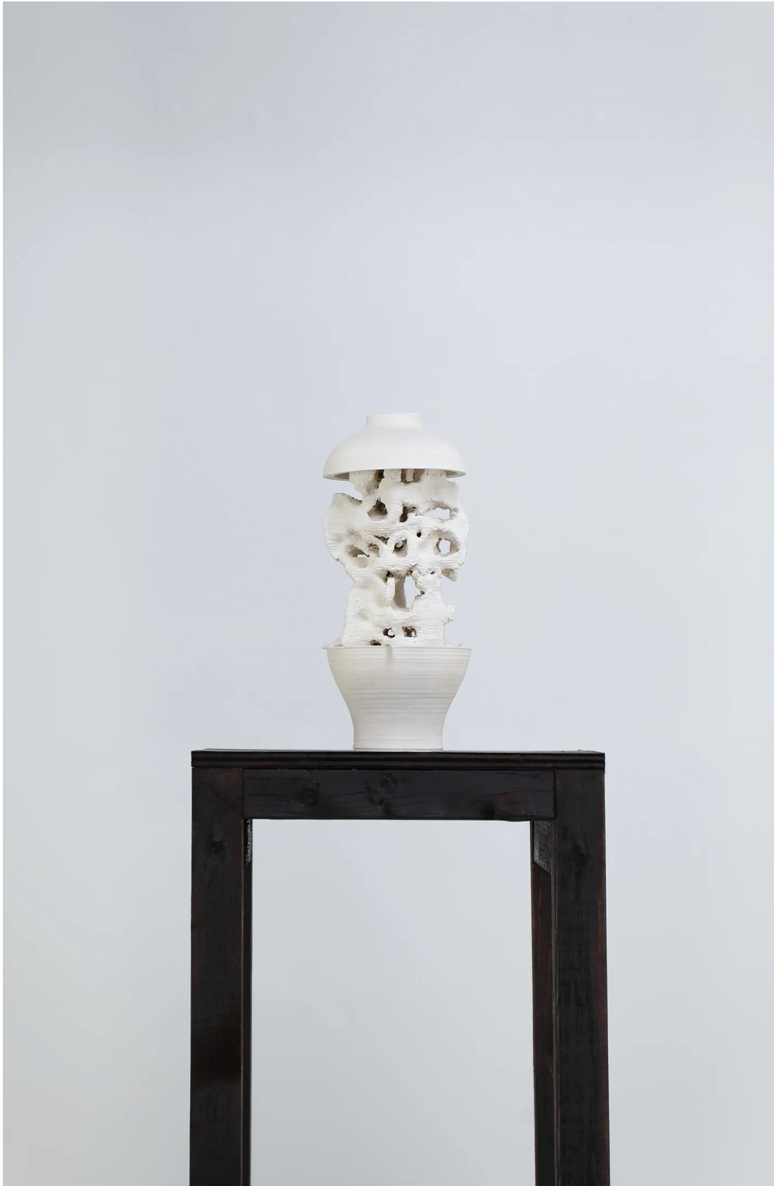
Finding the Balance 6, Glazed stoneware, underglaze, pyrometric cones, 13x13x25 cm, 2023 text & photo courtesy of Danyang Song