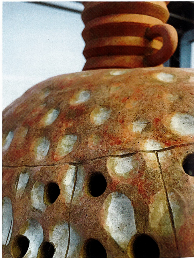
Details of Ice Dreams: Blue Dream and Red Dream , 2020 by Ingrid Lilligren. Ceramic, wood, ice, unfired clay, sheet metal. On loan from the artist.