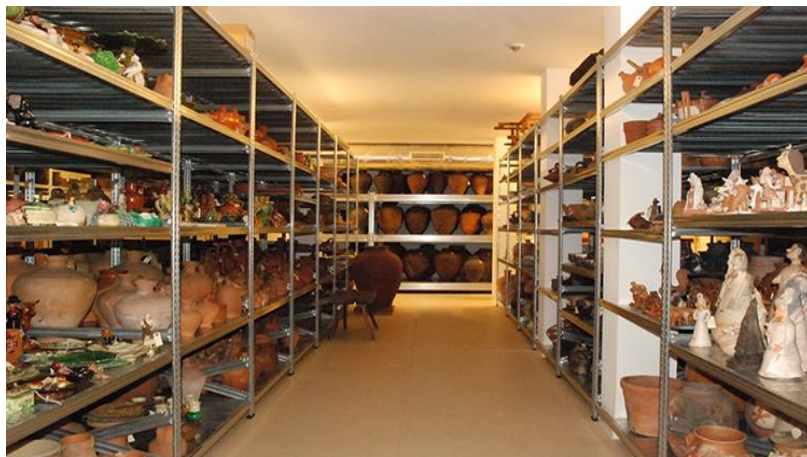
Reservations / Collection of the Pottery Museum.