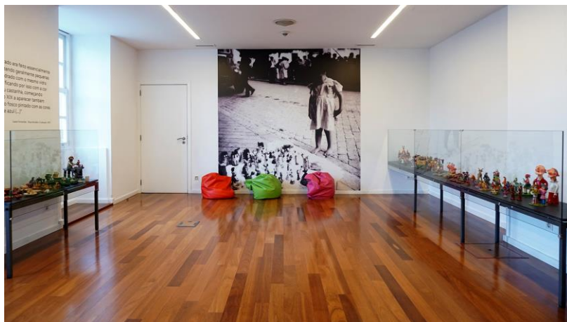
Hall of the Pottery Museum.