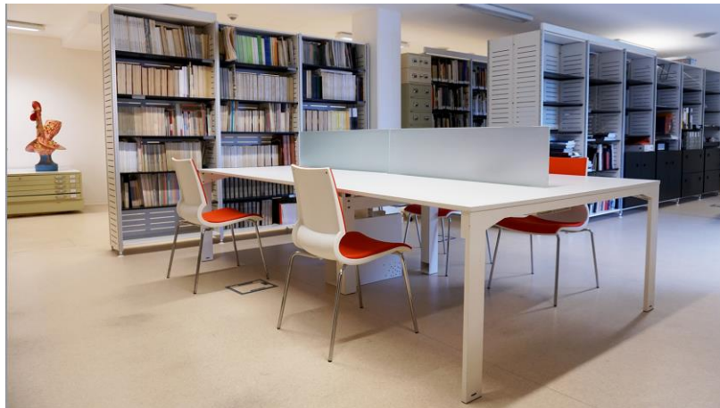
Documentation Center of the Pottery Museum.