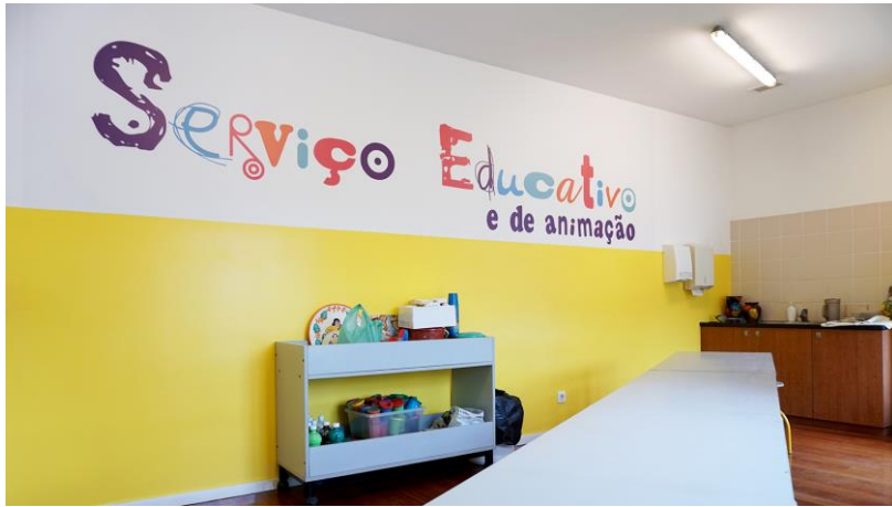
Workshops - Educational and Animation Service of the Pottery Museum.