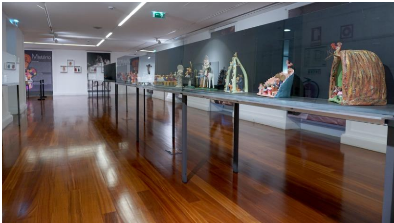
Hall of temporary exhibitions (Generation Mystery) of the Pottery Museum.