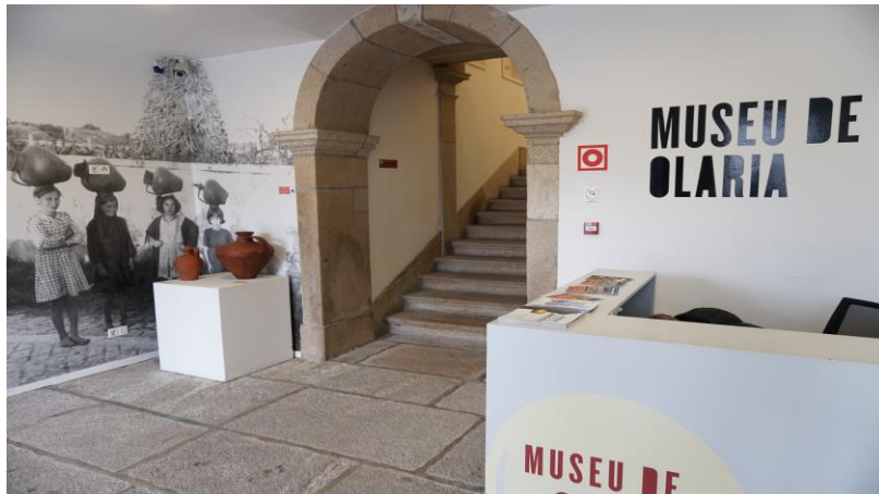
Main entrance / Reception of the Pottery Museum.