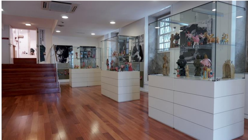
Room Temporary exhibitions of the Pottery Museum.