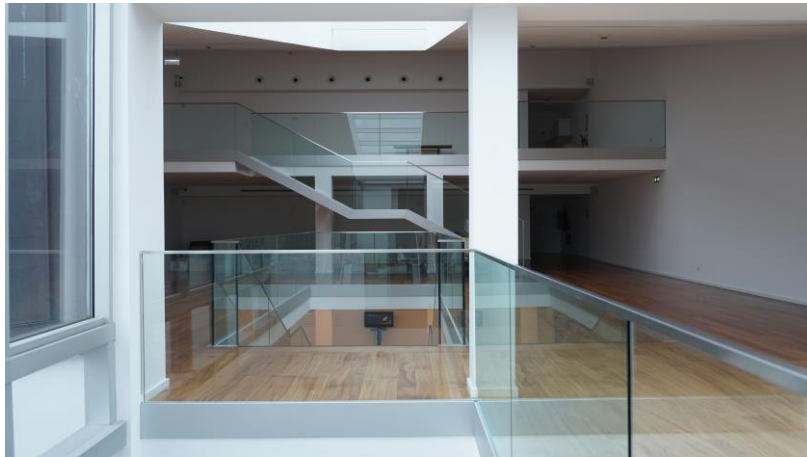
Exhibition rooms of the Pottery Museum.