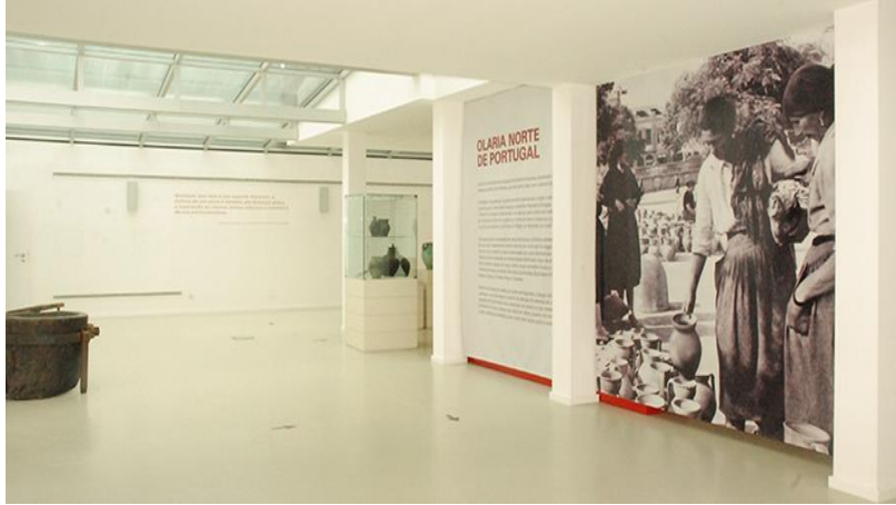
Room of the permanent exhibition (Pottery of the North of Portugal) of the Pottery Museum.