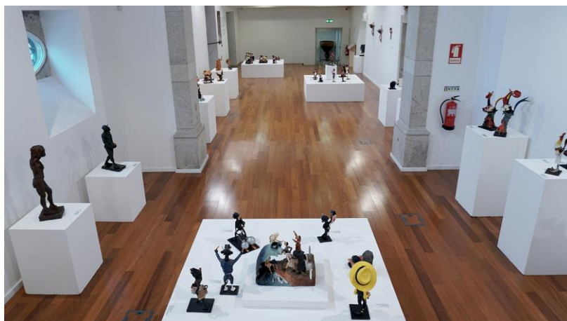
Chapel hall / Temporary exhibitions of the Pottery Museum.