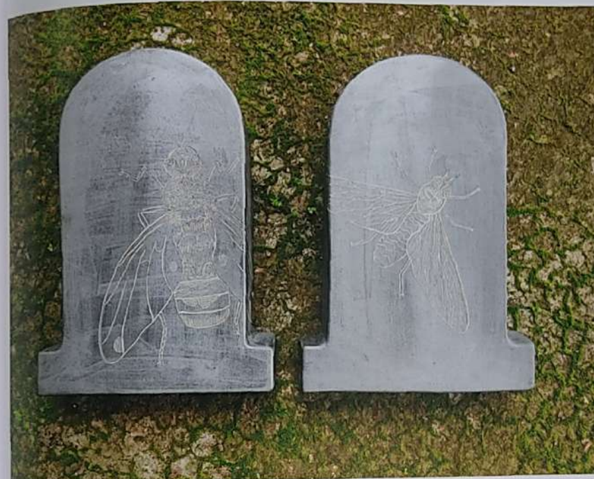
Hive - Colony Series, 2018

Pullarwar explores to develop objects that reflect the innate grace of ceramics but with the makings of sculptural structure and intensity. Isolated from a larger landscape and narrative, the organic forms inhabit a new conceptual space, sometimes bordering on the abstract; their textures and colors interpret but not necessarily imitate the natural forms they are inspired by. She works within the slender area that overlays illusion and reality - creating poetic renderings of desire for balance and harmony and a more universally equanimous relationship with the environment. Figuratively, she also draws attention to the beauty and complexity of the architecture within these varied nests, reflecting profound observation and research before producing any single series and reliving the violations of space and place. Pullarwar creates a strong commentary on severe encroachments of the urban world or objects crafted as intimate pieces that remind one of the irreplaceable loss.