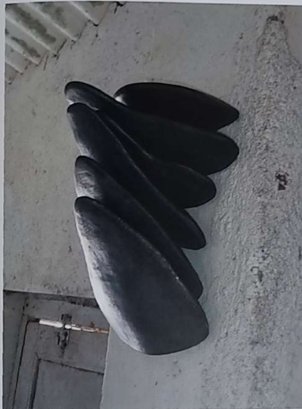
Home Sweet Home from the Colony Series , 2018

I explore the medium and push the boundaries of my practice to develop objects that reflect the innate grace of ceramic but with the makings of sculptural structure and intensity. Isolated from a larger landscape and narrative, the organic forms inhabit a new conceptual space, sometimes bordering on the abstract; their textures and colors interpret but do not imitate the natural forms they are inspired by. I am working within the slender area that overlays illusion and reality—creating poetic renderings of desire for balance and harmony, and a more universally equanimous relationship with the environment. Figuratively, I draw attention to the beauty and complexity of the architecture within these varied nests, reflecting profound observation and research before producing any series. I continue to map outwardly insignificant yet valuable components of the natural world, building bridges that negate the horrors of human trespass.