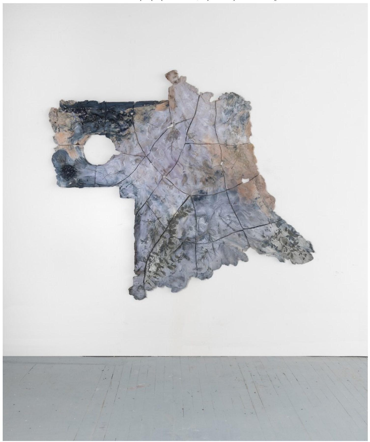
Brie Ruais' "Topology of a Garden, Southwest, 127.5 lbs.," 2018. Pigmented clay, underglaze, and hardware, 68 inches by 78 inches by 2.5 inches. (Brie Ruais/Albertz Benda Gallery/Craft Contemporary)