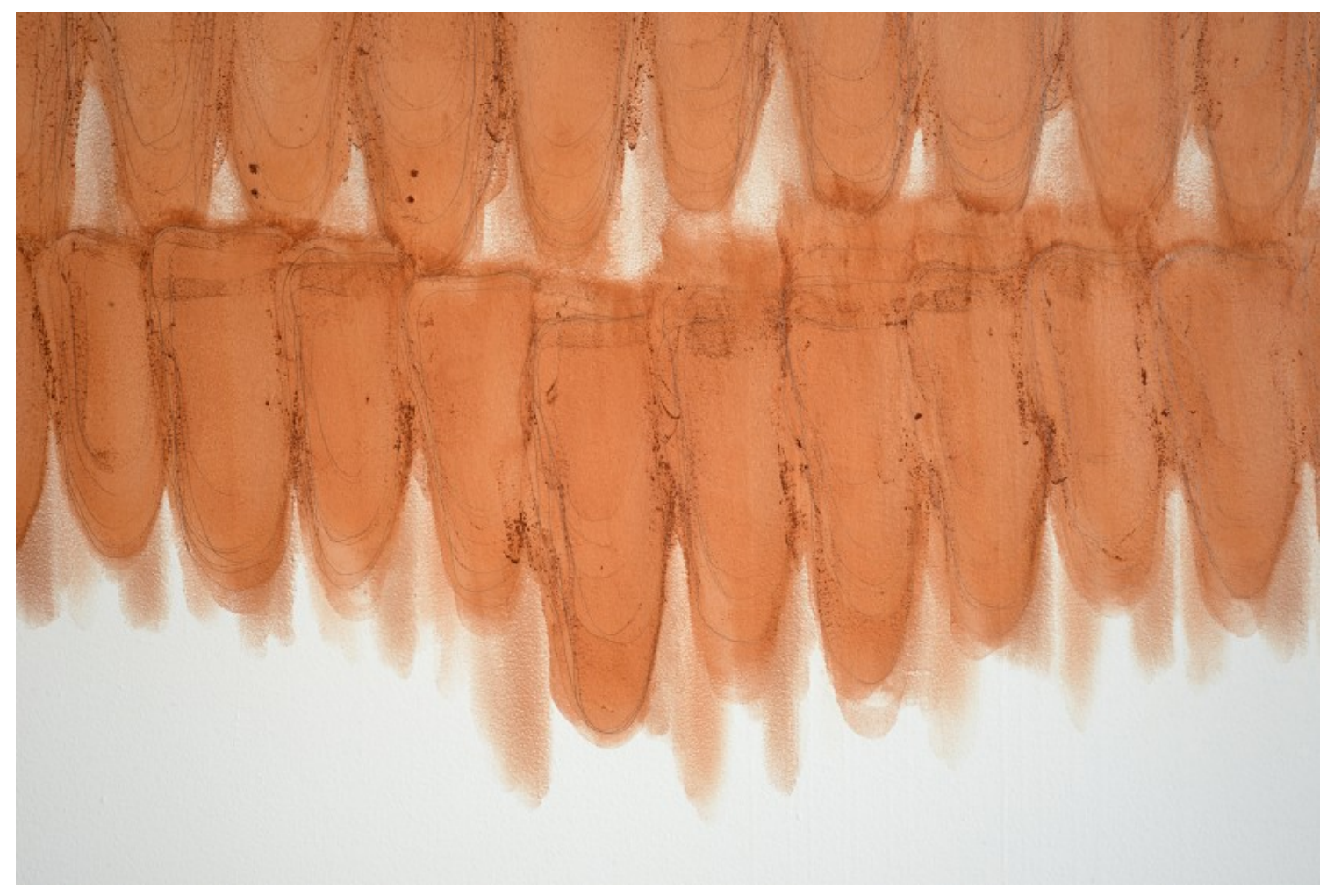
Nicole Seisler's "Preparing" series, site- specific drawing, part of the Craft Contemporary biennial.

Nicole Seisler transforms the preparatory act of wedging clay (a kneading process to establish consistency and eliminate air bubbles) into a mark-making ritual, enacted on the wall rather than on a work table. Practice turned performance, the action endures — until the end of the show — as mural, a patterned weave of residual traces.