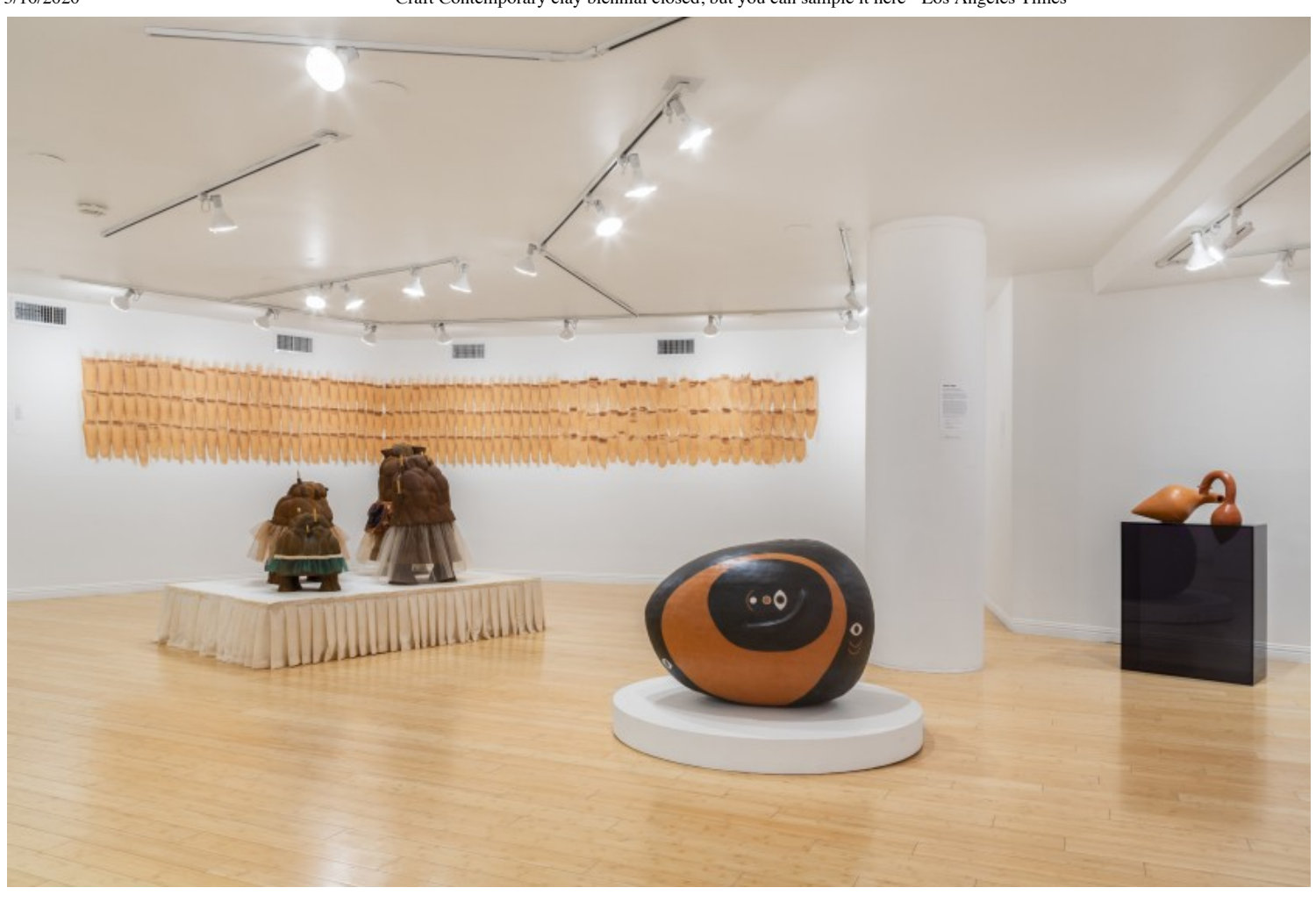
Installation view of the clay biennial (Blake Jacobsen)

"The Body, The Object, The Other" has its weak spots: work that is excessively literal, a handful of pieces that aren't recent. But the show, scheduled to run through May 10, makes a lively addition to the conversation in clay.