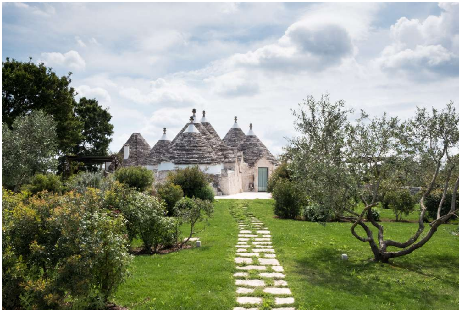
Morfologia delle Meraviglie a cura di Lorenzo Madaro Ostuni 2019