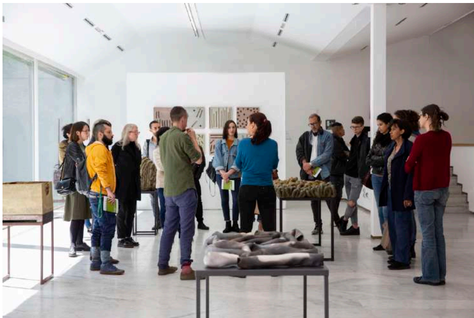
PAC Milano Anna Maria Maiolino O Amor se faz revolucionário workshop 2019