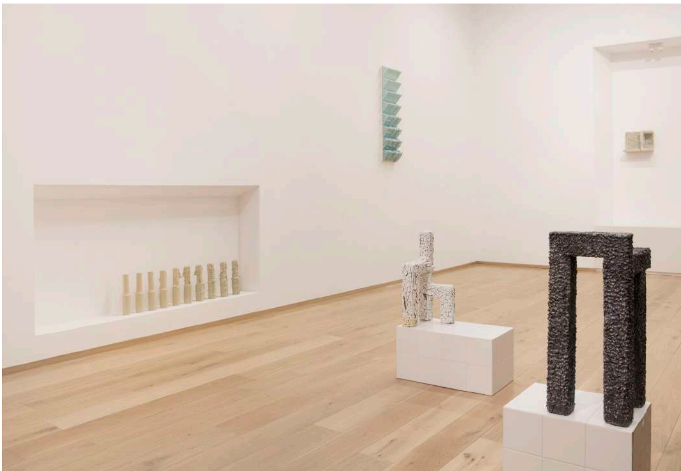
Inner Geometry Irina Razumovskaya 2018