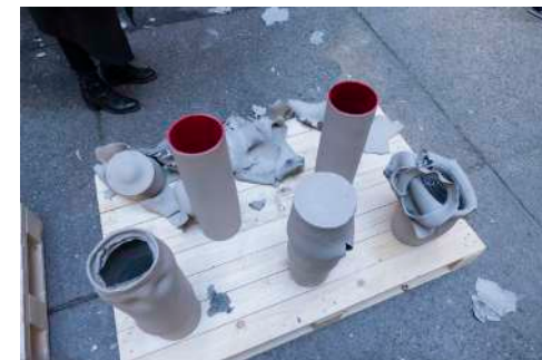
Creative Execution Loredana Longo 2019