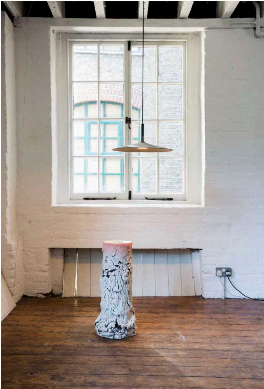
The Liminal Space Irina Razumovskaya Oneroom, London 2018