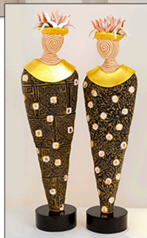
Crown of Cones , acquired for the permanent collection of AMOCA-The American Museum of Ceramic Art