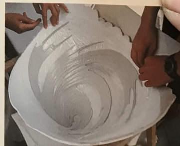
Form is constructed in stoneware former.