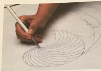
Detail of drawing.