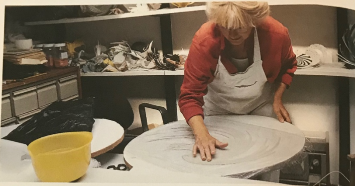
Flattening the porcelain strips on to the pattern.