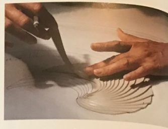
Placing the porcelain strips on to the pattern.