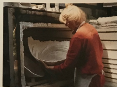
Object is placed in kiln with former.

studying pa combine th After wec body stain of only a f the surface slabs are c superimpo abstract o unify the s introduce coloured form and the piece