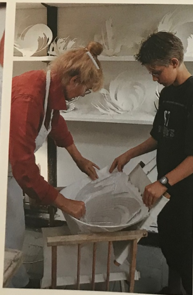
Form is placed into stoneware former.