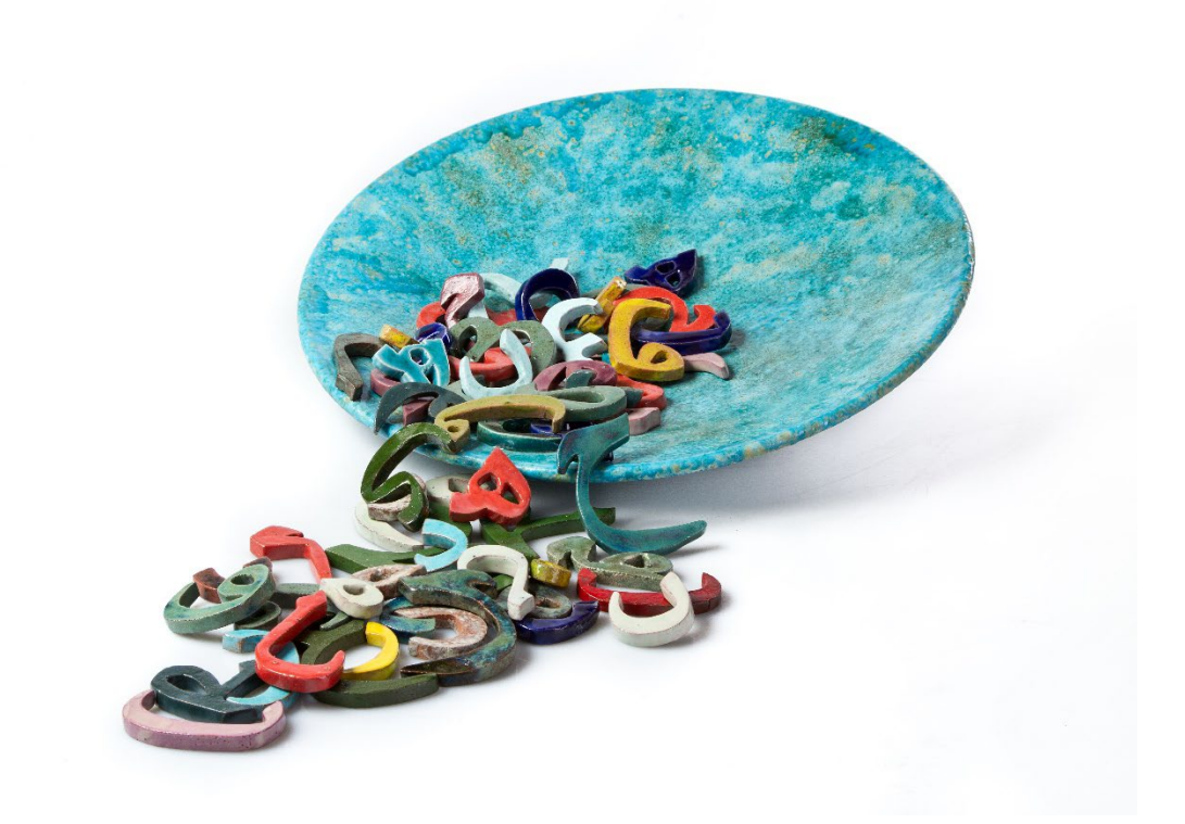
Precious! -50x40x20- Ceramic-2012