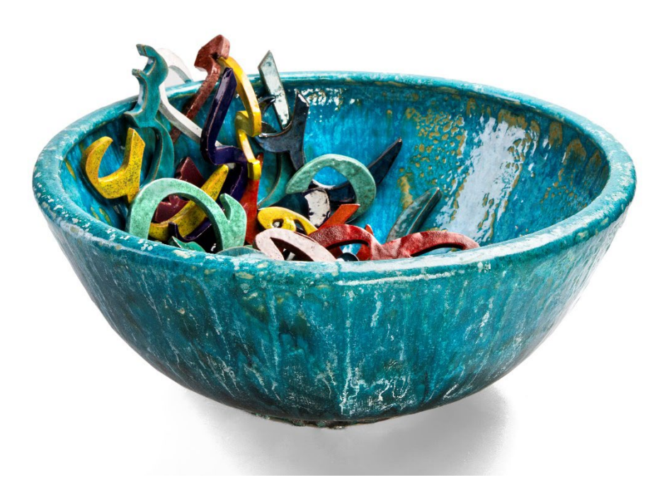
Precious! - 44 diameter x 24 height-Ceramic-2013