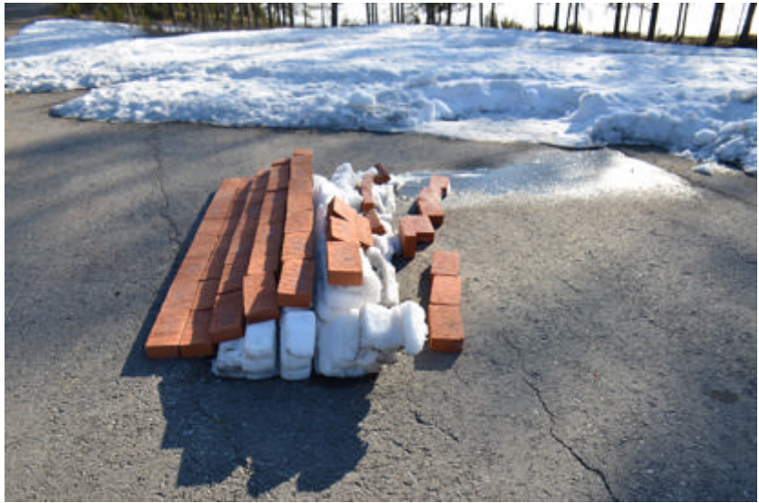
等待气候变暖的北极烈日把雪融化，砖块倒地。 Wait for sunshine to melt snow and bricks fall down.