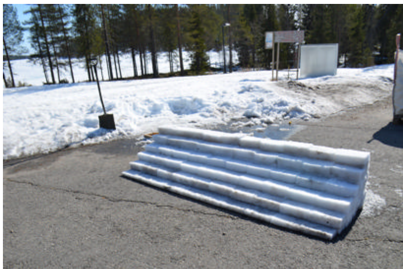
用芬兰的雪做砖 Use snow in Finland to make bricks