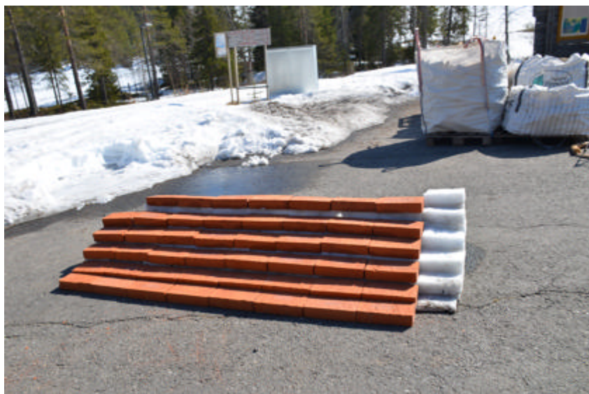
垒上芬兰的土砖 Cover with clay bricks