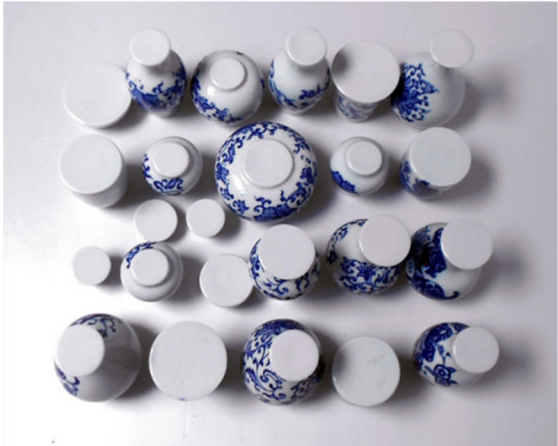
Title: Hometown Specialty / 家乡特产 Size: Random