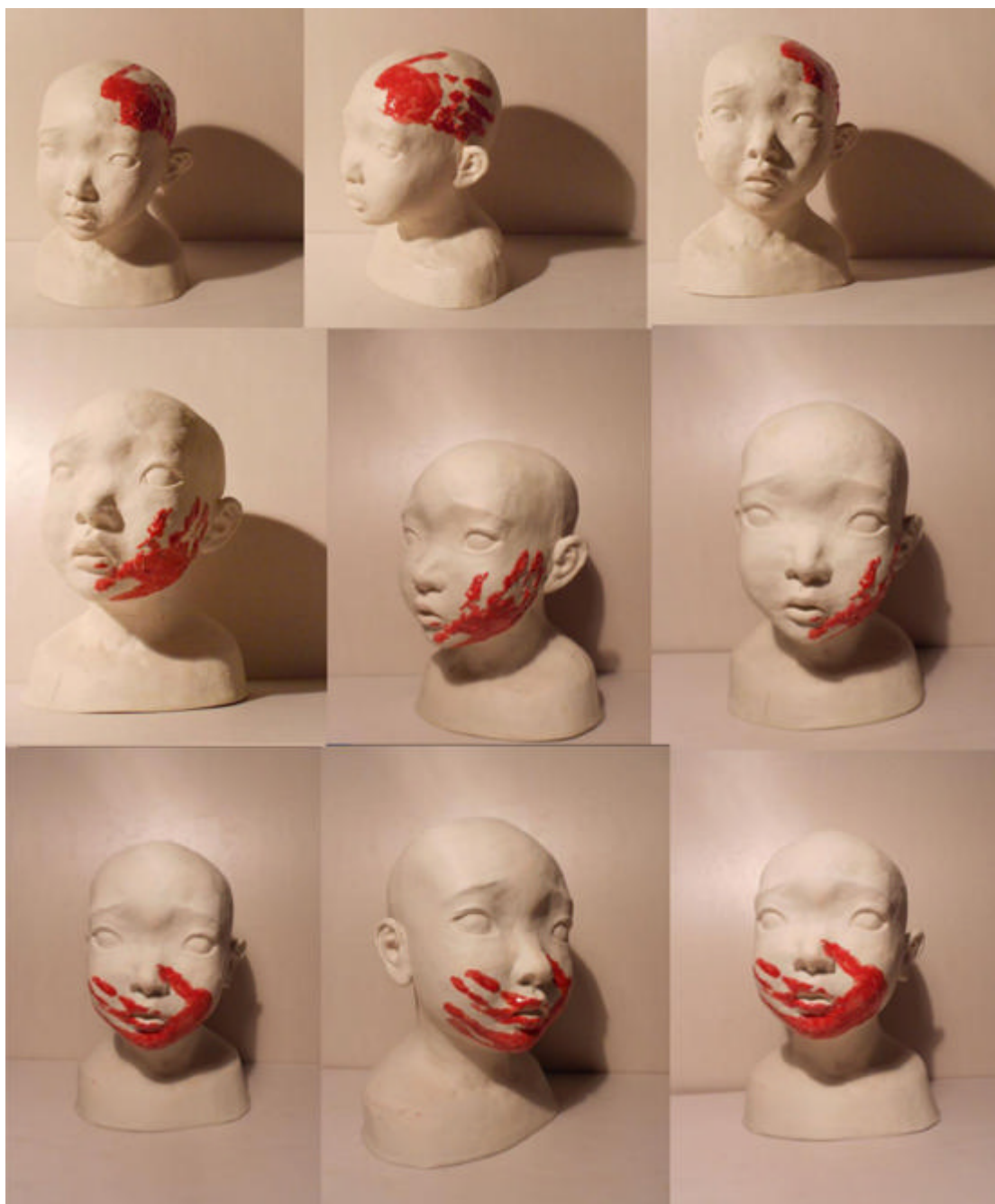
Title: Ah Dai (Foolish Me) / 바보 / 阿呆 Size: 20*10*30 cm