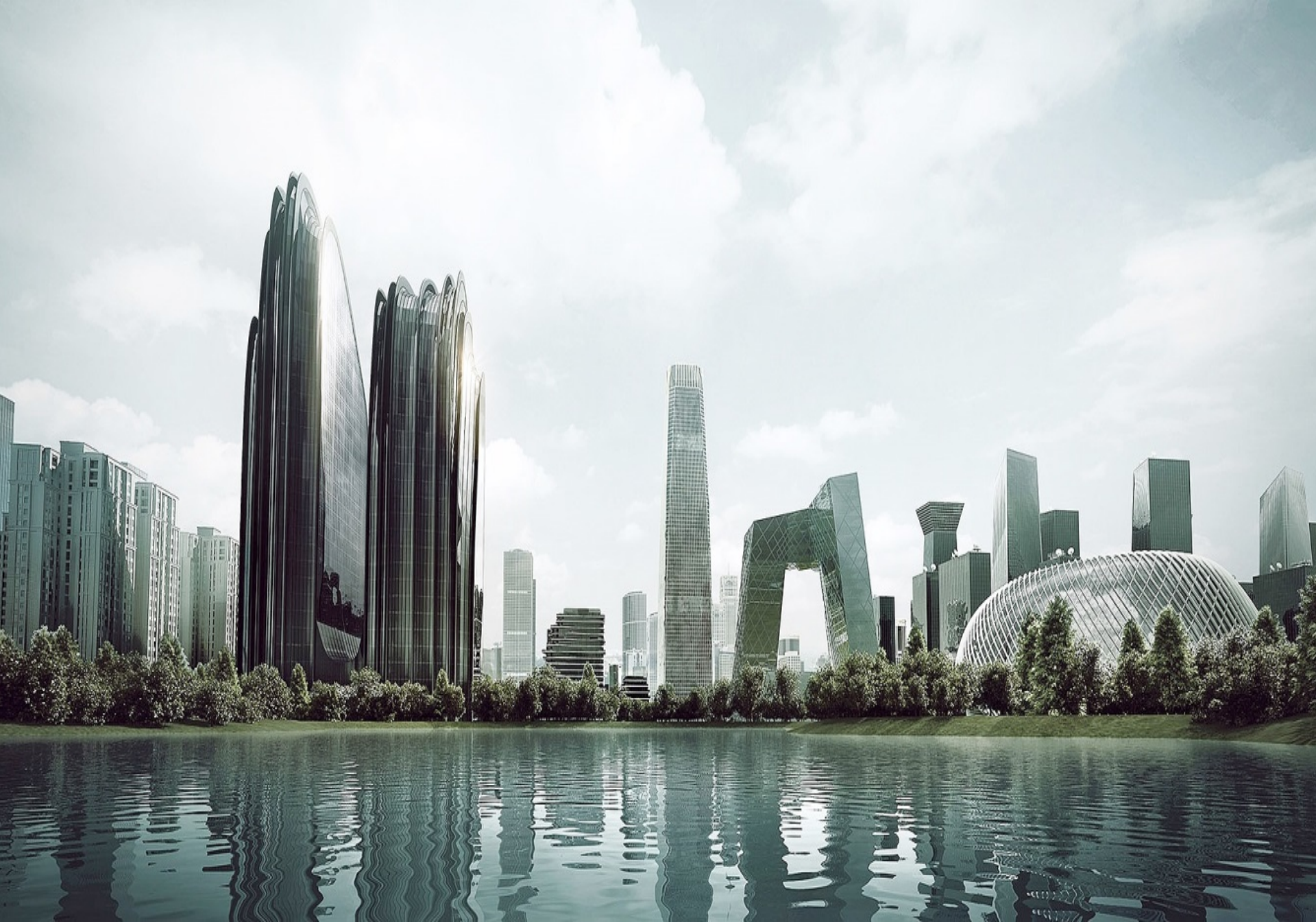
“Chaoyang Park Plaza”, mirrors the appearance of mountains and lakes depicted in traditional Chinese landscape paintings, designed by Chinese architecture firm MAD , is under construction since 2014, Beijing, China