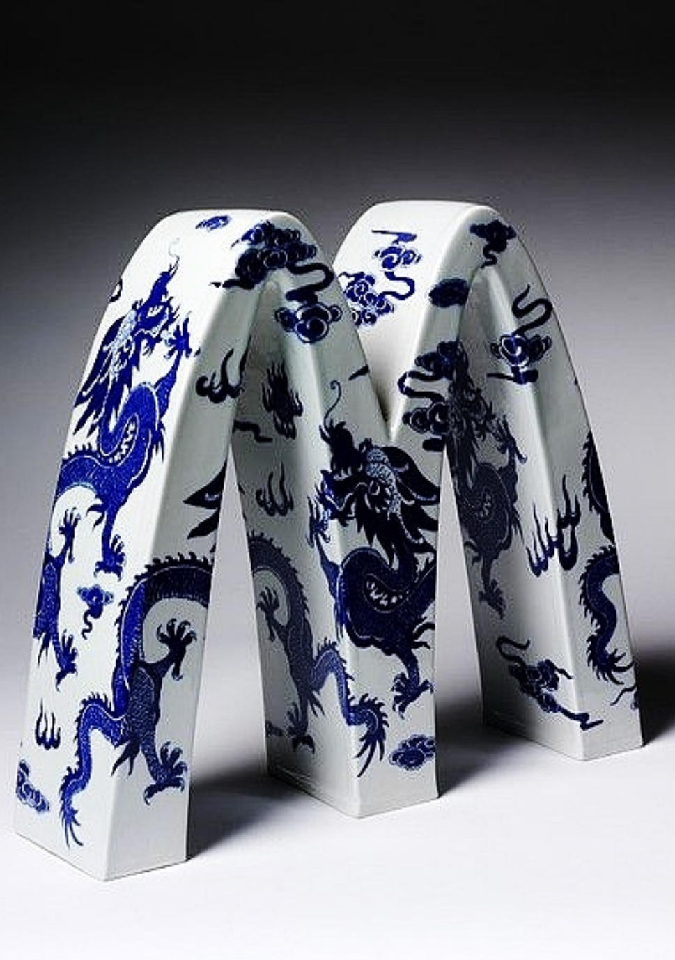
'McDonald # 1', 2007, Porcelain, Li Lihong , China