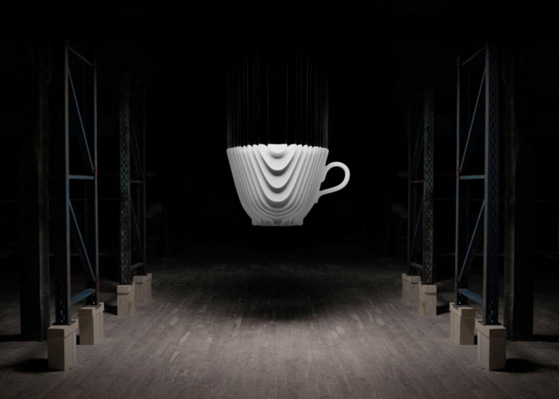
“Ceci n’est pas”, a study in duality, positive/ negative, tangible/ intangible”, Bertrand Fèvre, French