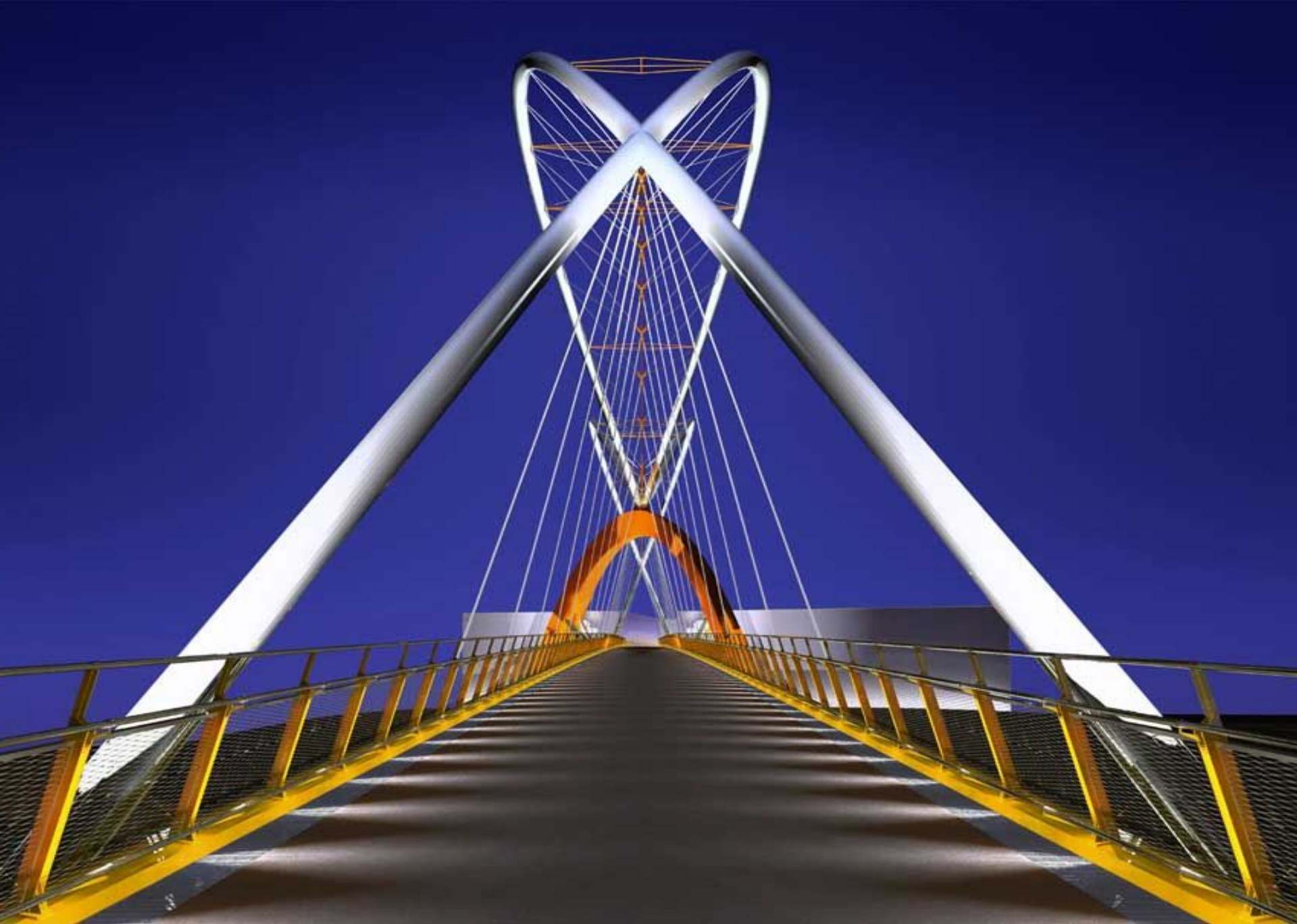
Architectural Karolina Bridge, Czech Republic, design by Eva Jiricna, UK