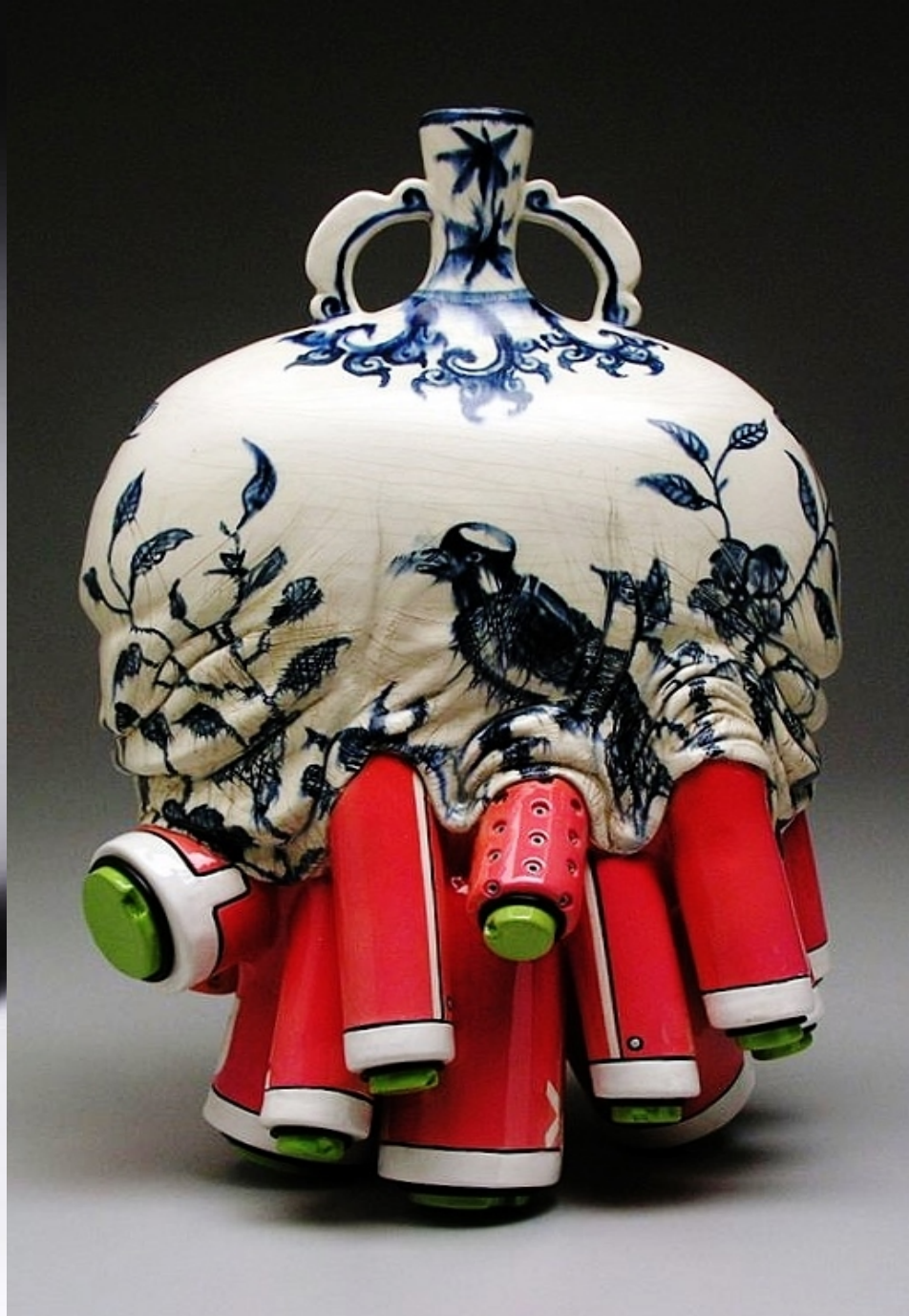
'Manga Ormolu series', 2009, Porcelain, Brendan Tang, China