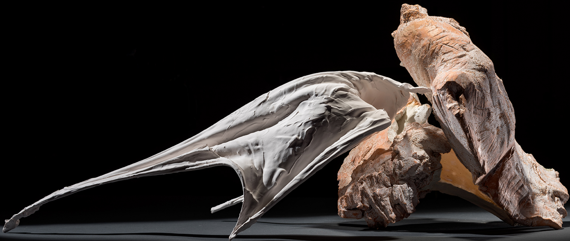
"Mother and Child", H 26 x L 41 x W 19 inch (67 x 104 x 49 cm), 2016, Ray Chen Taiwan/US