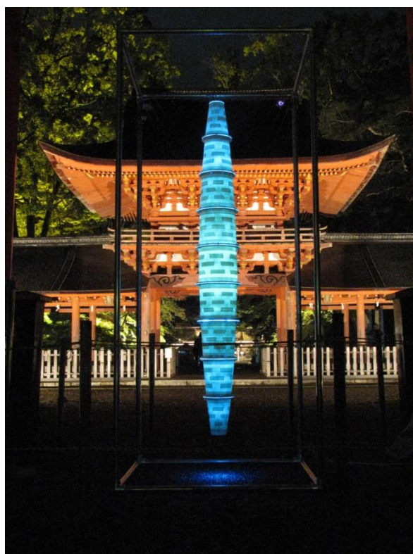
Fig. 6. Tanaka Tetsuya, 輝器 KAGAYAKI- Vessel of light , 2012, mixed media, semitransparent clay, acrylic bolt, fluorescent material, solar panels, brightness sensor, black light fluorescent tubes, batteries, 288 x 36 x 36 cm

Fig. 5 is a HIBIKI vessel for sounds. You can stand in front of this work and hear the sounds that come from the inside of the works.