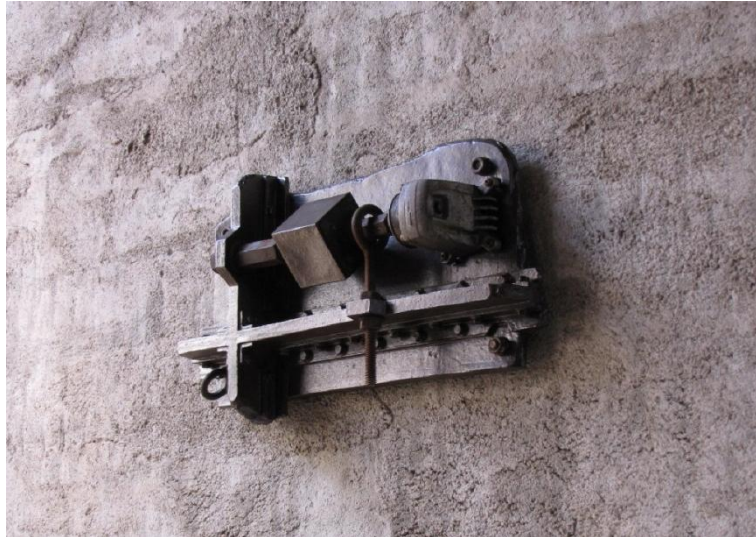
Fig. 2. Tanaka Tetsuya, Thinking on the Wall No.31-Sound Kept Secret , 2009, mixed media clay, bolt, nut, motor head, 24 x 41 x 9 cm

Fig. 2 is one of Thinking on the Wall series. Thinking on the Wall series combine ceramic and metal thing also. This part is motor head of a grinder. Sometimes I use scraps to create things.