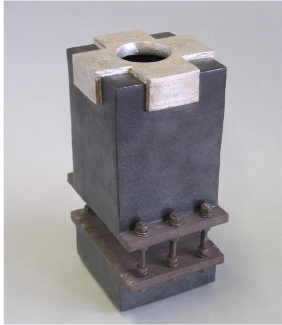
Fig. 4. Tanaka Tetsuya, ARK No5 , 2006, mixed media, clay, bolt, nut, 27 x 30 x 12.5 cm

Japanese craft is called "KOUGEI." KOUGEI is slightly different from Western craft. In the West, art is considered to be higher than craft. In Japan, KOUGEI and arts are the same, sometimes KOUGEI can be higher than art. Please imagine a tea bowl that can be traded for 30 thousands euros. These tea bowls are not antique. Japanese contemporary ceramic art grows from this KOUGEI.