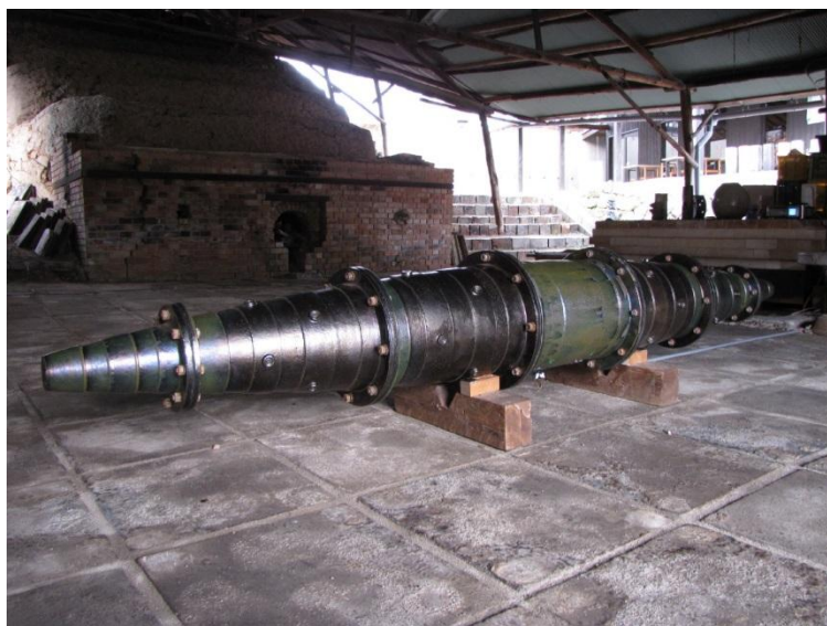
Fig. 5. Tanaka Tetsuya, 響器 HIBIKI-Vessel of sounds , 2010, mixed media, clay, bolt, nut, microphone, amplifier, speaker, infrared sensor, 50 x 286 x 41 cm

Fig. 5 is a HIBIKI vessel for sounds. You can stand in front of this work and hear the sounds that come from the inside of the works.