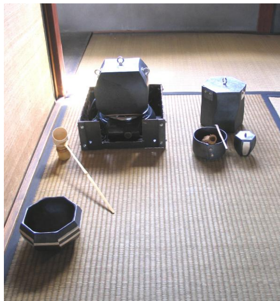
Fig. 3. Tanaka Tetsuya, BASARA Tea Wares , 2007, mixed media, clay, bolt, nut, iron plate, aluminum plate

Fig. 2 is one of Thinking on the Wall series. Thinking on the Wall series combine ceramic and metal thing also. This part is motor head of a grinder. Sometimes I use scraps to create things.