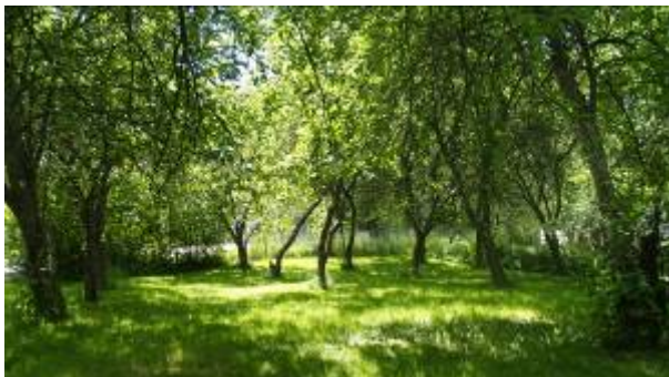
Leenas apple garden

We had planned to work outdoors in cooperation one week to create works that was related to the nature. The place chosen was the beautiful apple garden of Leena Juvonen. Due to heavy rain, we had to do most of the work inside in Leenas studio. To work on the sculptural aspects of the word shelter seemed to be very inspiring and interesting, especially in the surroundings of the garden. It opened up both for conceptual discussions and new experiences of different techniques.