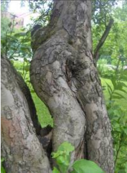
Movements in the trees (stammene)

Material, shapes and structures from the trees was used in different contexts. For example, like making sketches of different structures of branches and to use those in new shapes, shown in Astrid's works. Another way is seen in Malene's large sculpture where she uses the branches as a structure to build the sculpture on top of/in connection with. In Lena's work, she uses the branches as a pattern (relief /picture) pressed into the clay and coloured with back stains. Her work is made from slabs pressed into a mould made from the back of a body.