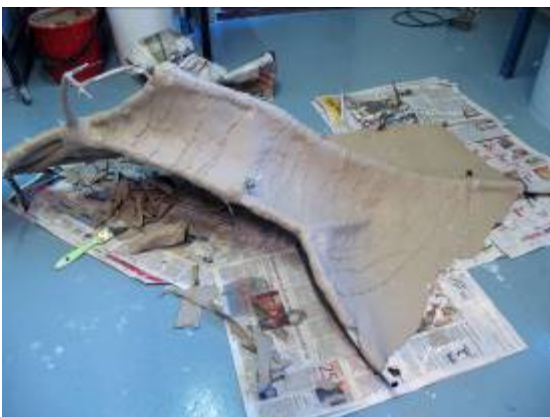
Malenes work ( a wooden structure covered with thin slabs, paperclay)