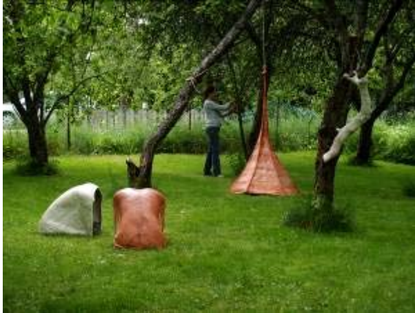
In the apple garden

The two last days it stopped raining. As a conclusion we moved out our sculptural work to the garden and the environment it actually was meant for. The theme shelter can be interpreted in many ways for example inner and outer space. Leena's two sculptures made as a shell from a body create a large negative inner space. When placed in the garden Leena opened up the earth by digging a hole in the lawn inside the negative space of the form. The black moist earth and the shape of it functioned as a nice contrast to her sculptures.