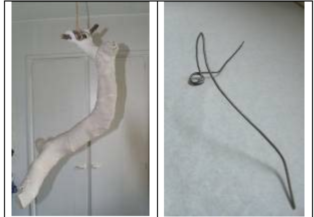
Astrids works (wire string (l)/paperclay (h))

Material, shapes and structures from the trees was used in different contexts. For example, like making sketches of different structures of branches and to use those in new shapes, shown in Astrid's works. Another way is seen in Malene's large sculpture where she uses the branches as a structure to build the sculpture on top of/in connection with. In Lena's work, she uses the branches as a pattern (relief /picture) pressed into the clay and coloured with back stains. Her work is made from slabs pressed into a mould made from the back of a body.