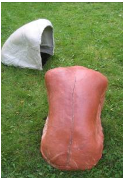
Leena's works in connection to the earth

The two last days it stopped raining. As a conclusion we moved out our sculptural work to the garden and the environment it actually was meant for. The theme shelter can be interpreted in many ways for example inner and outer space. Leena's two sculptures made as a shell from a body create a large negative inner space. When placed in the garden Leena opened up the earth by digging a hole in the lawn inside the negative space of the form. The black moist earth and the shape of it functioned as a nice contrast to her sculptures.