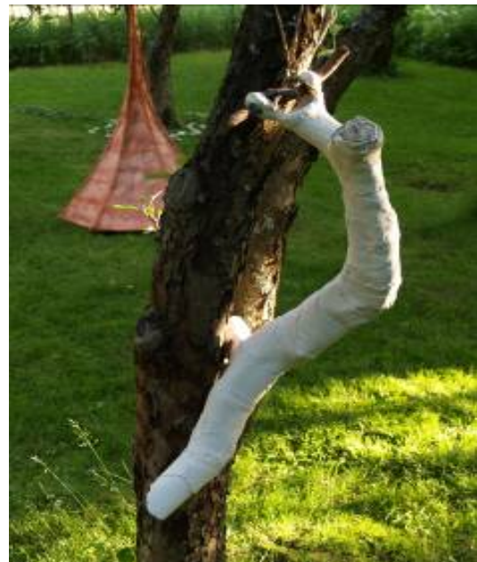
Astrid's works hanging in the trees