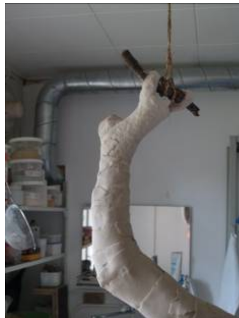
Astrid's work - upside down