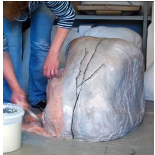
Leena working with terra sigillata