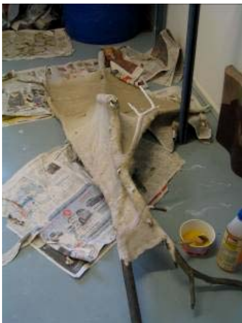
Malene's work, strengthen the sculpture with layers wood glue

The strength of the green ware of paperclay is amazing. Specially were the structure (construction) of the shapes are well done. Malene, who has been working a lot with installations made from unfired paperclay, shared her experience in using wood glue to strengthen the ware even more. She covers the surface with several thin layers of wood glue, using a brush. With that type of surface the sculpture can even take some rain for a while, before getting dissolved.