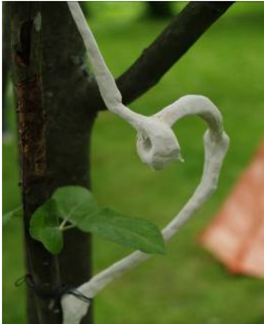
Sketch of structure from the trees (Astrid)