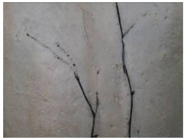
Detail from Leenas work