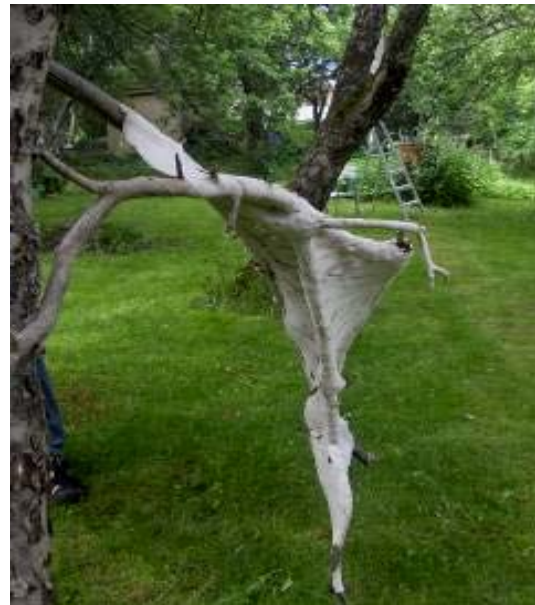
Malene's work in connection with a tree