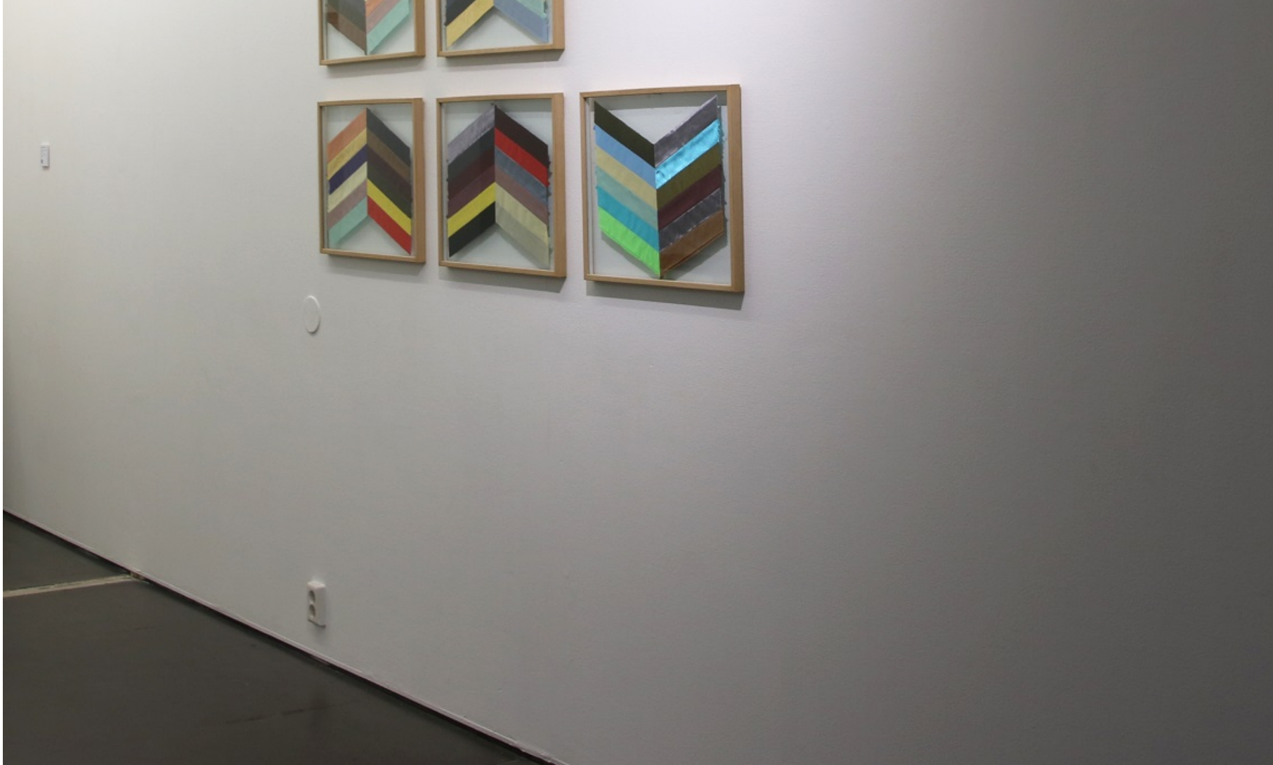
Inger Bergström "Cut Up Emblem II-VI"