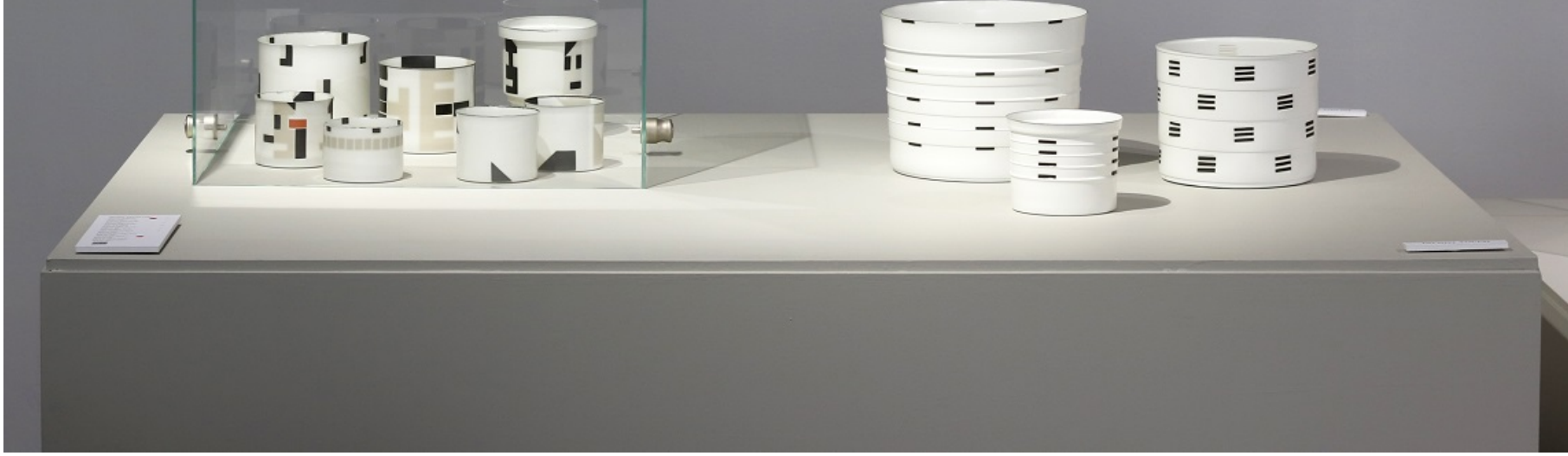
Bodil Manz, installation.