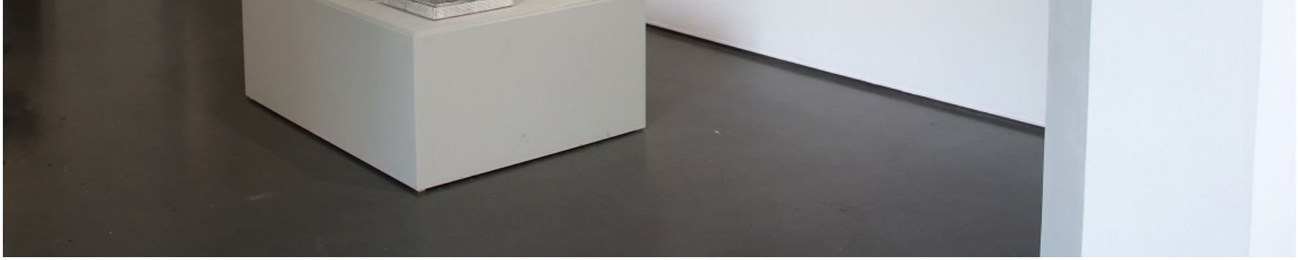
Inger Bergström "Cut Up Star I-II" and Karin Bengtson "Composition I-V"