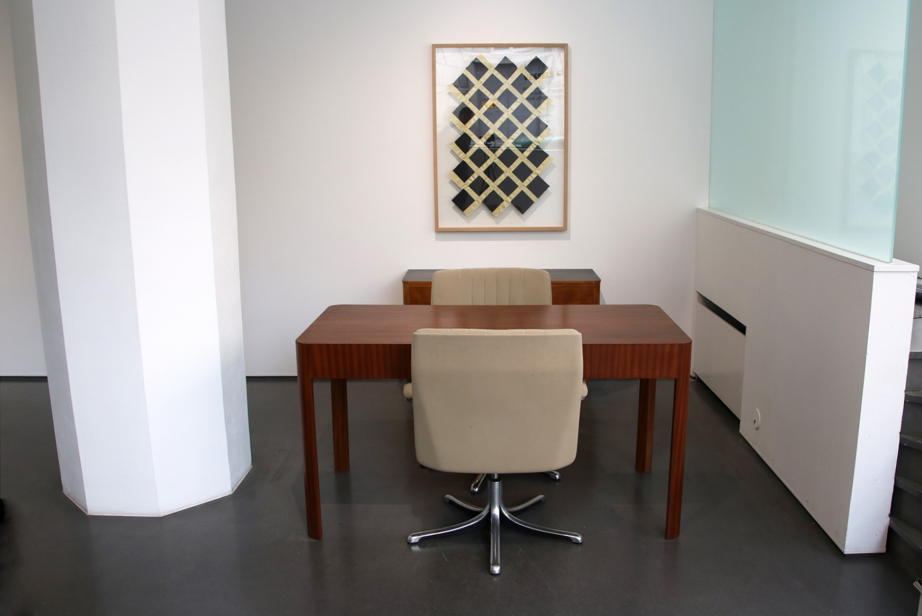
Inger Bergström "Braid"