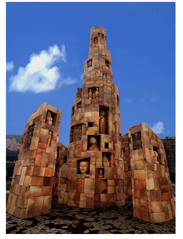
(Fig. 5)Light of China

Ceramic Cultural Square was built by ceramic headquarters with an aim to enhance its cultural core. It consists of the main sculpture "Light of China" (Fig. 5) (19 meters high) and many other groups of large ceramic sculptures such as "Wall of Pottery Figurines from the Han Dynasty", "Wall of Pottery Figurines from the Qin Dynasty", "Wall of Pottery Figurines from the Tang Dynasty"(Fig. 6), "Sanitary Industry & Waterscape Wall". By purchase, reproduction and integration of ceramic sculptures of different generations, I created a work providing audience with completely new visual experience, which is a new