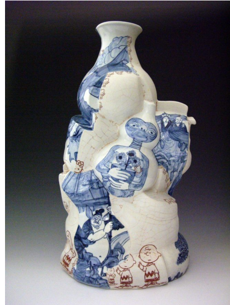
Fig. 11. Sin-ying Ho, Trilogy no. 2: Monkey King, Charlie Brown, Hello Kitty and ET , 2007-09, porcelain, wheel-thrown and slip-cast, with hand-painted underglaze cobalt blue decoration, digital decal transfer, and terra sigillata high-fire reduction, 39 x 27.5 x 27.5 cm.

Ho's effacing of the boundaries between past and present, classical and kitsch, is accomplished even more successfully on Trilogy no. 2 , in which the vision of a future community founded on mutual recognition and cross-fertilization is extended beyond the confines of the planet. To the "trilogy" of Charlie Brown, Hello Kitty, and the protagonists of Journey to the West , she adds a fourth character that clarifies her aims: E.T., the protagonist of Steven Spielberg's 1982 film, E.T. the Extra-Terrestrial . Unlike Charlie Brown and Hello Kitty, with whom the alien seems to share a closer connection, E.T. is depicted in cobalt-blue rather than iron-red decal and so is compositionally integrated into the scenes from Journey to the West . These, in turn, are even more fragmented, reduced to an ornamental series of narrative splinters from which only the rotund figure of Zhu Bajie emerges clearly. Ho has explained her juxtaposition of these images as a representation of different "layers" of pop culture within her life. As a child, she watched animated and cinematic adaptations of the Chinese tale, while her older sisters watched Charlie Brown cartoons; during the 1980s, they all enjoyed Spielberg's film; and, during the 1990s, her niece collected Hello Kitty merchandise. 62 The merging and ambiguity of cultural spheres