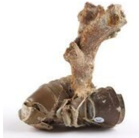
Fig. 8. Sea sculpture , c. 1725, Jingdezhen, found in Vietnam, porcelain with underglaze decoration, shell and coral growths, 20 x 17.5 cm. Victoria & Albert Museum, London (FE.8-2007)