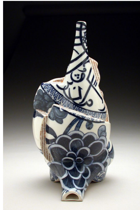
Fig. 3. Sin-ying Ho (b. 1962), Matrix no. 1 (reverse), 2005, porcelain, wheel-thrown and slip-cast, with hand-painted underglaze cobalt blue decoration, digital decal transfer, and terra sigillata high-fire reduction, 20 x 10 x 20 cm.

In works like Binary code and Matrix , Ho deliberately recreates the accidental distortion and fusion of vessels that can occur during firing, implicitly rejecting the pursuit of perfection that drove the porcelain industry for centuries. For the imperial sponsors of this industry, however, the uncertainties of firing were as remote and unimportant as the lives of the ceramicists who labored for them. Their only desire was the creation of flawless pieces, to exact specifications. In Jingdezhen, an imperial presence was first established to ensure this perfection during the Song dynasty (960–1279), with the founding of an office in 1082 to monitor production and punish any irregularities. In the Yuan dynasty (1271–1368) oversight was intensified by the founding of a Porcelain Bureau ( ciju ) in 1278, staffed by officials who supervised not only production but also the quality of clay and glaze. 20 During the Ming dynasty (1368–1644), supervision attained its peak when the court increased the volume of wares ordered for their use and demanded more difficult designs, some so intricate that fewer than one in a hundred was successful. Even simple wares were