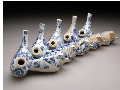
Fig.1. Sin-ying Ho, Binary code: The link , 2004, porcelain, wheel-thrown and slip-cast, with hand-painted underglaze cobalt blue decoration, digital decal transfer, and terra sigillata high-fire reduction, 2 x 8 x 1.5 cm.

The amorphous and fragmented forms of her first resolved expressions of this method, Binary code: The link (2004; fig. 1) and Matrix no. 1 (2005; figs. 2, 3) indicate no discernible function or unified composition. For Binary code , Ho fused a series of vases into a biomorphic sequence of rounded shapes that resembles a spinal column or a strand of DNA. In Matrix , bulging curves, attenuated contours, and severed edges taper upward toward an absurdly slender neck, while bodily associations are evoked by the transformation of protruding