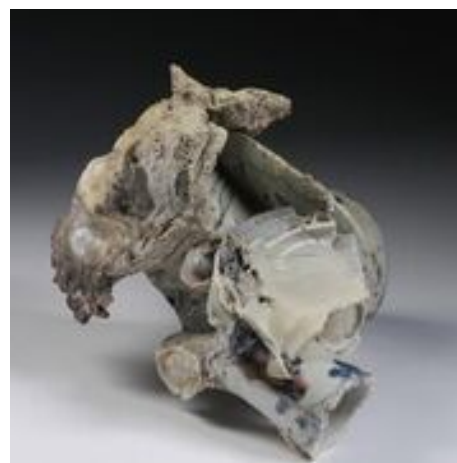
Fig. 7. Sea sculpture , c. 1725, Jingdezhen, found in Vietnam, porcelain with underglaze decoration, shell and coral growths, 17 x 22 cm. Victoria & Albert Museum, London (FE.7-2007)

It is in Binary code , Matrix , and other composite sculptures, however, that Ho best expresses the transgressive potential of deformation. The tension in her works between formal perfection and the vagaries of chance, transmutation, and taste has been discussed in European and Chinese contexts. Yet their most notable feature is their resistance to confinement within any single culture. Reflecting Ho's experience as a citizen of multiple countries, these are fundamentally "in-between" objects, fusing alternately convergent and conflicting cultural identifications. As such, they evoke comparison with a final category of deformity: the distorted amalgamations of porcelain, marine sediment, and organic matter often found in shipwrecked cargoes of export ware. Rather than the unpredictability of kiln flames warping and fusing vessels into unforeseen, often bewildering shapes, "sea sculptures," as they are often termed, are products of the ineluctable pressure of underwater currents and the intervention of deep-sea organisms. One example of such an object, now in the collection of the Victoria & Albert Museum, London, (fig. 7) vividly shows the