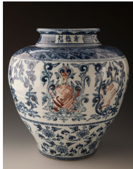
Fig. 5. Sin-ying Ho, Identity , 2001, porcelain, wheel-thrown, with hand-painted underglaze cobalt blue decoration and digital decal transfer, 38 x 30.5 cm.

chinoiserie. From a steady stream of ceramics, silk, lacquer, and other luxuries, this exchange rapidly expanded in the eighteenth century to satisfy a taste for exoticism among the elite and, increasingly, a middle class enriched by new commercial opportunities, achieving its peak in the 1750s. 37 Three centuries later, Ho was inspired to use ceramics, especially blue-and-white porcelain, by her study of this history and the "cross-cultural fertilisation" it represents. 38 Her earliest pieces, such as Identity (2001; fig. 5), are intended to resemble export ware, and draw inspiration for form and ornament from her study of trade ceramics in museum collections. 39 In addition then to the Chinese