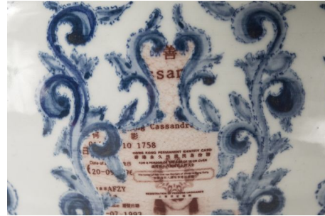
Fig. 6. Sin-ying Ho, Identity (detail), 2001, porcelain, wheel-thrown, with hand-painted underglaze cobalt blue decoration and digital decal transfer, 38 x 30.5 cm.