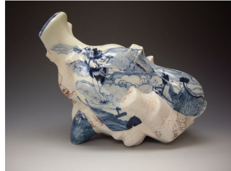
Fig. 10. Sin-ying Ho, Trilogy no. 1 , 2007–09, porcelain, wheel-thrown and slip-cast, with hand-painted underglaze cobalt blue decoration, digital decal transfer, and terra sigillata high-fire reduction.

This merging and deformation of cultural entities is expressed most clearly in the paired works Trilogy no. 1 (fig. 10) and Trilogy no. 2 (fig. 11). A fusion of characters from contemporary and classical fiction appears on these pieces, drawn together by their