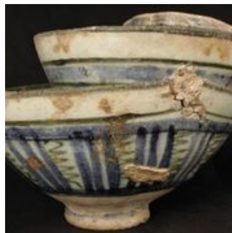
Fig. 4. Bowls , 14th century, Egypt or Syria, stoneware with painted underglaze decoration. Metropolitan Museum of Art, New York (11.61.1), public domain

In addition to their formal resemblance with misfires, the glaze effects that adorn Ho's works evoke comparison with another category of ceramic deformity: the unpredictable phenomenon of yaobian , or "kiln-transmutation." Chinese and European definitions of yaobian are closely tied to the tension between perfection and deformation in the history of Jingdezhen, and reveal a parallel desire to efface that which exceeds predetermined norms, subsuming the mysterious