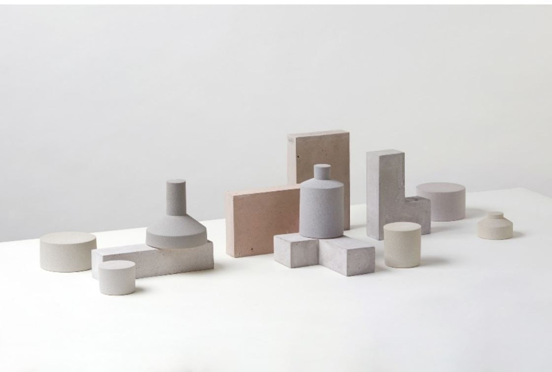
Construct. 2016. 40*25*25 cm Stoneware, pigments