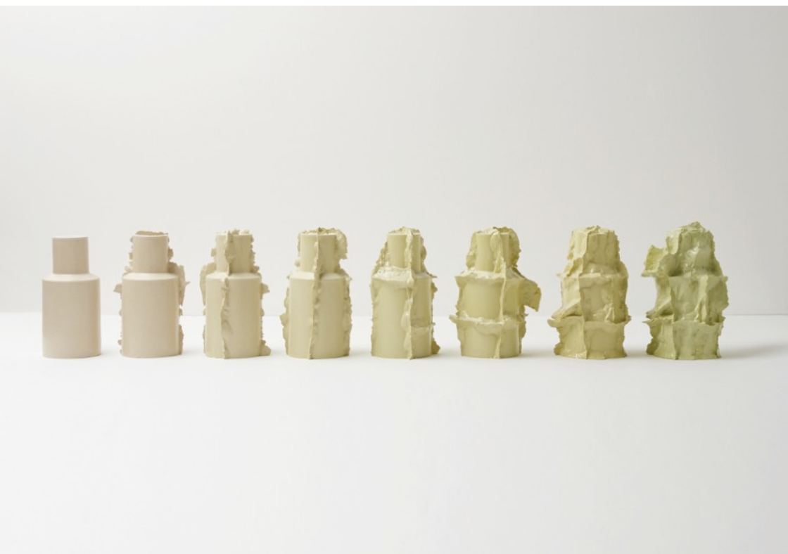
Metamorphoses II 2017. 80*20*12 cm Porcelain, glaze, oxides.