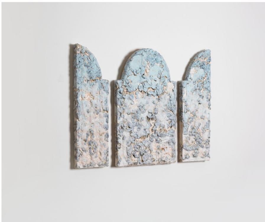
TRIPTYCH 2019 (H)70*(D)85*(W) 8 cm