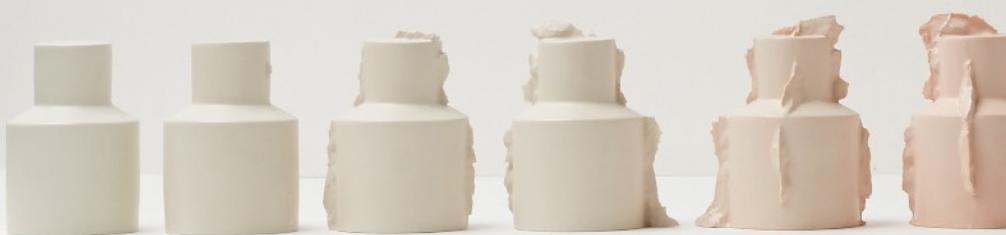
Metamorphoses. 2017. 120*15*15 cm Porcelain, glaze, oxides.