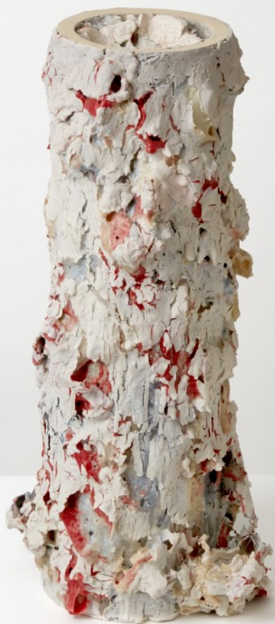
CERA vessel 2019 (H)70*(D)31 cm