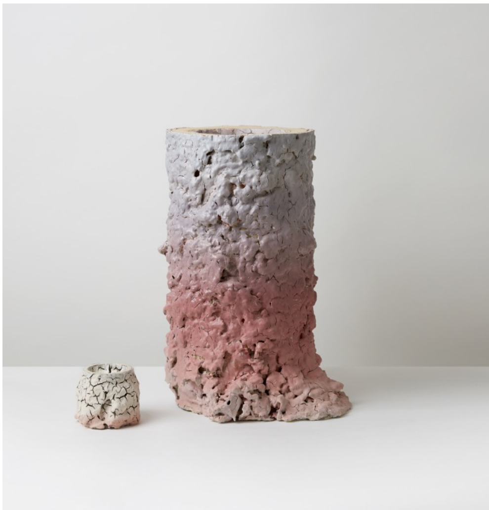
MICRO and SOMNUM vessels 2019 (H) 15*(D)12 cm (H)70*(D)37 cm