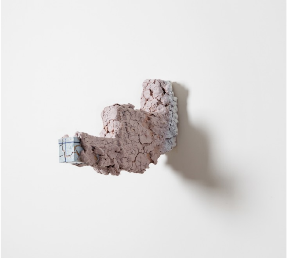
STAIRS 2019 (H)70*(D)28*(W) 10 cm