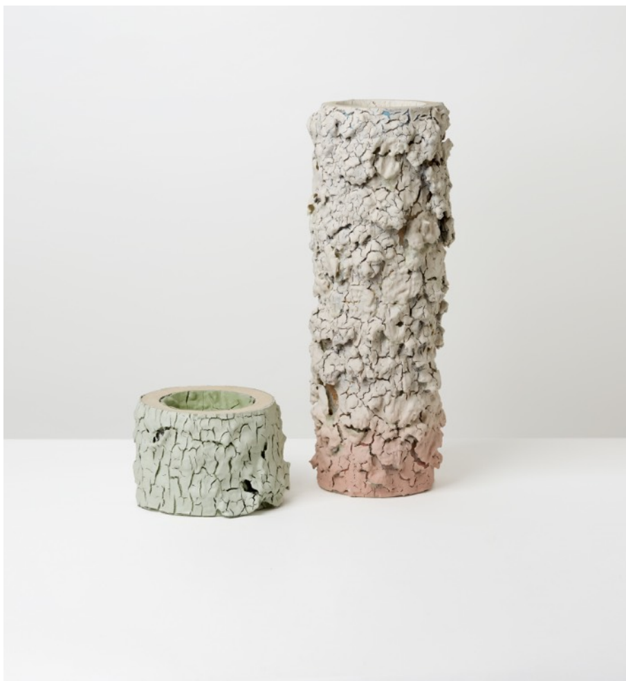
MINT and WATERFALL vessels 2019 H(22)*D(17) cm