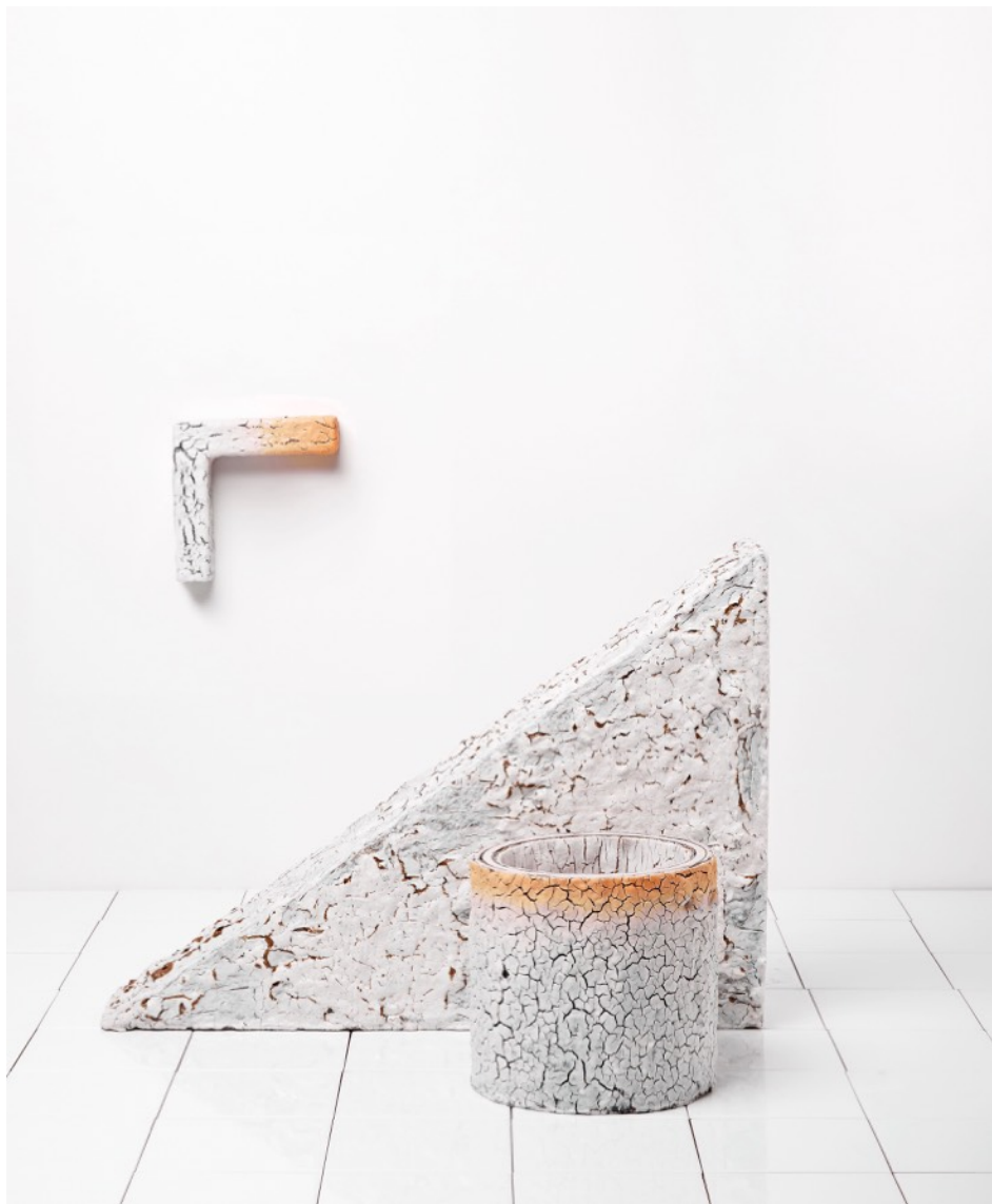
STILLIFE 2017 80*60*45cm Porcelain, stoneware, pigments