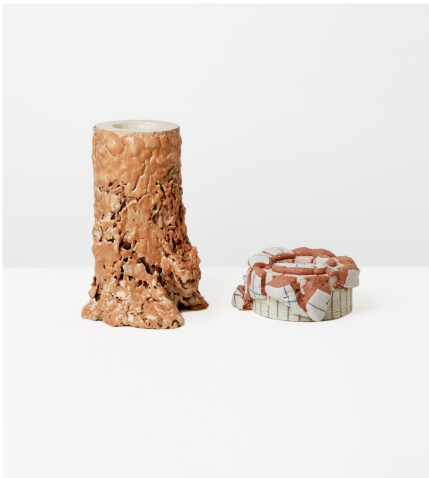
MELT and ARCHEO vessels 2019 (H)46*(D) 21cm (H)15*(D)23 cm