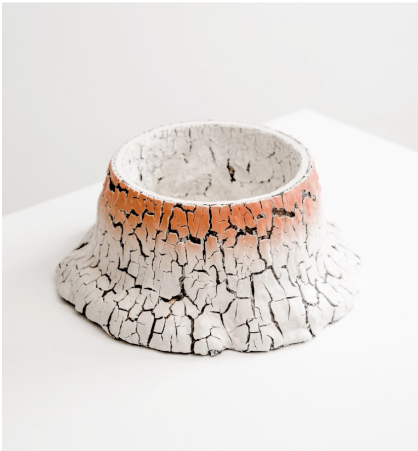
Collapse 2018 H(30)*D(32) cm