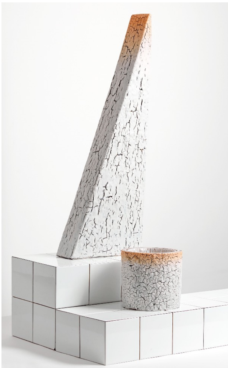
DUE 2017. 120*100*55 cm Porcelain, Stoneware, glazes