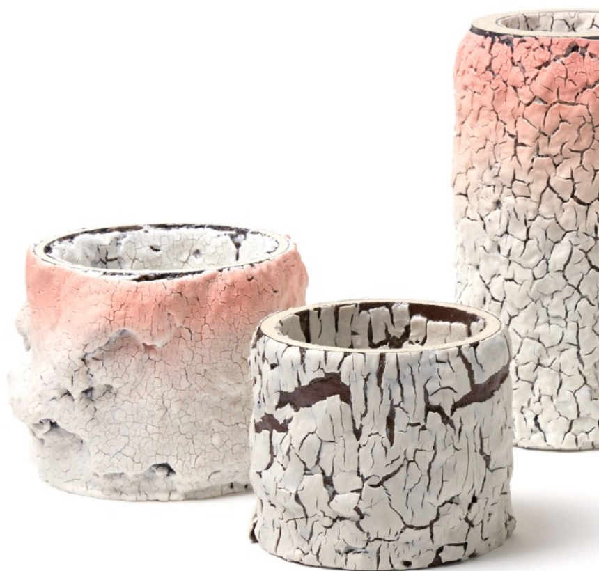
Barkskin 2017. Stoneware, glazes, porcelain.