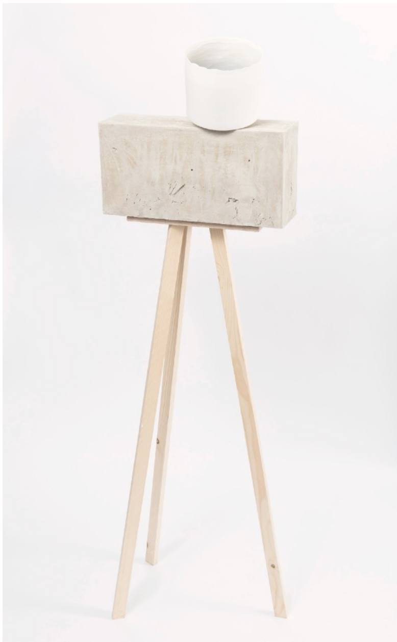
Mist 2017. 120*35*30 cm Porcelain, concrete, wood.