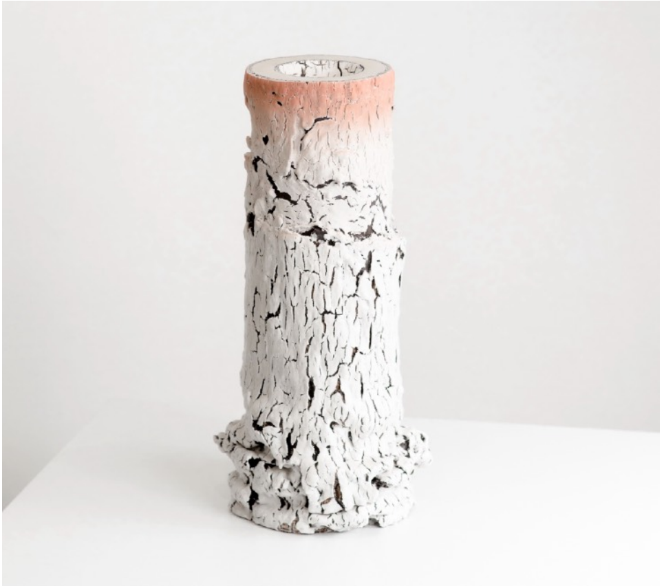
Fading 2018 H(75)*D(28) cm