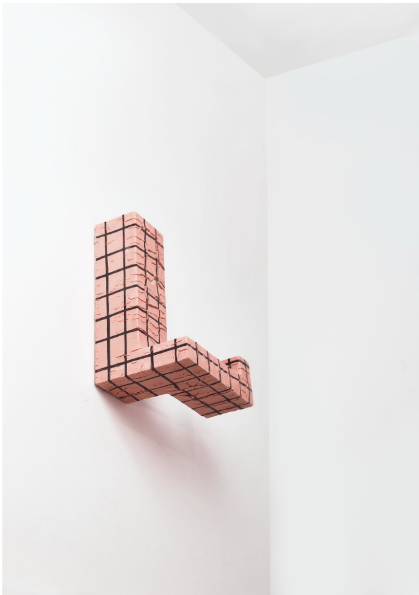
Factory I 2018 H(32)*W(12)*L(22) cm