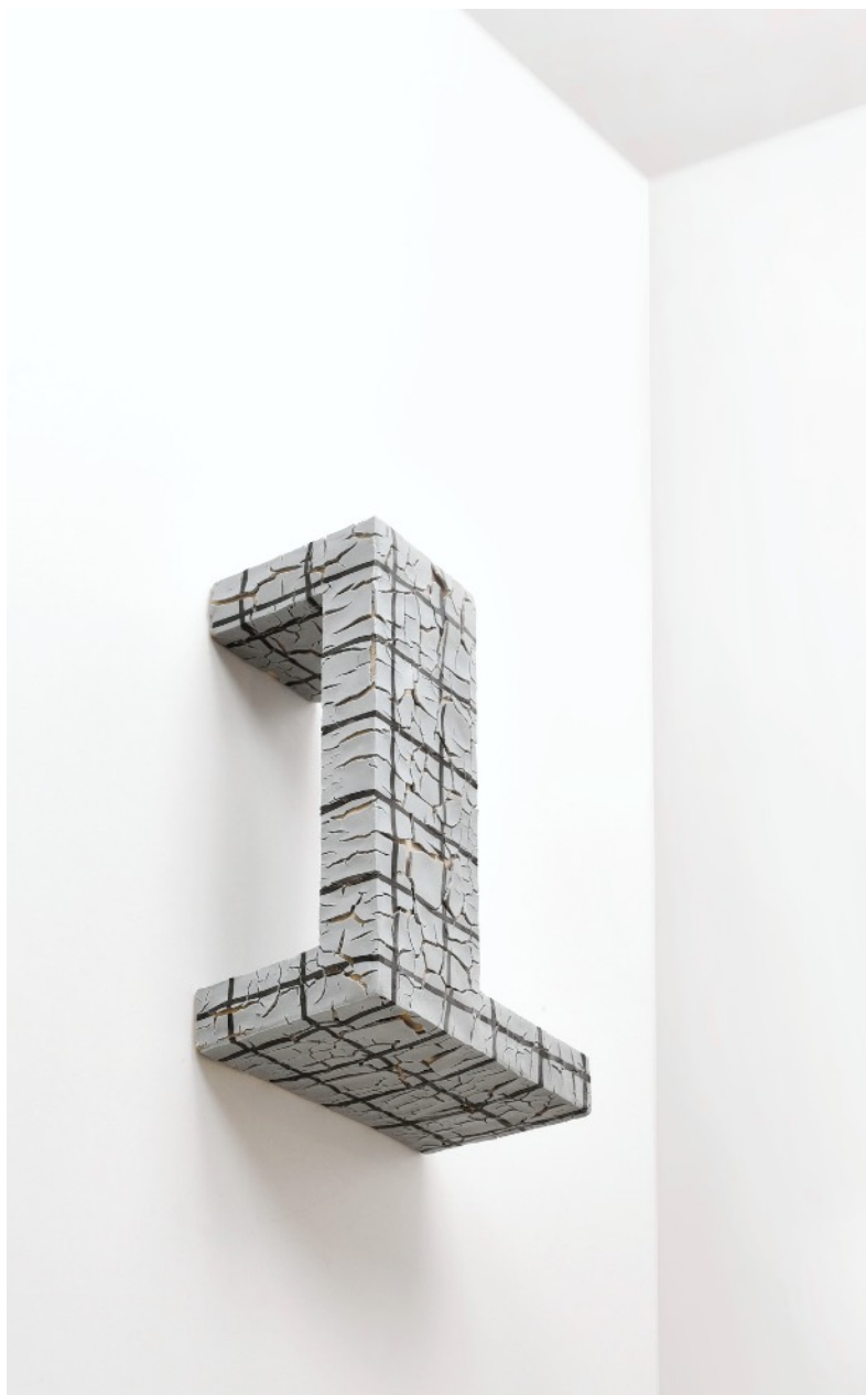
Factory II 2018 H(32)*W(24*)L(15) cm