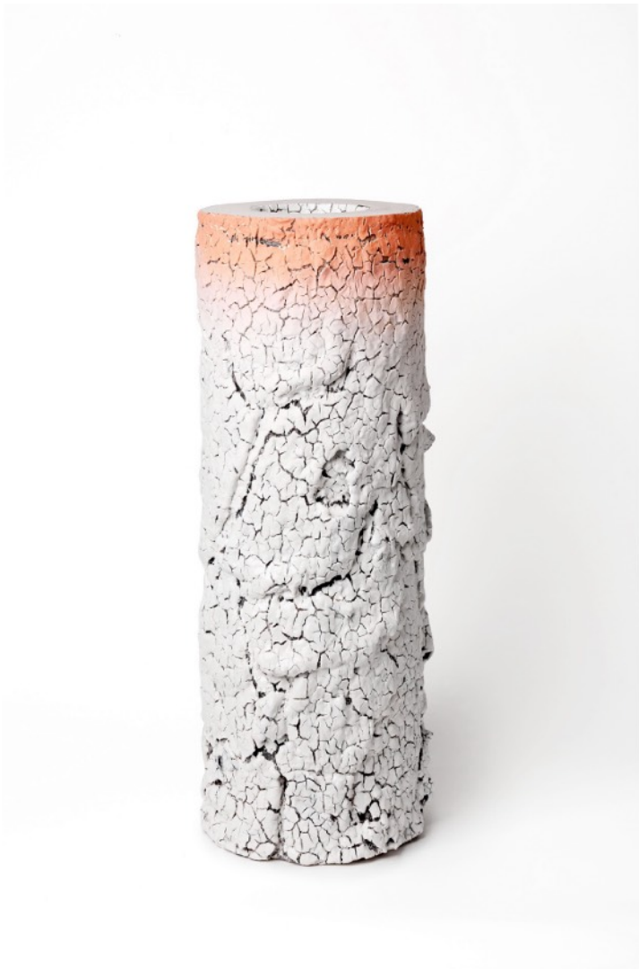
Reveal 2018 H(80)*D(30) cm