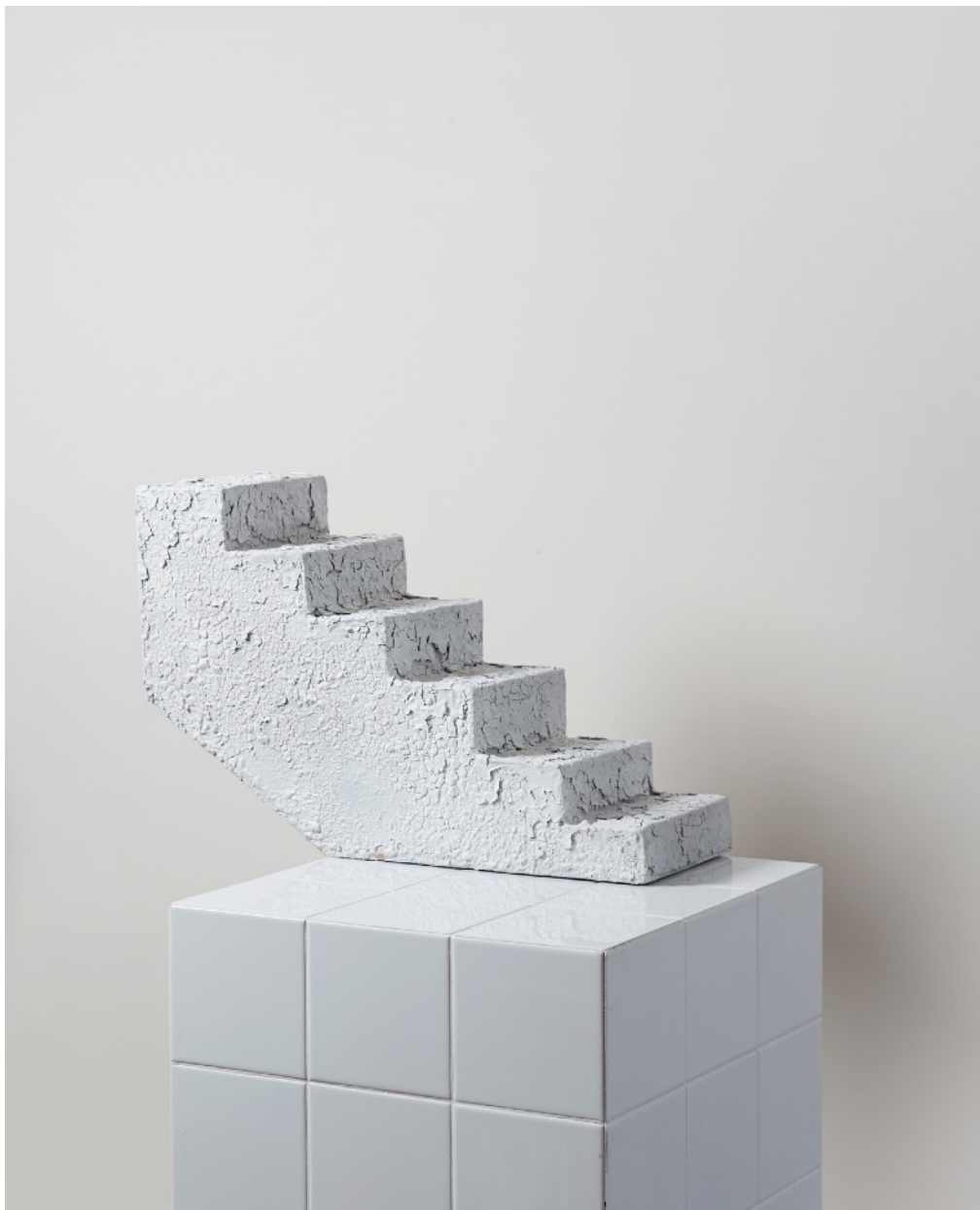
STAIRCASE 2019 (H)70*(D)25*(W) 30 cm