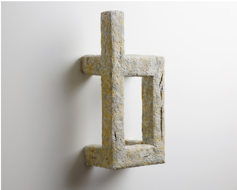
MEGALITH 2019 (H)70*(D)30*(W) 18 cm