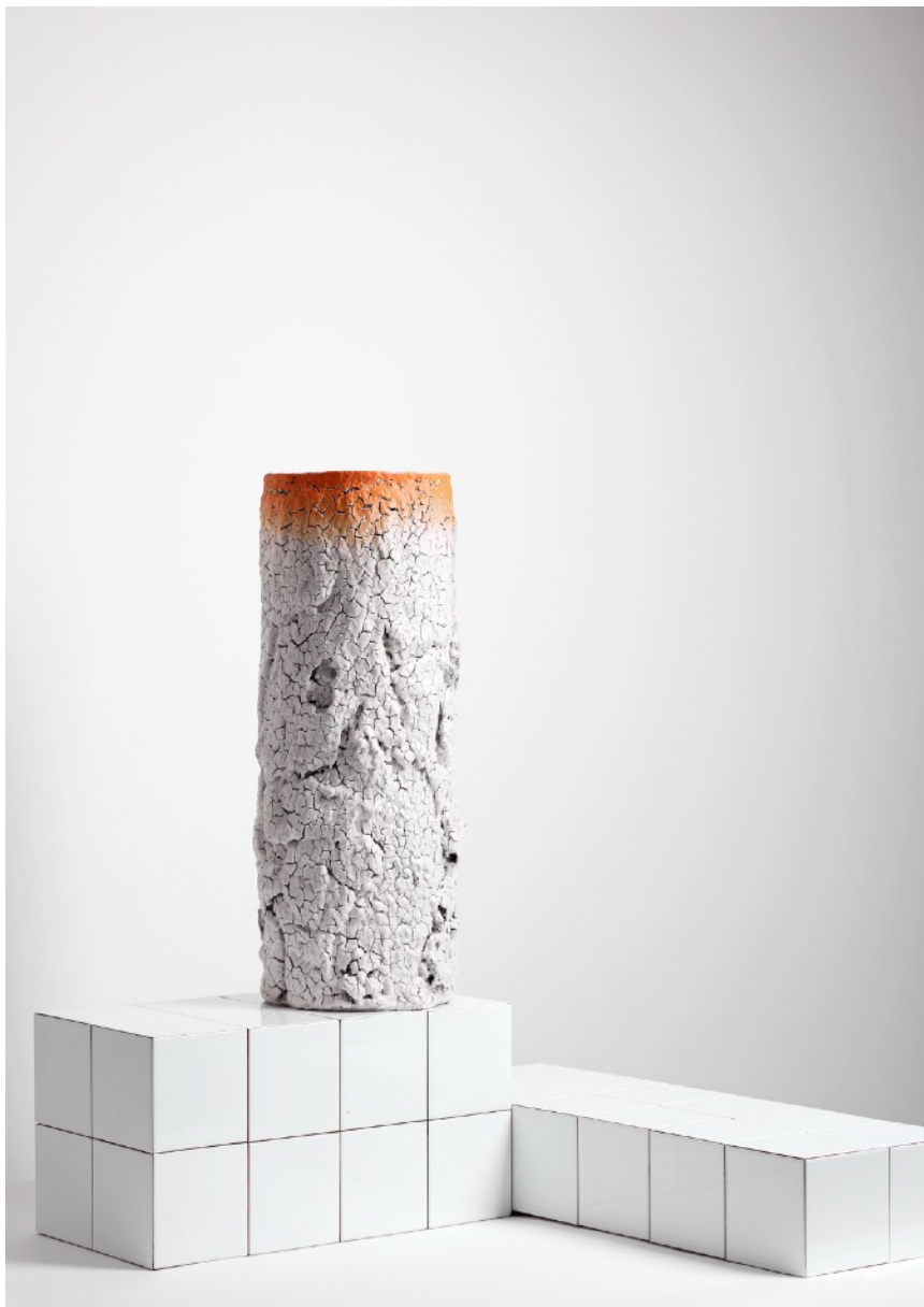
PILLAR 2017. 100*80*45 cm Porcelain, Stoneware, glazes