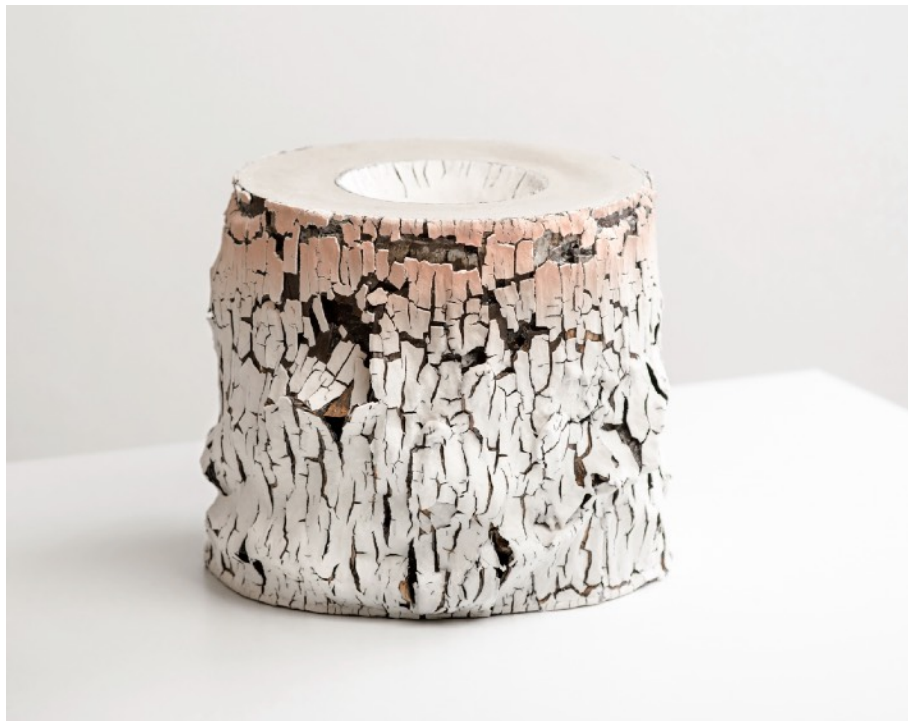
Post-Surface 2018 H(43)*D(35) cm