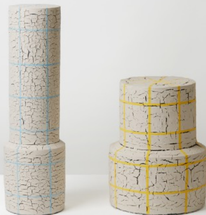
GRID vessels, 2019 70*25*25 cm 50*33*33 cm