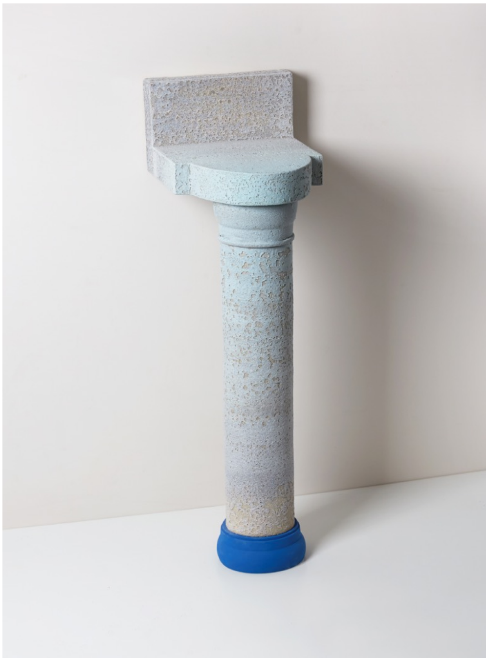
PILLAR 2019 (H)120*(D)40*(W)45 cm