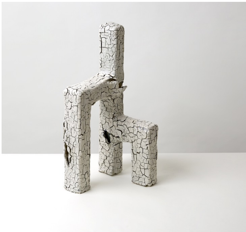
LITHOS 2019 (H)70*(D)30*(W) 35cm