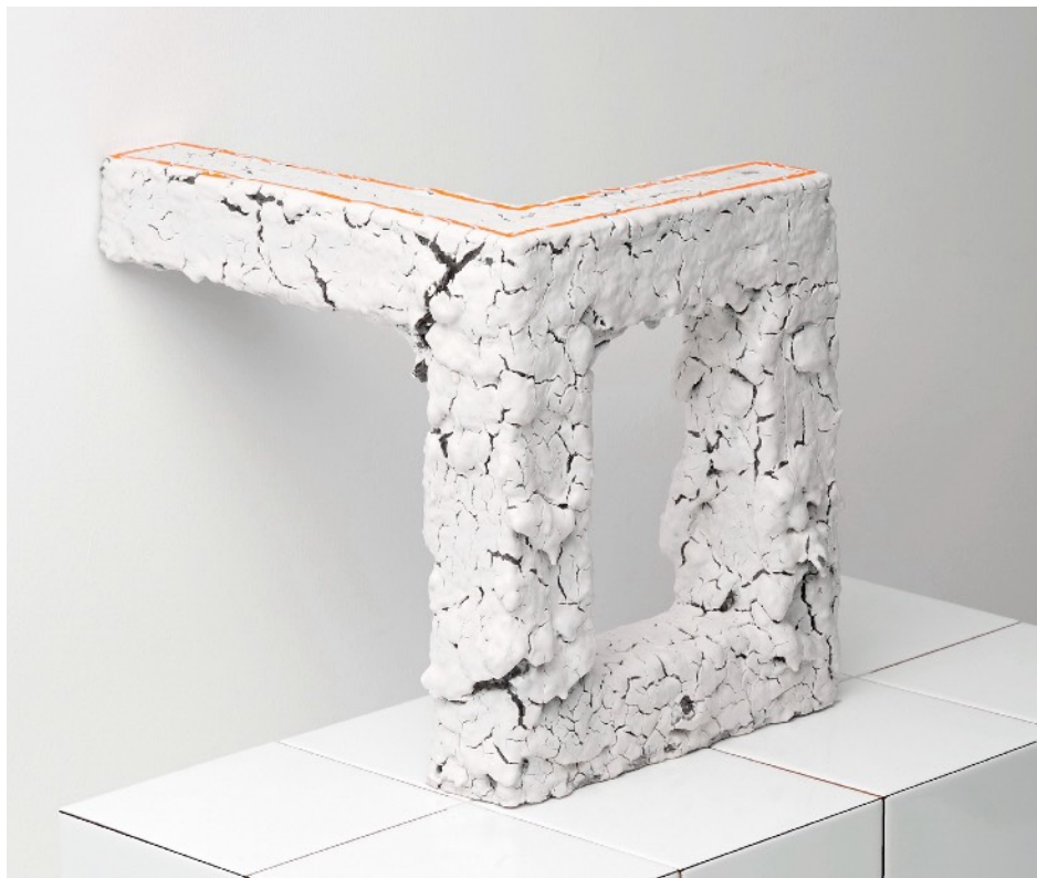
CORNER 1 2017 40*40*40cm Porcelain, stoneware, pigments