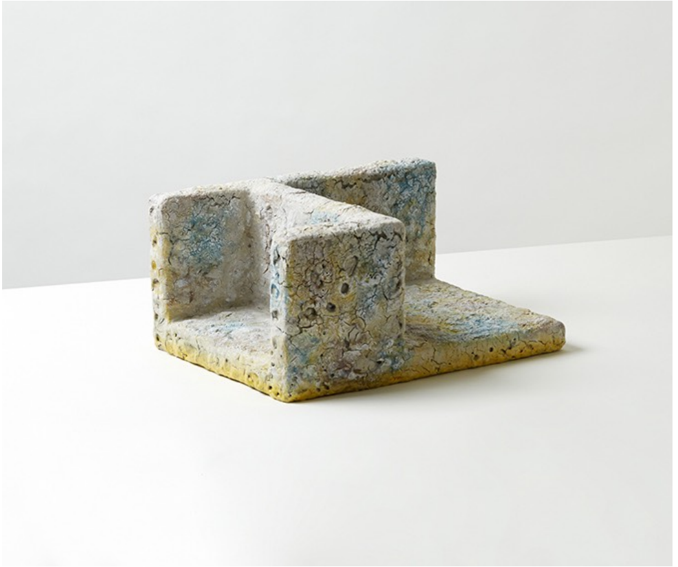
ROOMS 2019 (H)45*(D)40*(W) 25 cm