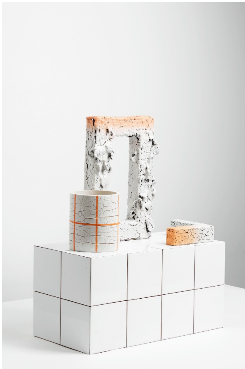
ARCHI 2017. Porcelain, stoneware, tiles.