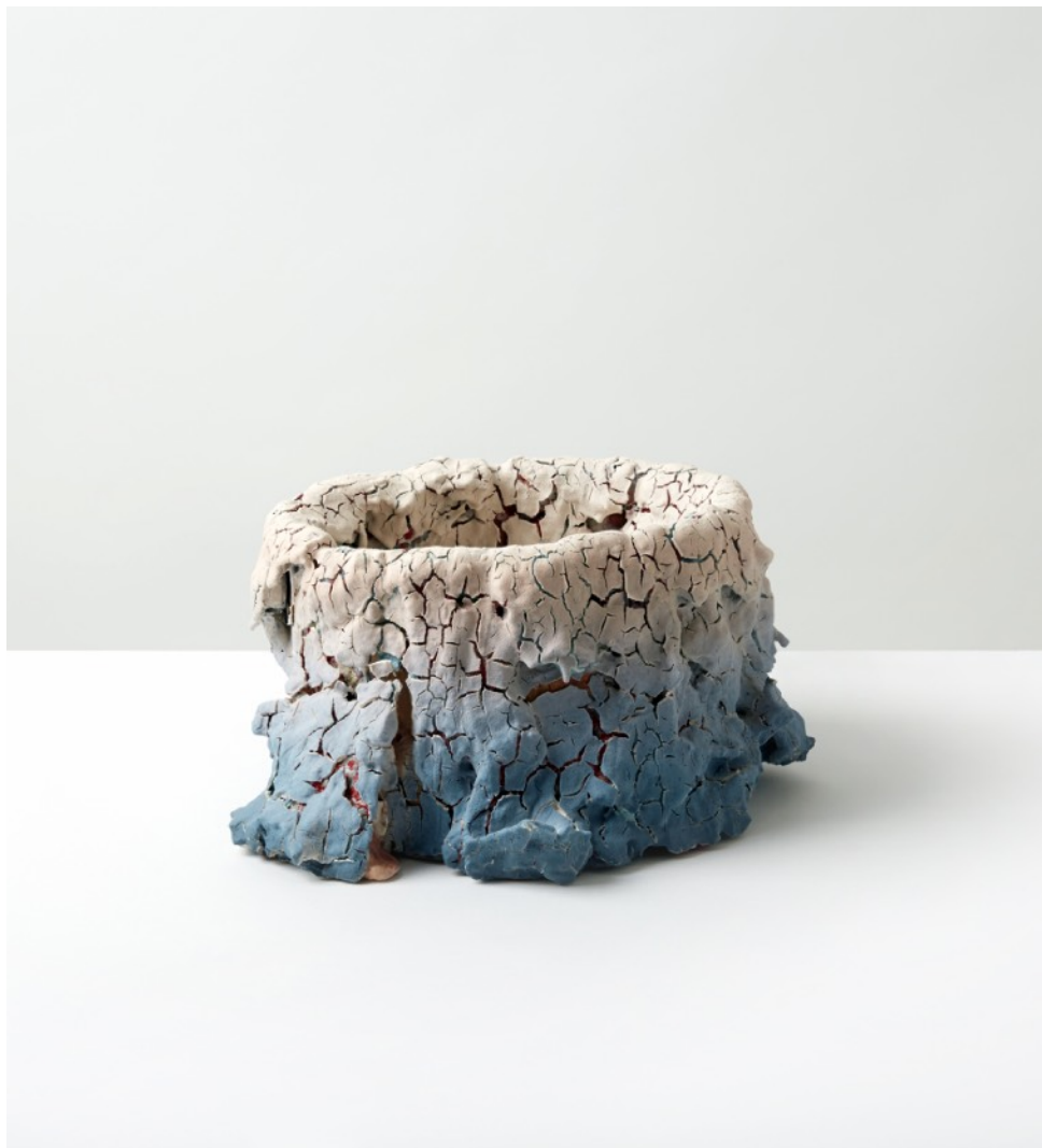
MIST vessel 2019 (H)30*(D)31 cm