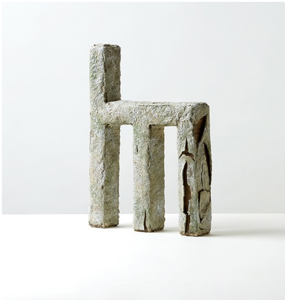
MEGALITH TRINUS 2019 (H)70*(D)32*(W) 12cm